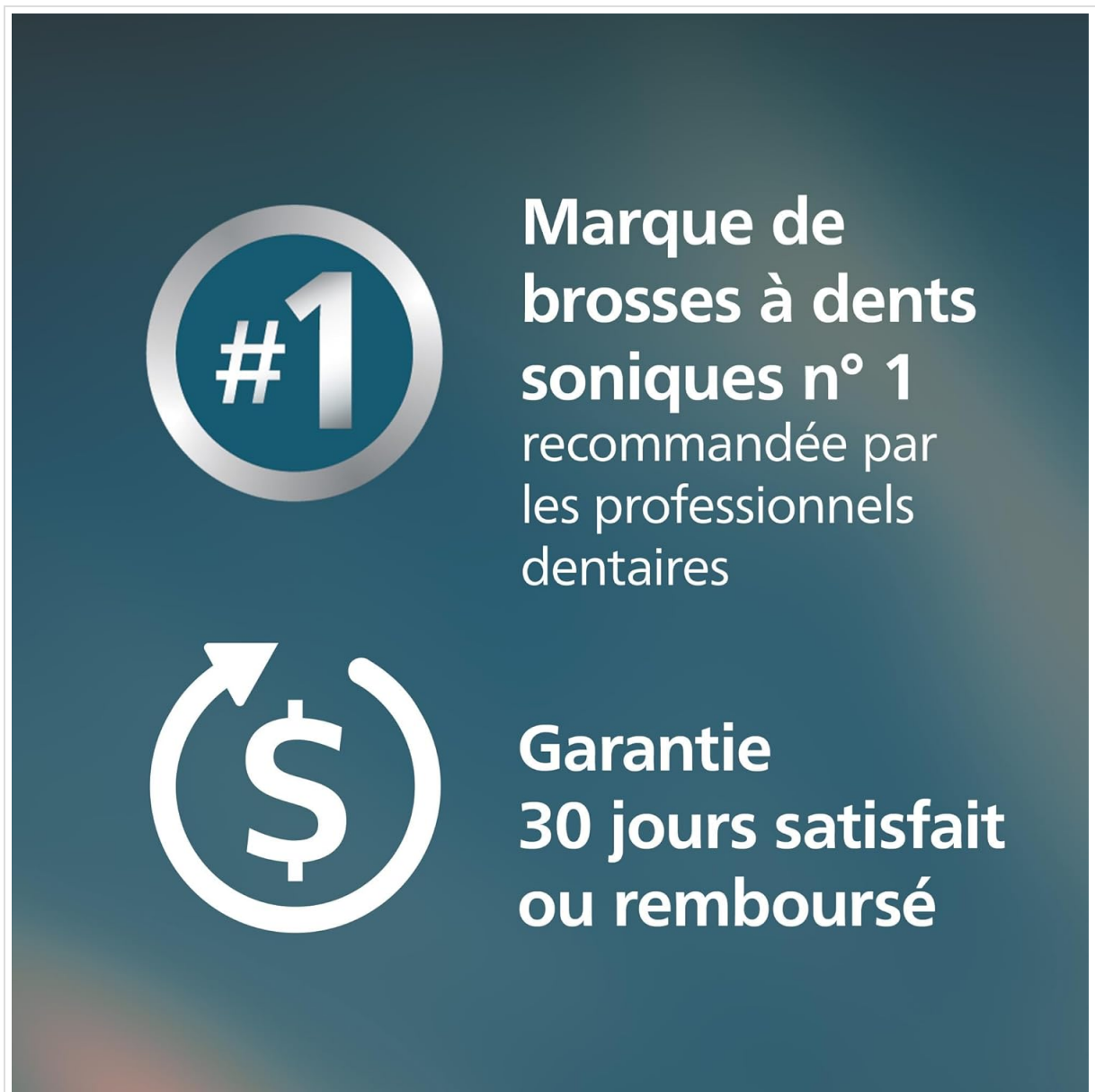
Image: An illustration highlighting Philips Sonicare as the #1 dental professional recommended sonic toothbrush brand and a 30-day satisfaction guarantee.

Philips offers a 30-day satisfaction guarantee for this product. For warranty claims, technical support, or further assistance, please refer to the official Philips website or contact their customer service directly. Keep your proof of purchase for any warranty-related inquiries.