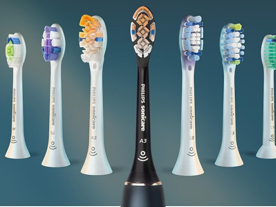
Image: An illustration showing different types of Philips Sonicare brush heads and their compatibility with the toothbrush handle.

Toutes les brossettes de recharge Sonicare conviennent à toutes les brosses à dents électriques Sonicare 4