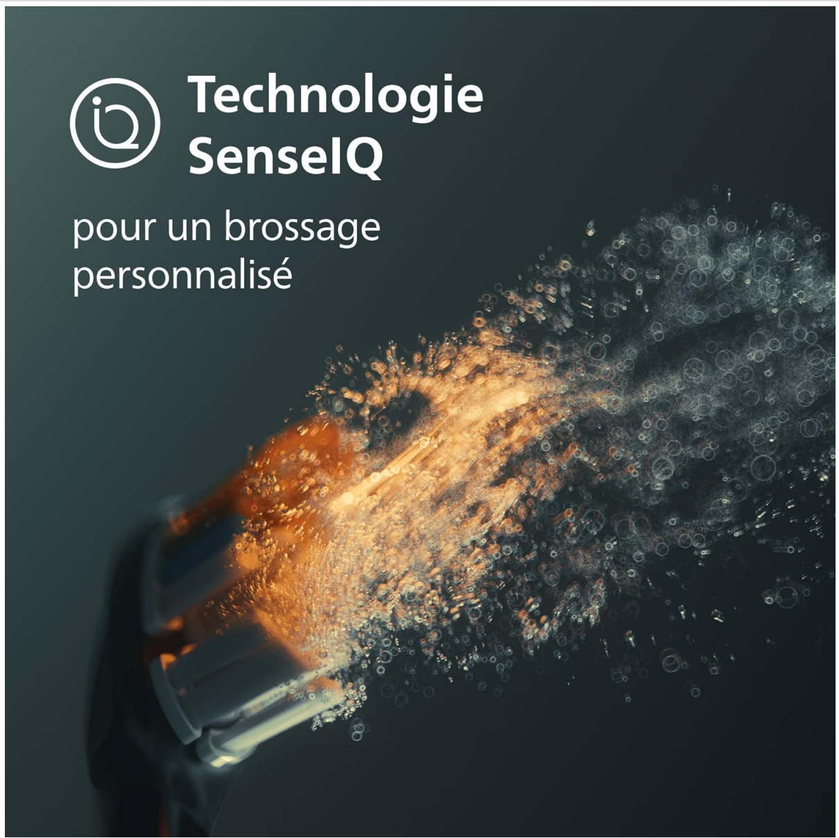
Image: A visual depicting the SenseIQ technology, showing sonic pulses and water droplets.