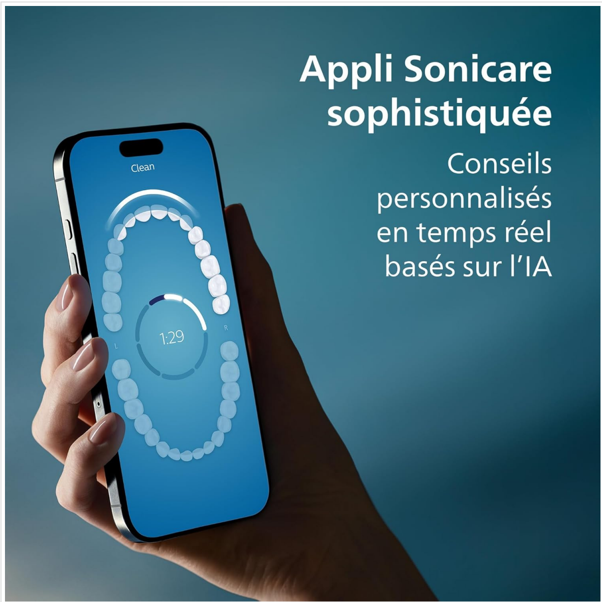
Image: A smartphone displaying the Philips Sonicare app interface, showing a dental arch and brushing timer.

Conseils personnalisés en temps réel basés sur l'IA