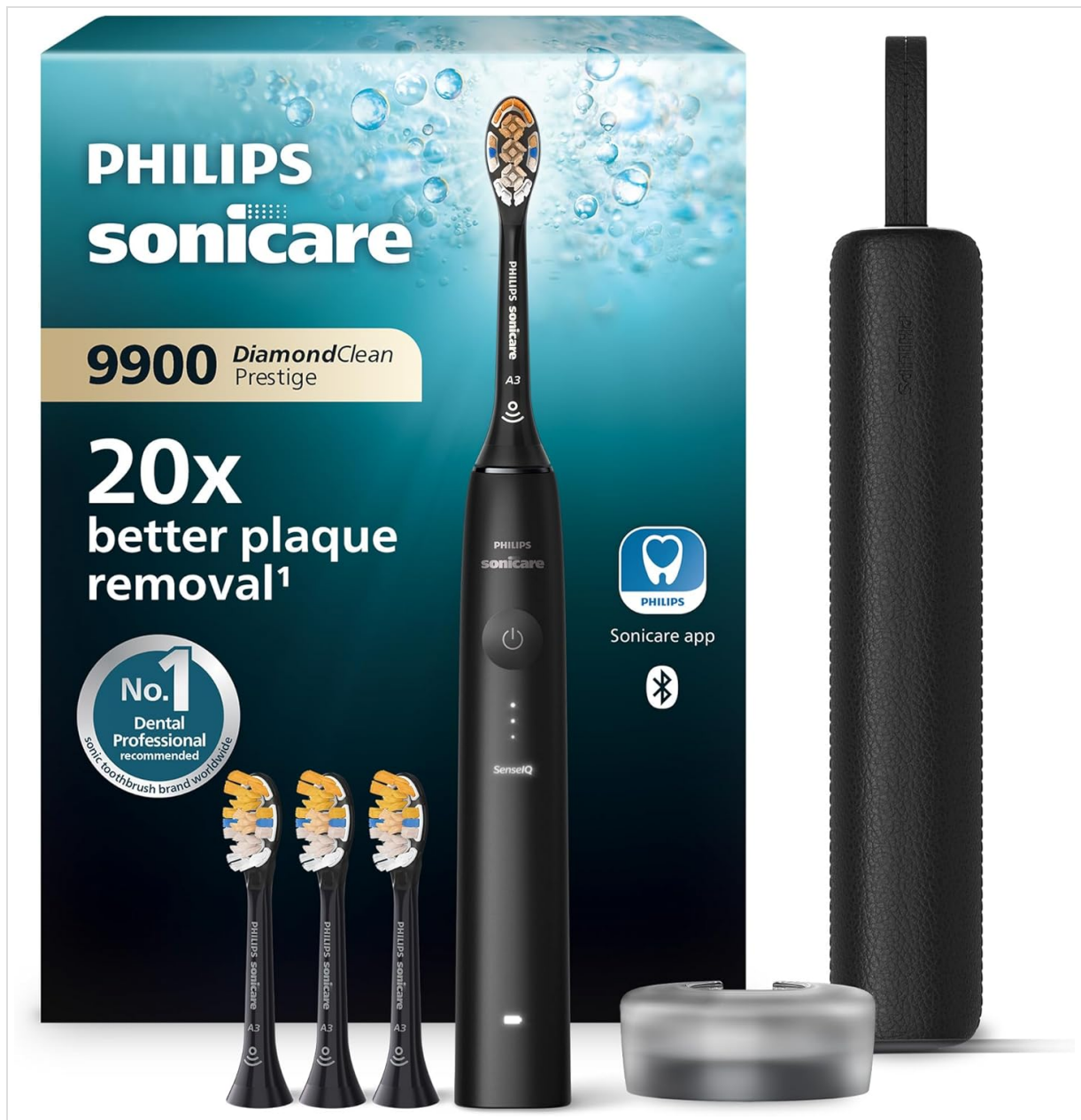
Image: The Philips Sonicare DiamondClean 9900 Prestige electric toothbrush, four brush heads, charging base, and travel case.