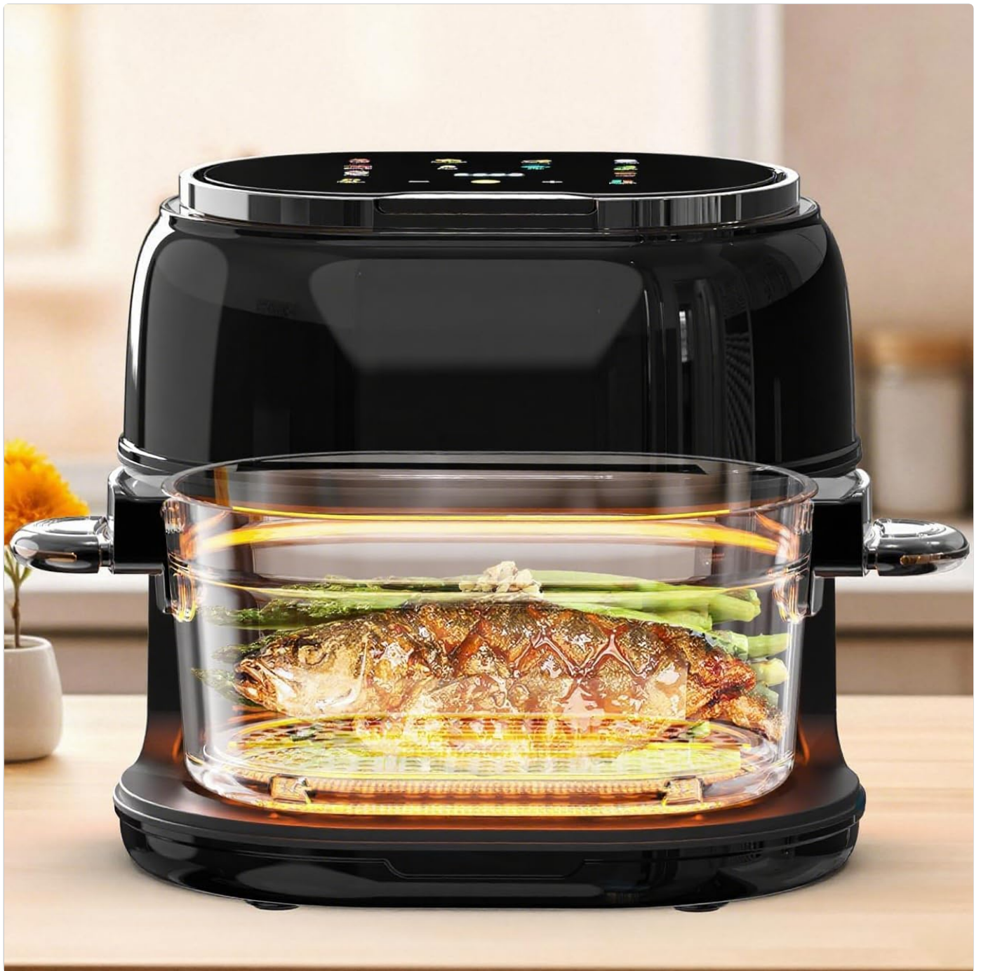
Figure 1: Main unit with glass pot and air fry tray in use.