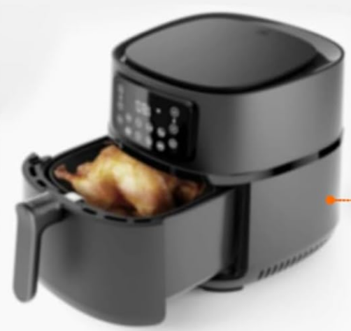
Figure 6: 8-in-1 Preset Functions.