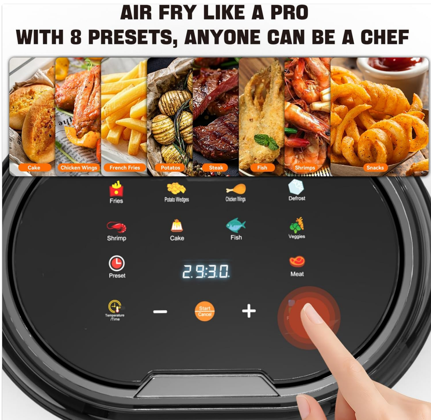
Figure 5: Digital Touchscreen Control Panel.

The digital touchscreen allows for easy control of the air fryer's functions.