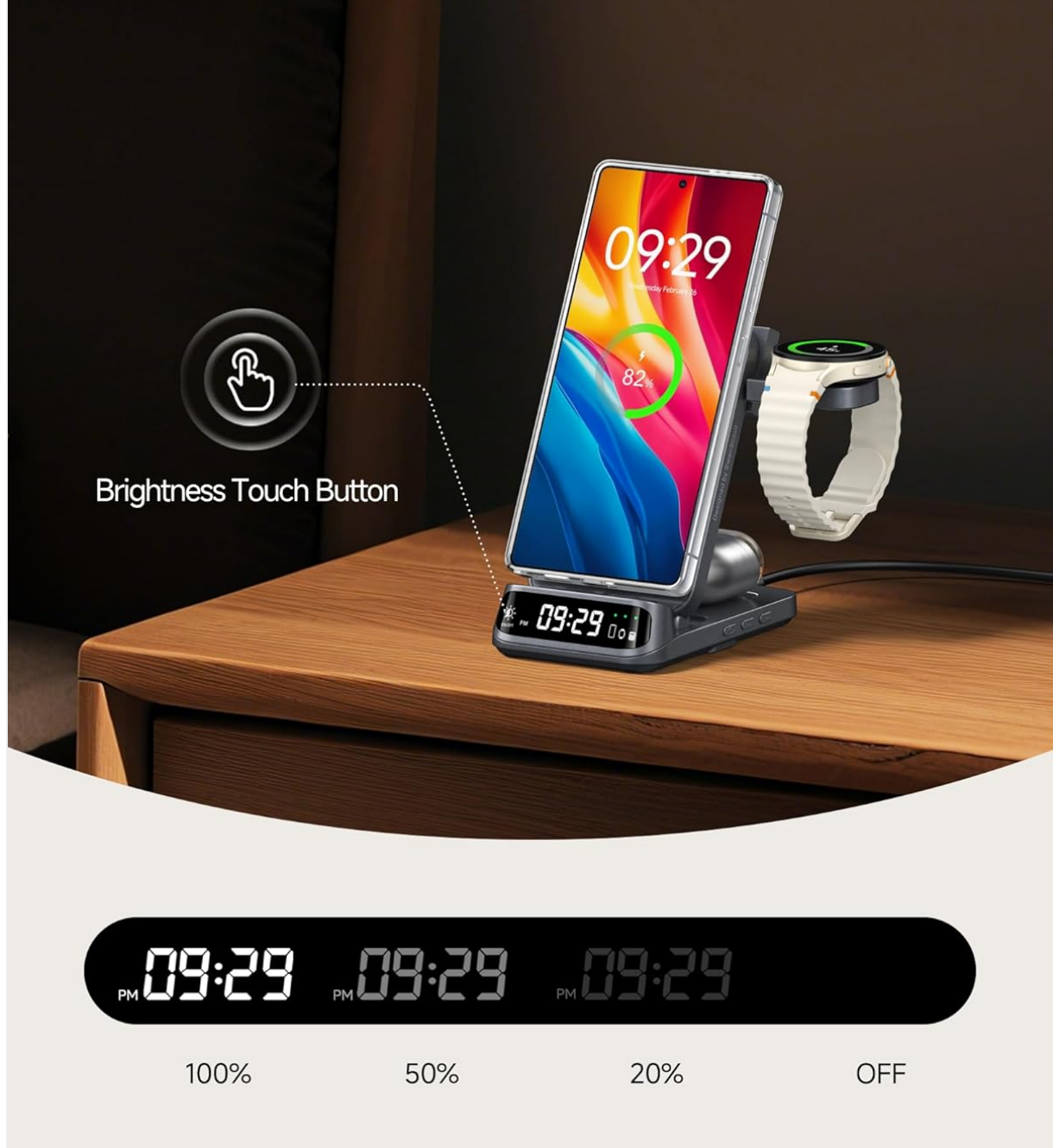
Image: The SwanScout 708SM charging station displaying its dimmable LED clock, with an illustration of the brightness touch button and different dimming levels.