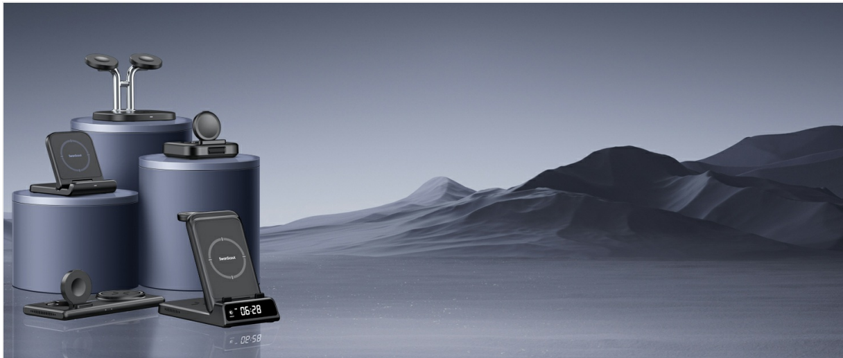
Image: The SwanScout 708SM charging station, showcasing its design and functionality.

This manual provides detailed instructions for the safe and efficient use of your SwanScout 708SM Magnetic Wireless Charging Station. Please read this manual thoroughly before operating the device and retain it for future reference.