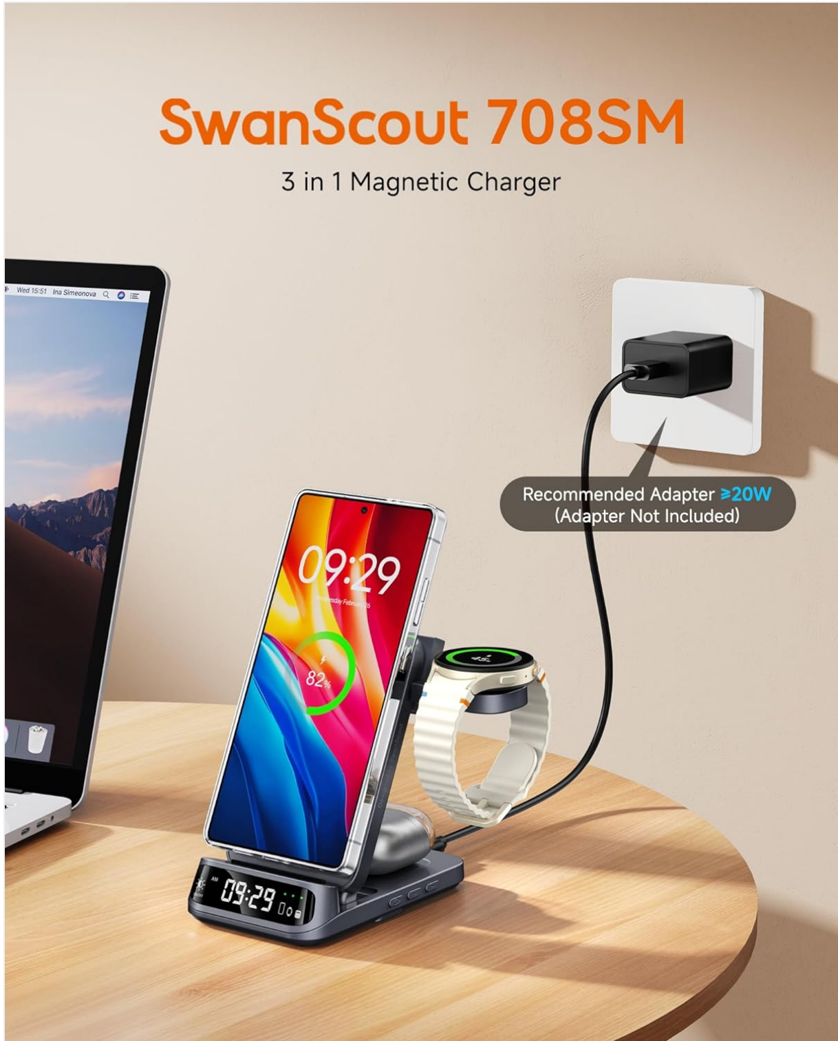
Image: The SwanScout 708SM charging station connected to a power source via its USB-C cable. A phone and watch are shown charging.