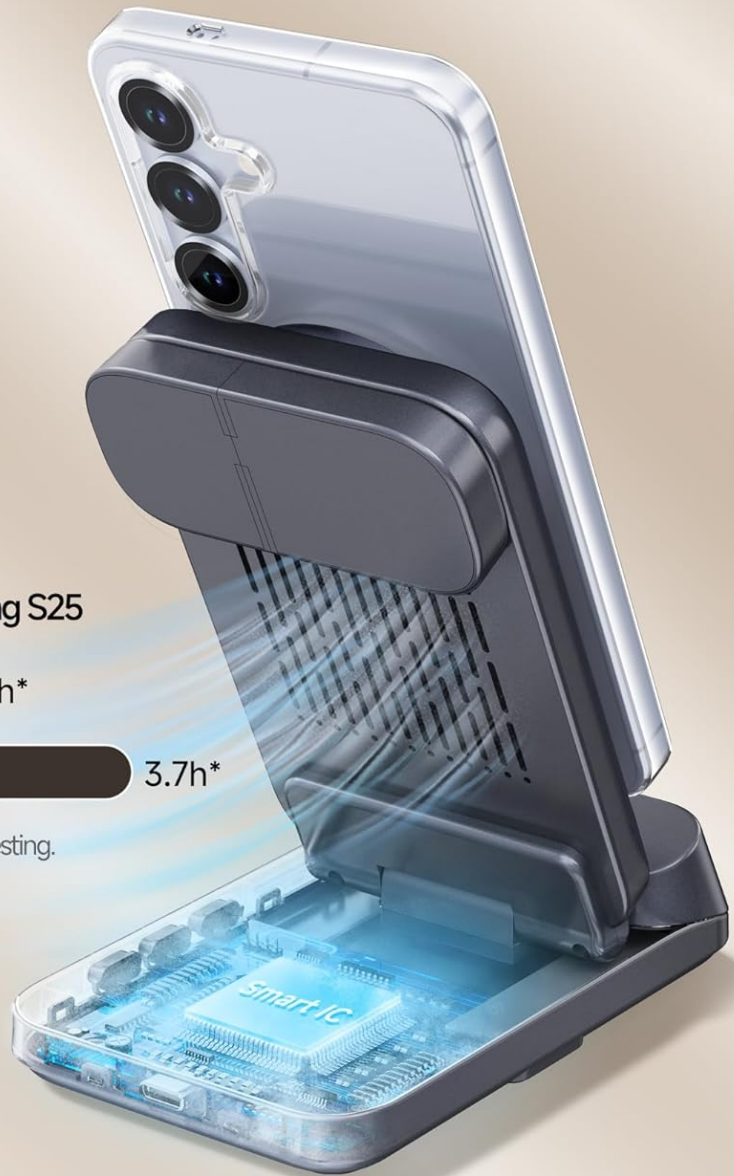
Image: An internal view of the SwanScout 708SM charger, highlighting its Smart IC chip and cooling vents for efficient and safe charging.