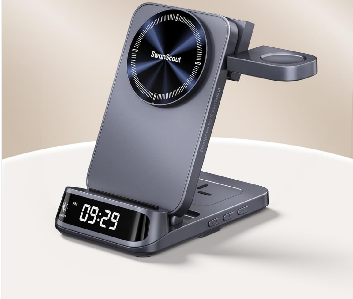
Image: A detailed view of the SwanScout 708SM charging station, emphasizing its elegant design, optical texture, and metallic finish.