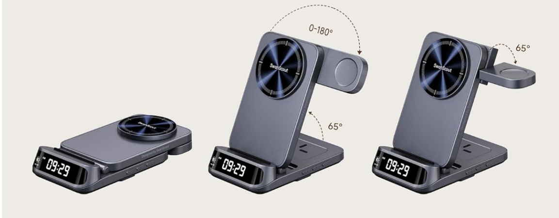
Image: The SwanScout 708SM charging station shown folded for travel and unfolded in various configurations, highlighting its portability and adjustable design.