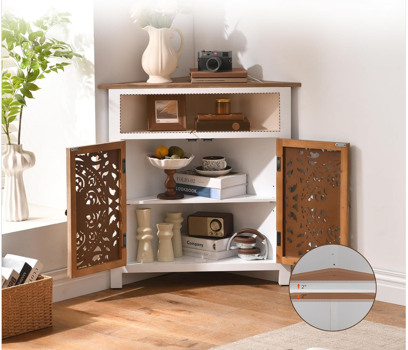
Image: Detail of the anti-tip safety strap for securing the cabinet to a wall.

Medium height, is a good partner for your storage