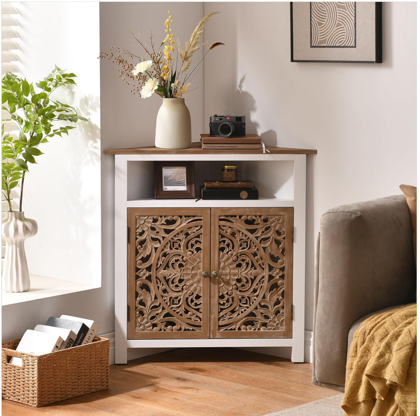
Image: The Ahokua Boho Corner Cabinet positioned in a living room corner, showcasing its design and open storage area.