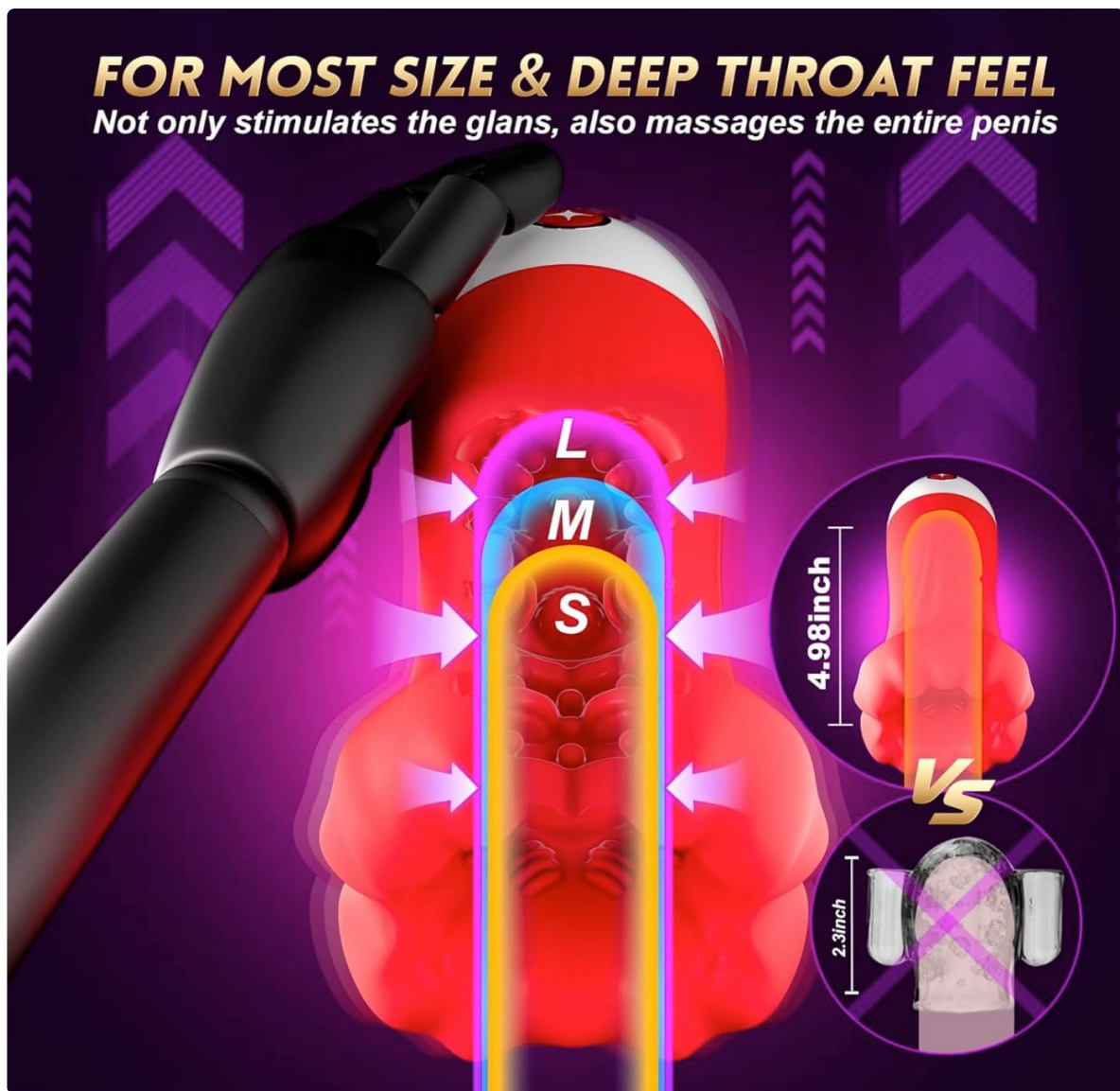
Image: Diagram illustrating the MM48628's dimensions and how its design provides a snug fit and stimulates the glans and entire length.