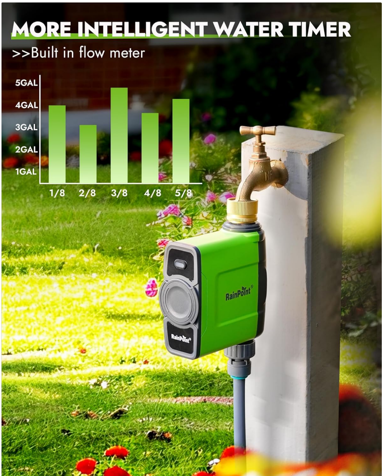
Image: The RAINPOINT Water Timer illustrating its built-in flow meter functionality, with a bar graph depicting water usage in gallons over various dates.