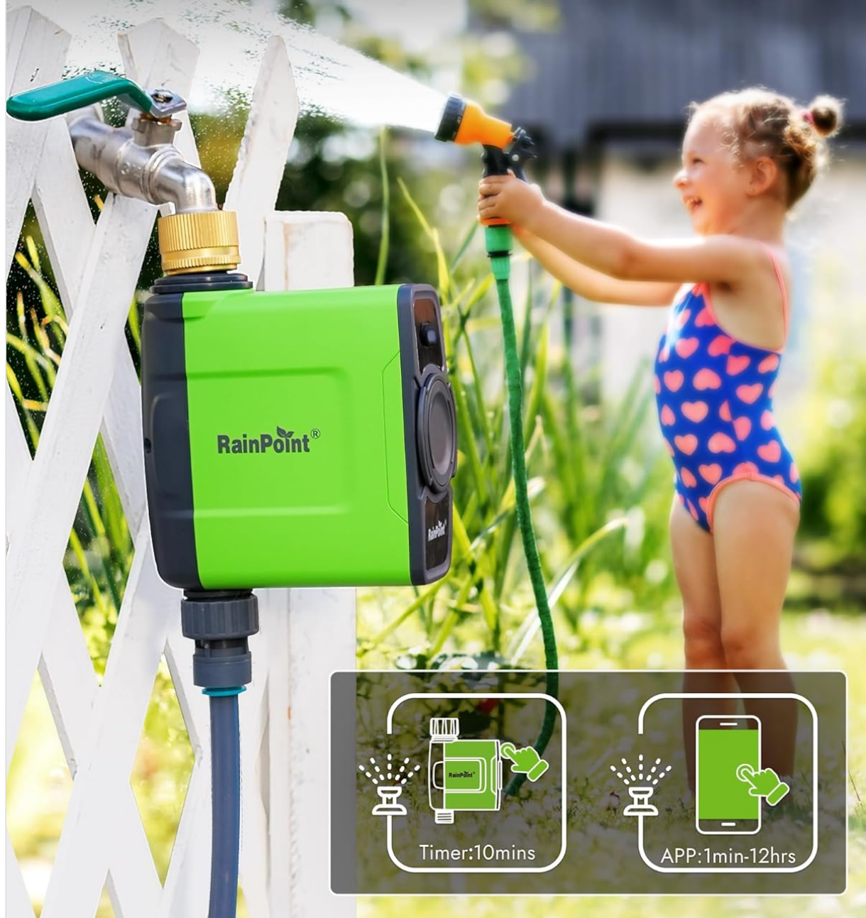
Image: A child watering plants, demonstrating the RAINPOINT Water Timer's two manual watering methods: a quick 10-minute option directly from the timer, or a customizable 1-minute to 12-hour option via the app.