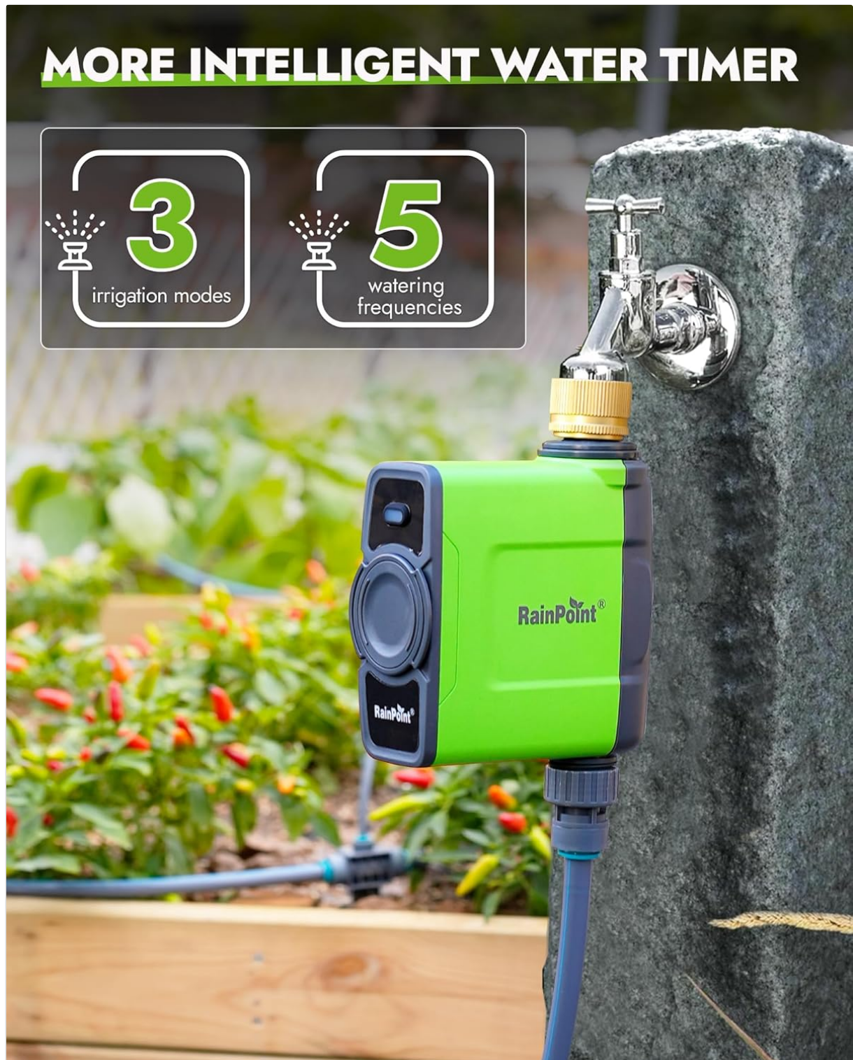
Image: The RAINPOINT Water Timer highlighting its three distinct irrigation modes and five customizable watering frequencies.

You can tailor your watering routine with five frequency options: daily, weekly, odd days, even days, or every 2 to 30 days.