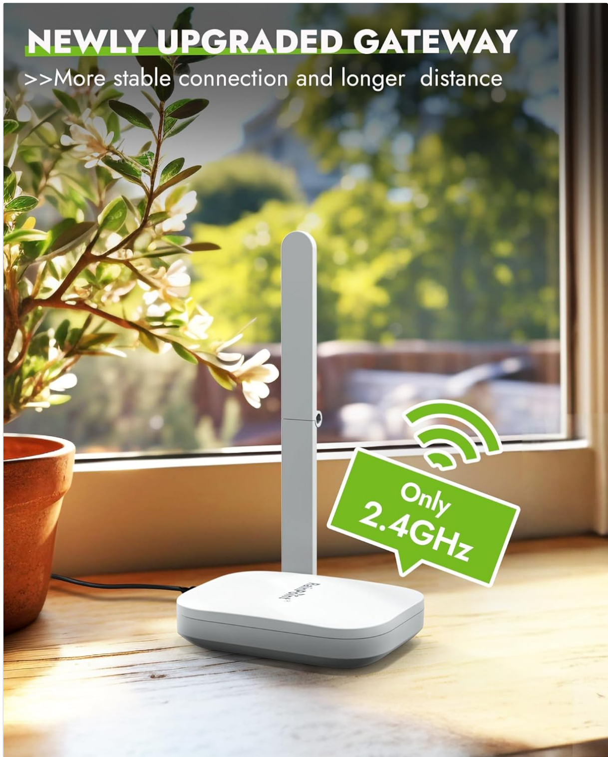
Image: The RAINPOINT HWG023 WiFi Gateway, featuring an antenna for enhanced connectivity. It requires a 2.4GHz WiFi connection.

>>More stable connection and longer distance