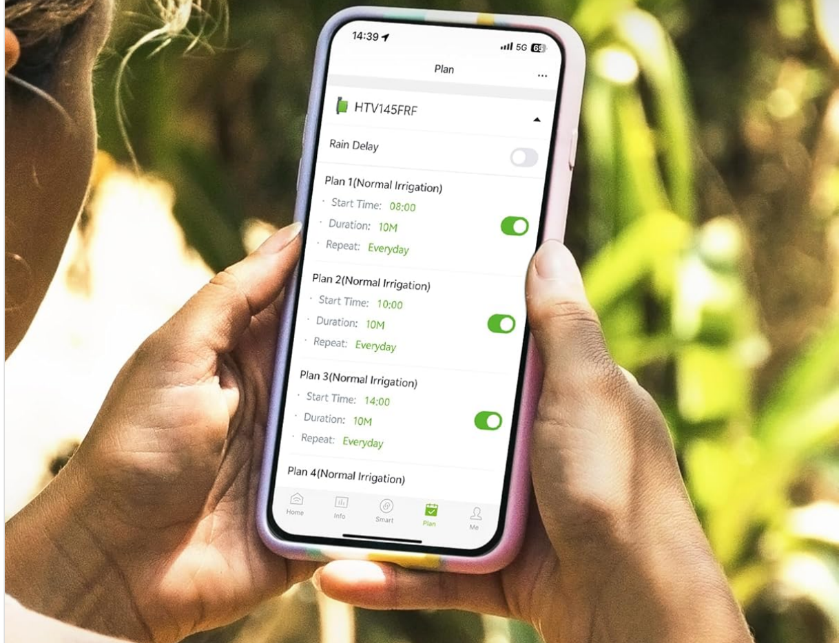
Image: A smartphone displaying the RAINPOINT app interface, illustrating remote control capabilities and irrigation plan setup for the water timer.