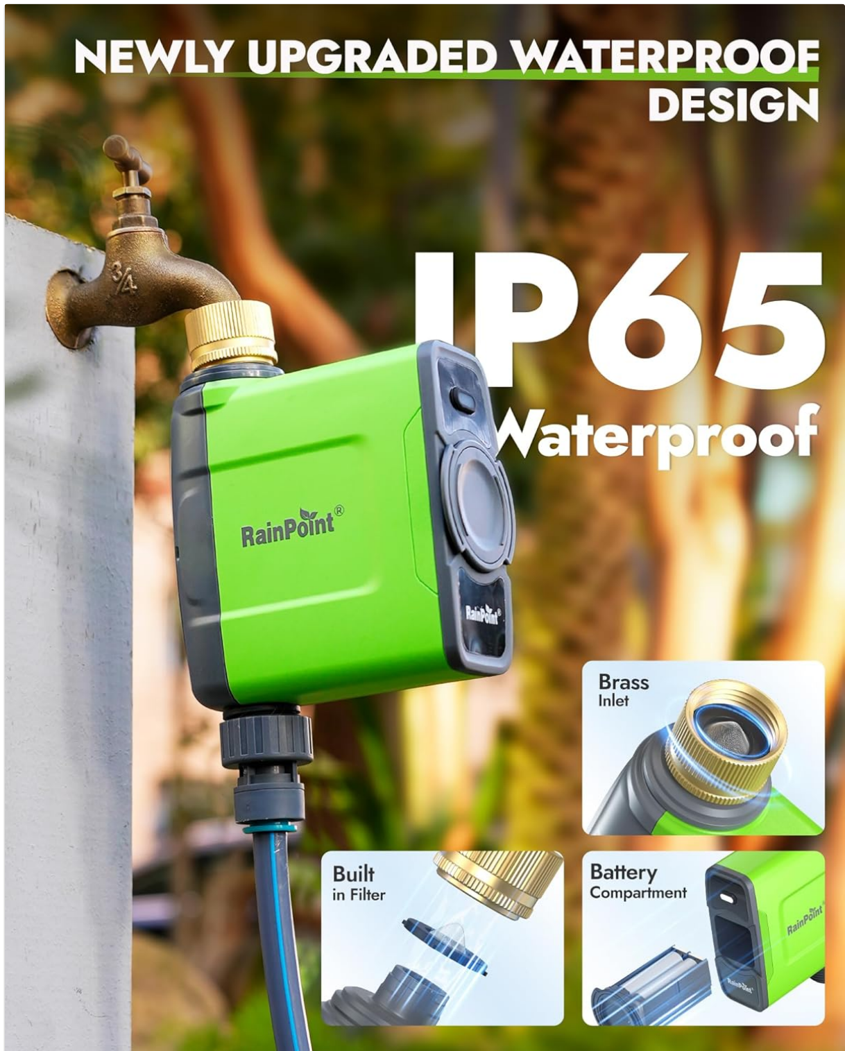
Image: The RAINPOINT WiFi Water Timer highlighting its IP65 waterproof rating, durable brass inlet, integrated filter, and accessible battery compartment.