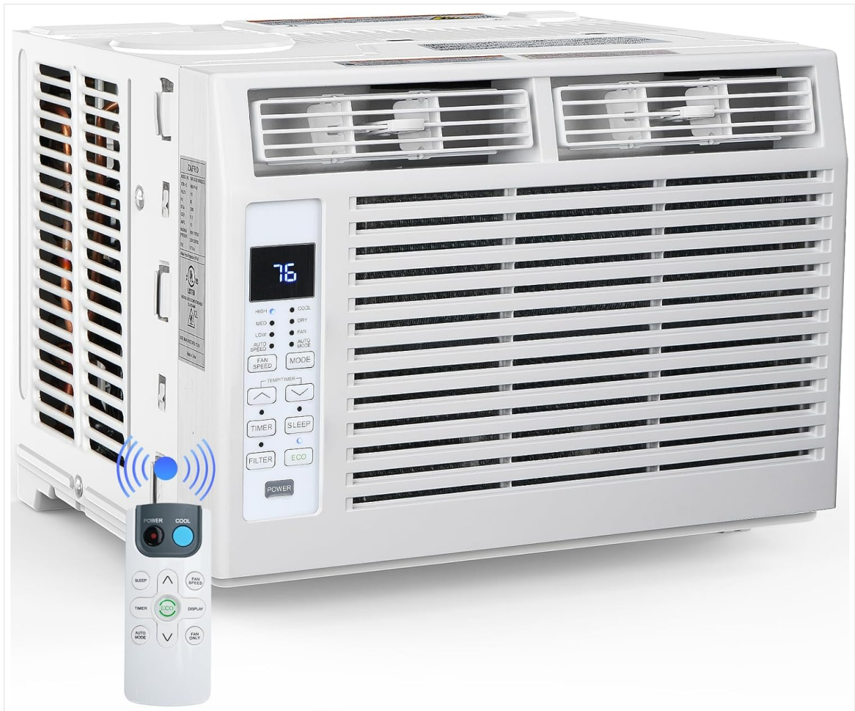
Figure 2.1: Front view of the Electactic 6,000 BTU Window Air Conditioner.