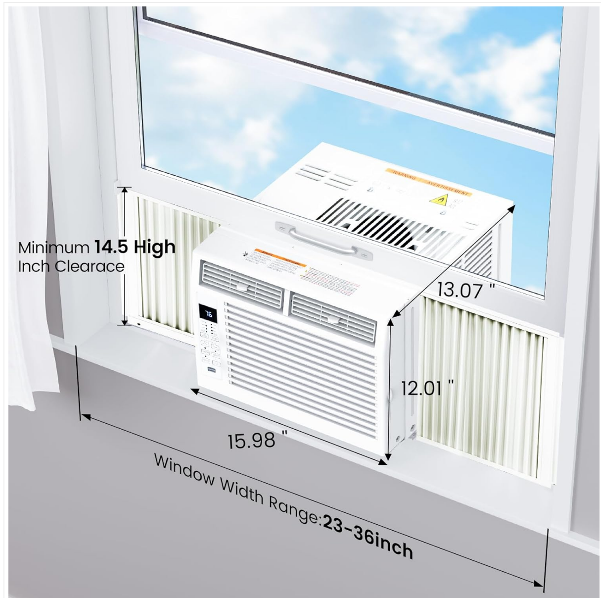
Figure 3.1: Diagram showing the air conditioner dimensions and required window width range (23-36 inches) and minimum clearance (14.5 inches high).

The air conditioner is designed for installation in standard double-hung windows with a minimum opening height of 14.5 inches and a window width range of 23-36 inches.