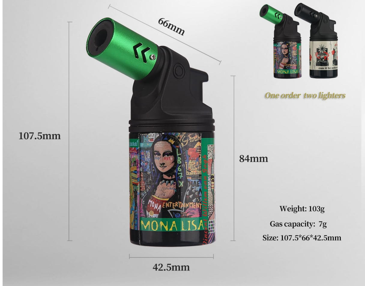
Image 2.1: The HONEST BCZ848 Butane Jet Flame Lighter. This image displays the overall design of the lighter, highlighting its compact form factor and distinctive pattern.