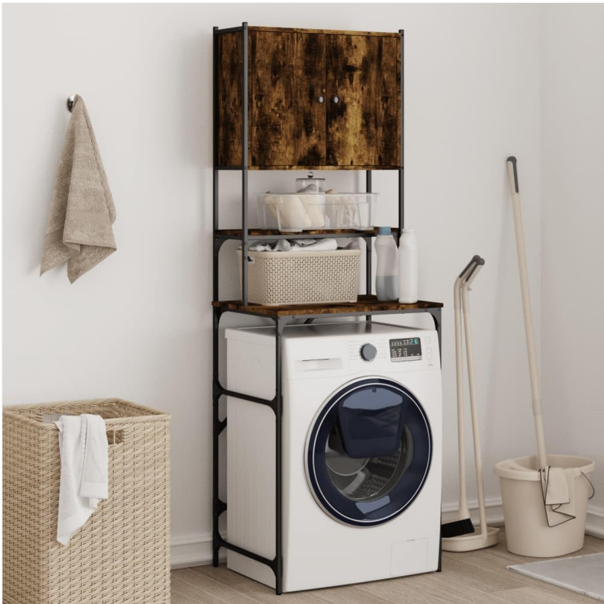
Image 1.1: The SHARK SHIP Washing Machine Cabinet installed over a washing machine, showcasing its storage capabilities for laundry essentials.