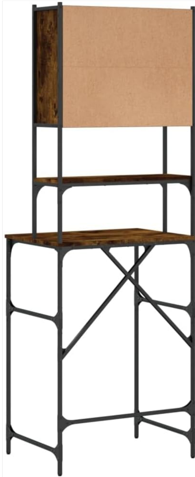
Image 3.2: Rear view of the cabinet, highlighting the back panel and frame design.