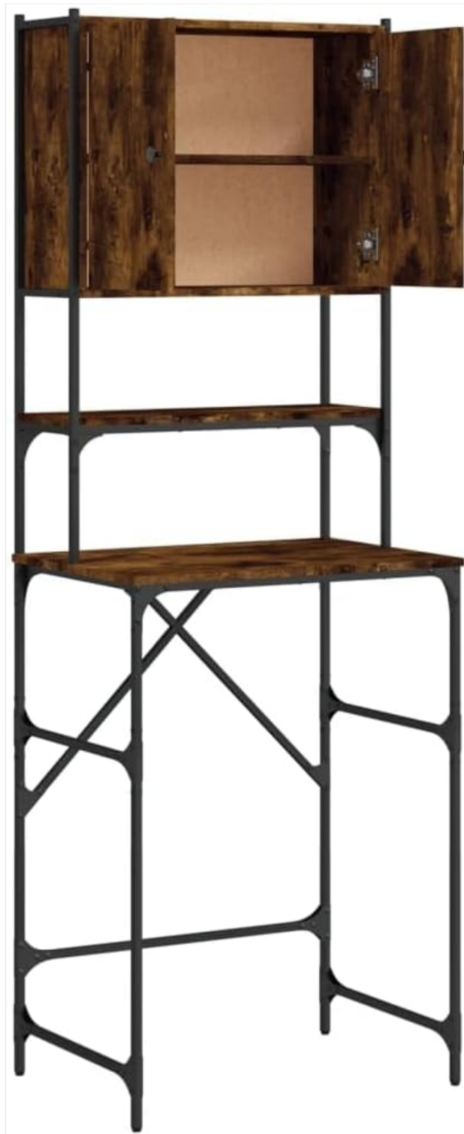
Image 3.3: The top cabinet unit with doors open, showing internal shelving.