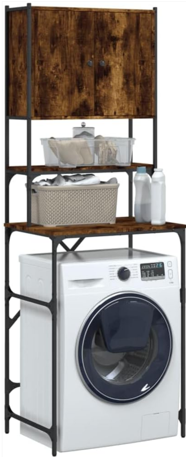
Image 5.2: The cabinet in use above a washing machine, providing accessible storage.