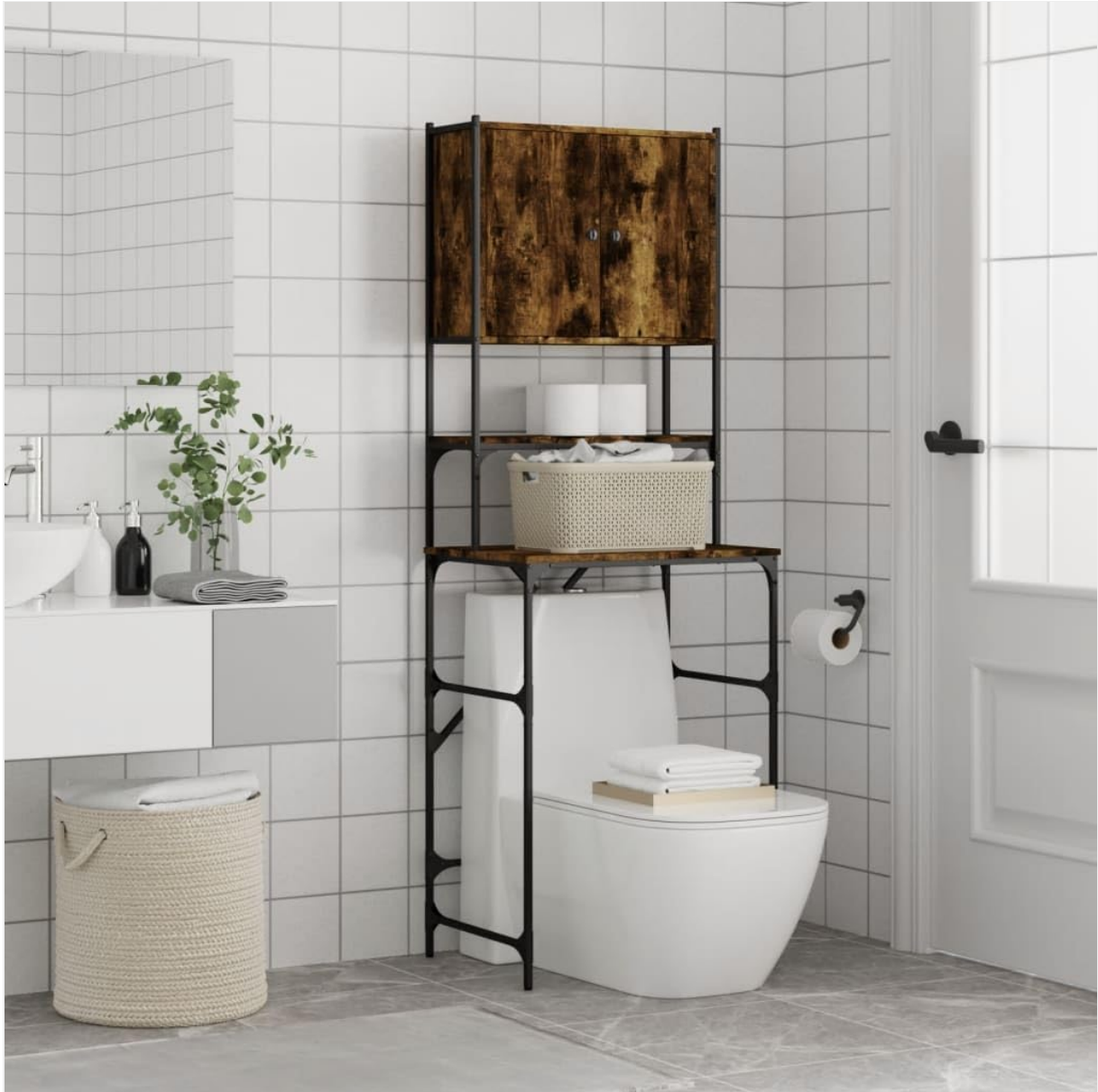
Image 5.1: The cabinet positioned over a toilet, demonstrating its versatility in a bathroom setting.