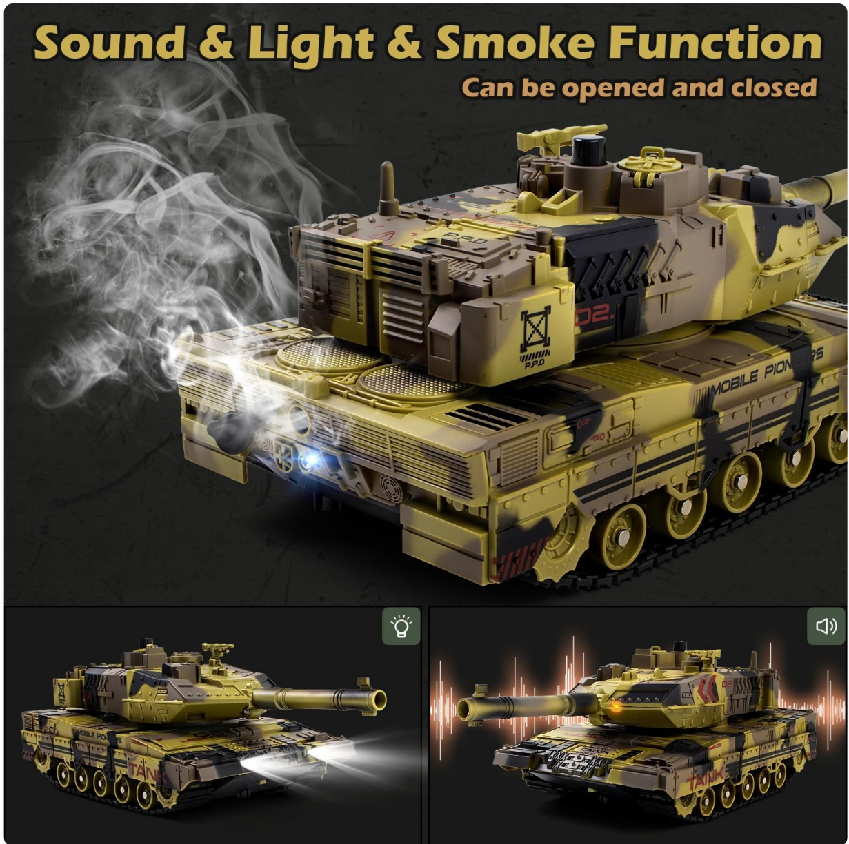
Image 2: The tank showcasing its realistic sound, light, and smoke functions. Smoke is visible from the rear, and the headlights are illuminated, enhancing the play experience.