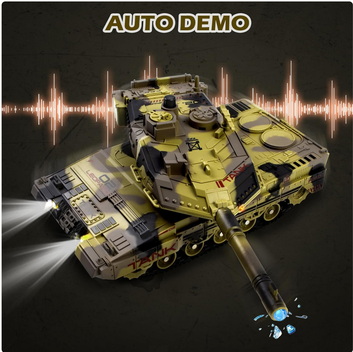
Image 4: The tank operating in auto demo mode, demonstrating its various functions automatically, accompanied by visual cues for sound effects.