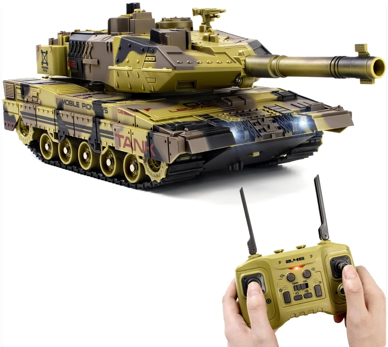
Image 1: The Supdex 1/24 RC Tank and its accompanying remote control. The tank features a detailed camouflage pattern, while the remote has dual joysticks for precise control.