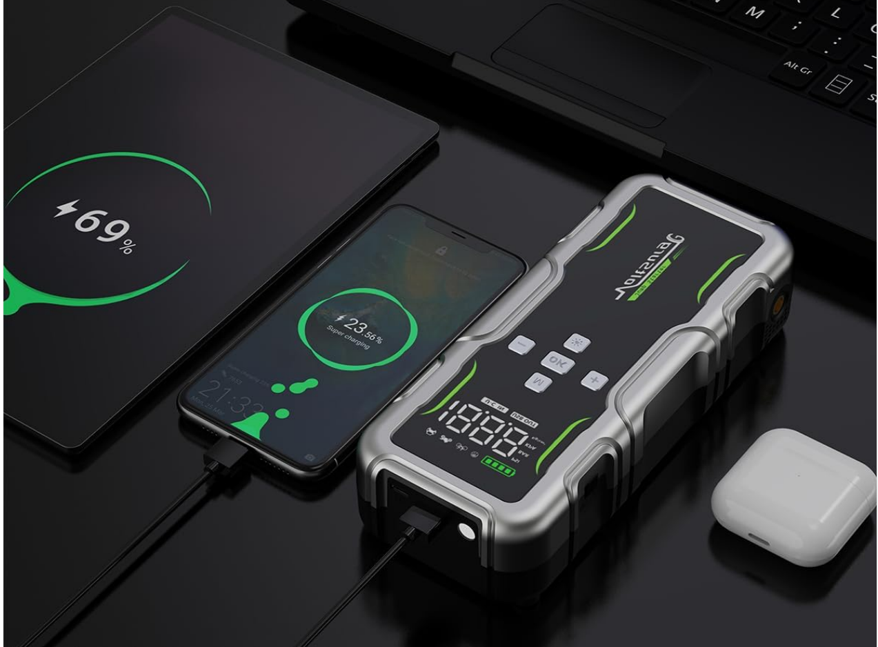
Image: The VoltSurge D08 charging various digital devices, demonstrating its portable power bank capability.