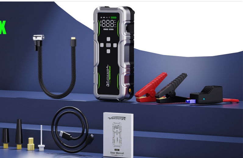
Image: A visual representation of all components included in the VoltSurge D08 product package.