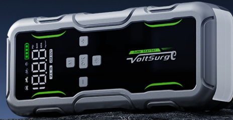
Image: The VoltSurge D08 unit highlighting its 7000A jump start capability for various engine types and 160PSI air inflation.