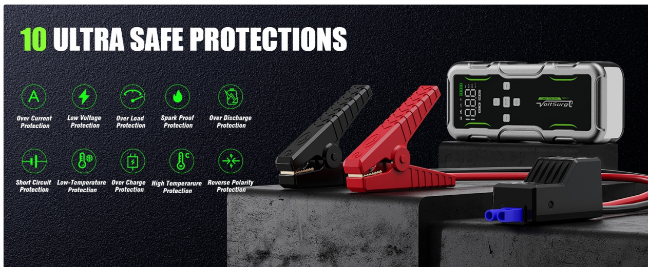
Image: An overview of the ten safety features integrated into the VoltSurge D08 for user protection.