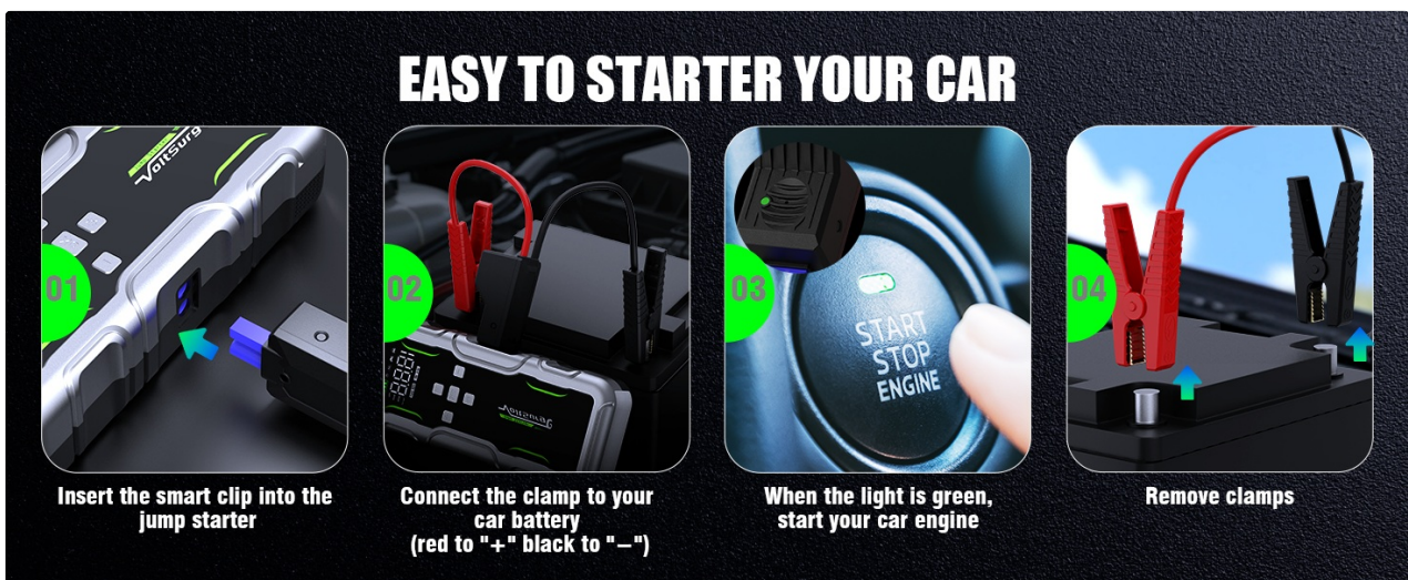
Image: Visual steps for connecting the smart clamps to the jump starter and car battery, then starting the engine.