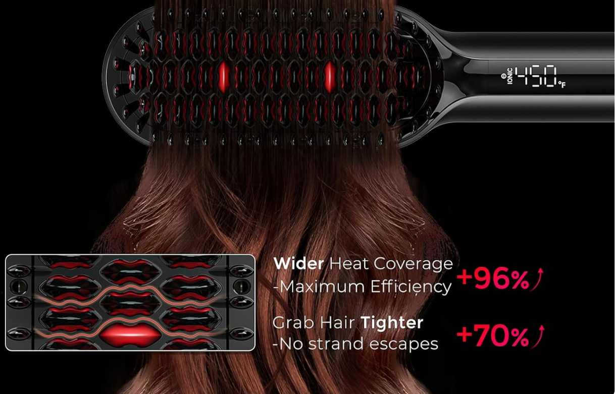
Figure 3: Close-up view of the patented Wave-Design Teeth, illustrating how they provide wider heat coverage and a tighter grip for efficient straightening.

Wave-Design Teeth for one-pass straightening