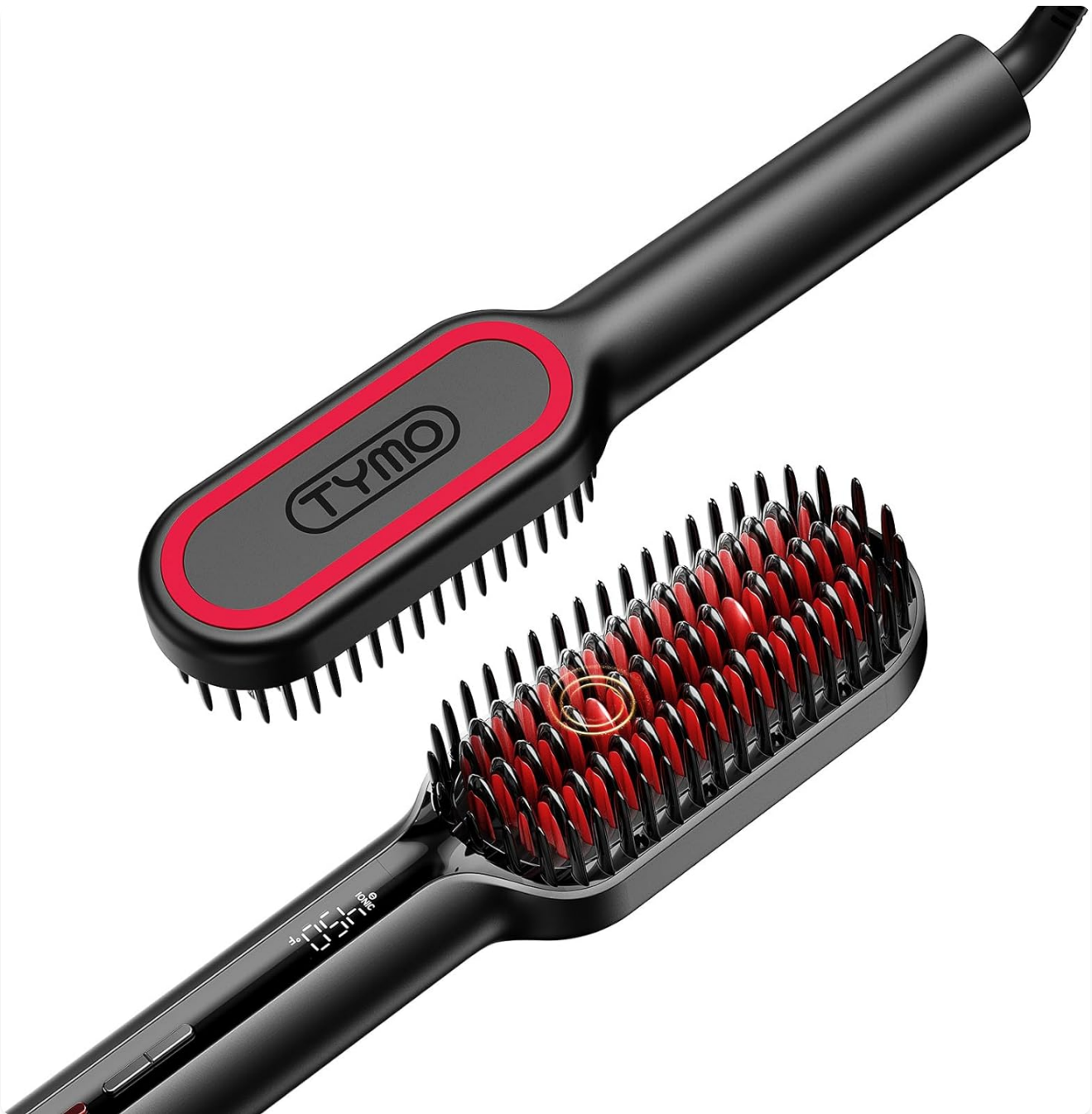
Figure 1: The TYMO Ionic Mini Hair Straightener Brush, showcasing its sleek black design with red accents on the bristles and a digital temperature display on the handle.

The TYMO Ionic Mini Hair Straightener Brush is a compact and powerful styling tool designed for efficient hair straightening. It features advanced ionic technology and wave-design bristles for smooth, frizz-free results.