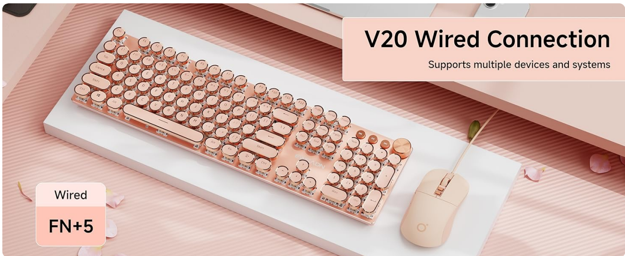
Image: The keyboard highlighting its N-key rollover capability, allowing multiple simultaneous key inputs without errors.