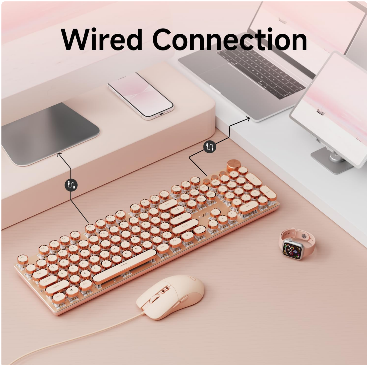
Image: Wired connection setup for the keyboard and mouse to a computer.