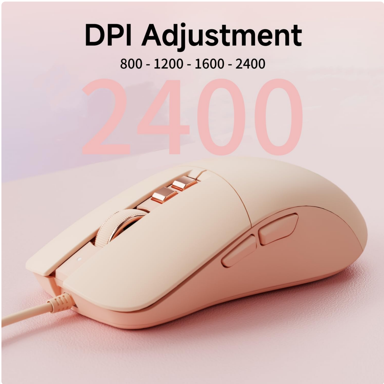
Image: The wired mouse displaying its DPI adjustment settings (800-1200-1600-2400).