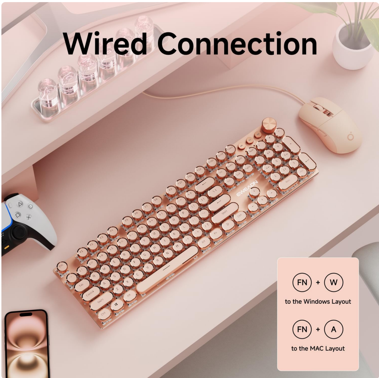
Image: Wired connection illustrating how to switch between Windows (Fn + W) and Mac (Fn + A) layouts.