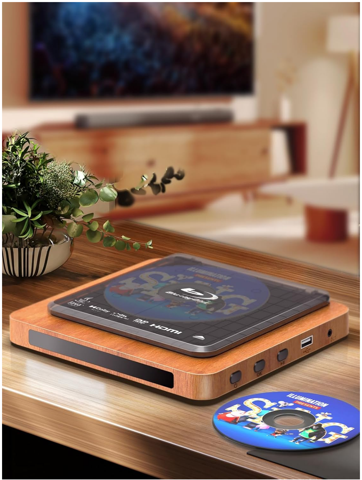
Figure 2: The Blu-ray player showcasing its top-loading disc mechanism and retro design on a wooden surface.