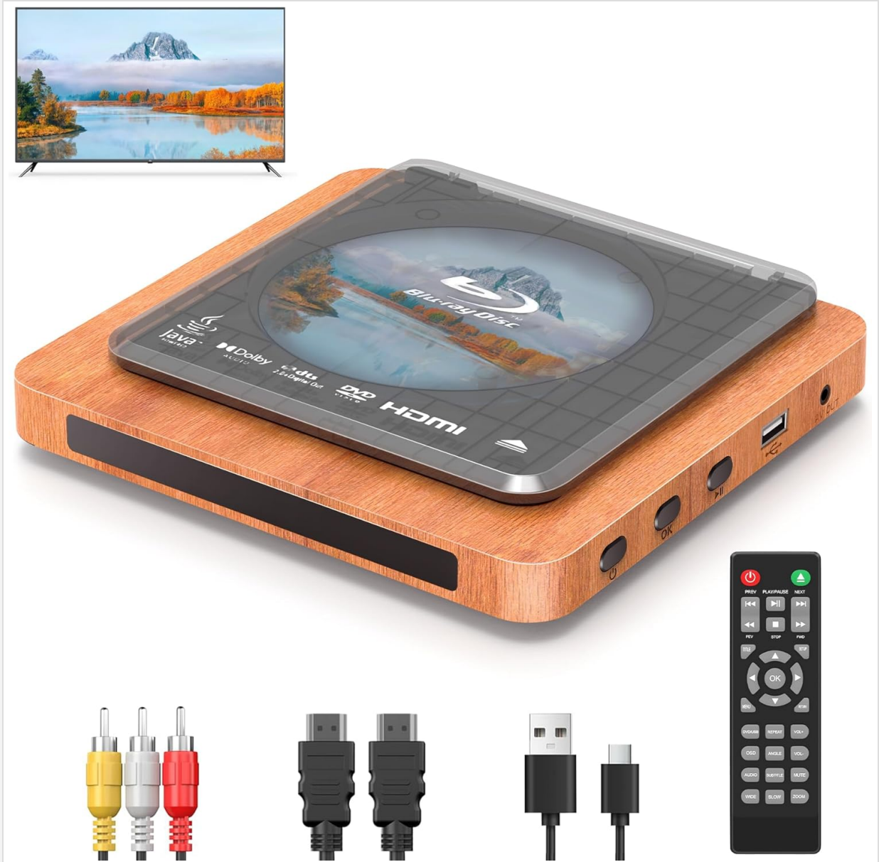
Figure 1: Contents of the DID A R 2025 Blu-ray Player package. The image displays the player unit, remote control, HDMI cable, and AV cable.