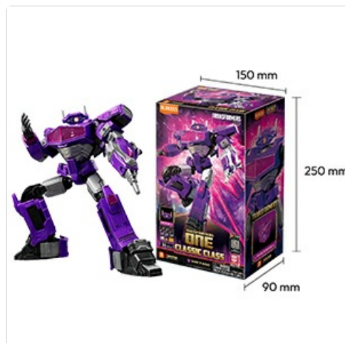
Image: A close-up of the Shockwave figure, showcasing its illuminated eye and chest, which glow with a menacing purple light.

The Shockwave figure features light-up eyes and chest. A built-in light module powers this luminescent design. To activate the light-up feature, gently shake the figure. The light module contains one nonstandard battery, which is included and pre-installed.