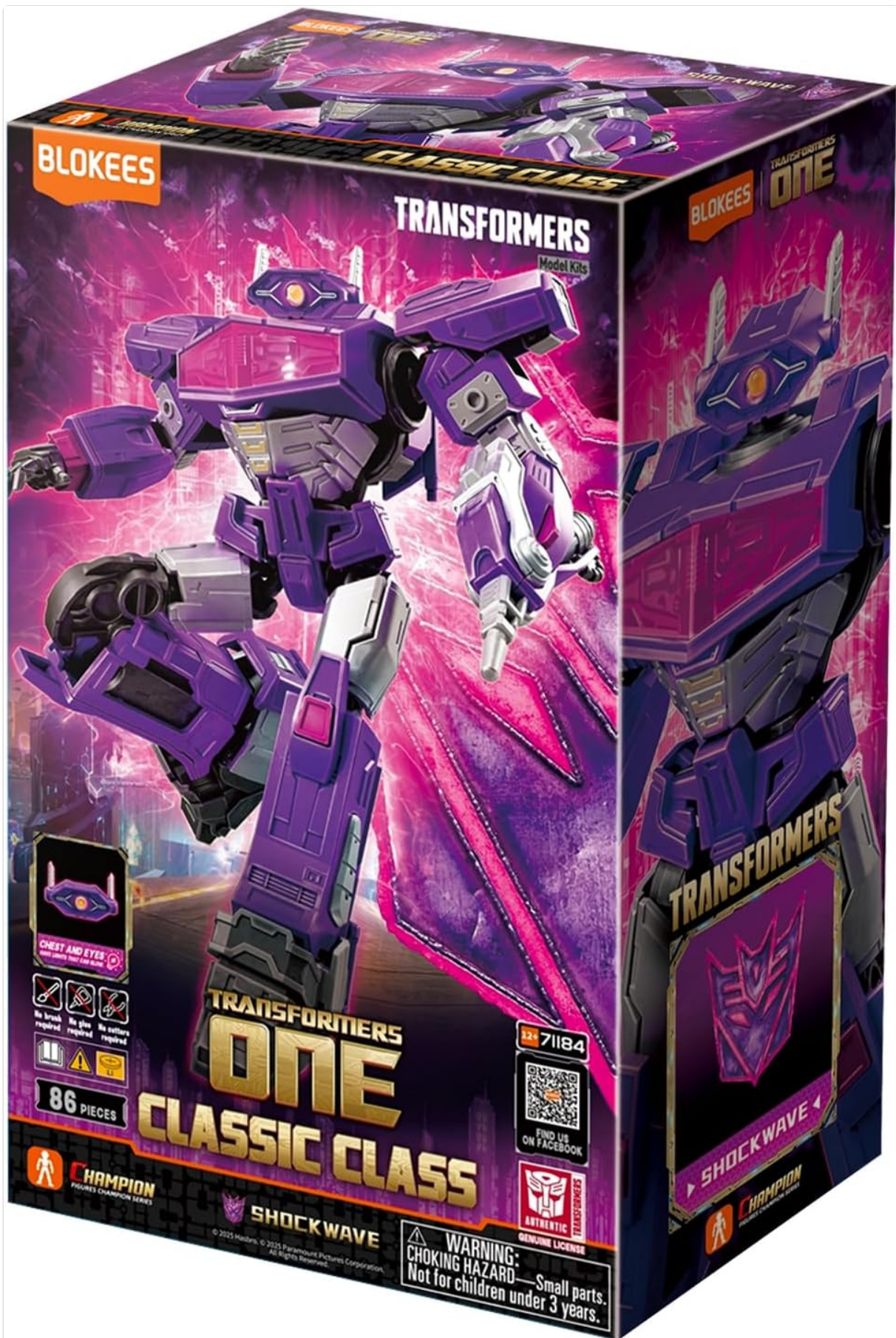
Image: The product packaging for the BLOKEES Transformers Classic Class Shockwave model kit, showing the assembled figure and key features.