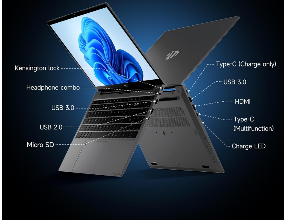
Image: An exploded view of the NIMO laptop, highlighting the location and type of its multiple ports, including USB, HDMI, Type-C, Micro SD, headphone combo, and Kensington lock.