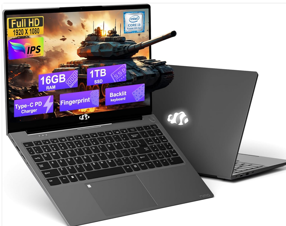
Image: The NIMO 15.6 FHD-Laptop, showcasing its sleek design and key features like Full HD display, 16GB RAM, 1TB SSD, Type-C PD Charger, Fingerprint reader, and Backlit keyboard.

Thank you for choosing the NIMO 15.6 FHD-Laptop. This powerful and versatile laptop is designed to enhance your productivity and entertainment experience. Featuring an Intel Core i3-1215U processor, 16GB RAM, and a 1TB SSD, it delivers fast and efficient performance for all your tasks. This manual provides essential information on setting up, operating, maintaining, and troubleshooting your new laptop.