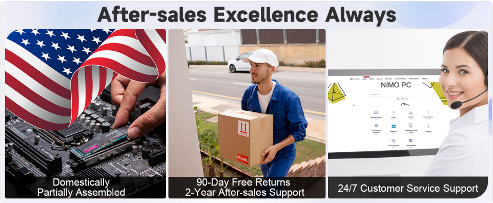
Image: An illustration of NIMO's after-sales excellence, showing domestically partial assembly, 90-day free returns, 2-year after-sales support, and 24/7 customer service support.

For support, please refer to the contact information provided on the NIMO official website or the packaging. Please have your model number (NIMO N154G) and purchase details ready when contacting support.