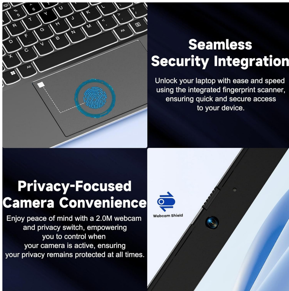
Image: Close-up views of the laptop's fingerprint sensor for seamless security integration and the webcam with its privacy shield for enhanced privacy.