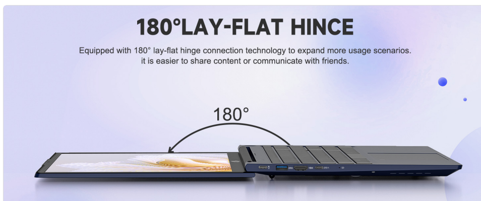
Image: The NIMO laptop demonstrating its 180° lay-flat hinge, showing the screen fully opened and flat, ideal for sharing content.

The laptop is equipped with a 180° lay-flat hinge, allowing the screen to lie completely flat. This feature expands usage scenarios, making it easier to share content or collaborate with others.