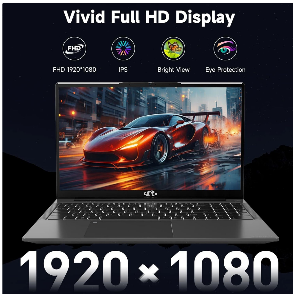
Image: The NIMO laptop screen displaying a vibrant image, highlighting its Full HD (1920x1080) resolution, IPS technology, bright view,

The NIMO laptop features a stunning 15.6-inch Full HD (1920x1080) display with an 85% screen-to-body ratio and razor-thin bezels, providing vibrant colors and sharp details for an immersive viewing experience.