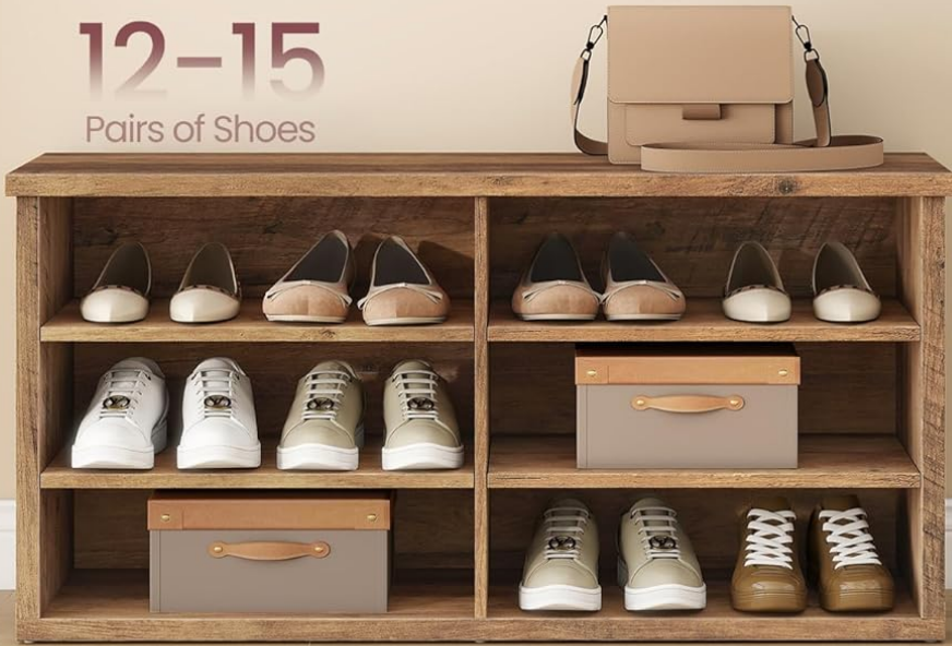
Figure 2.1: The VASAGLE Shoe Bench providing organized storage for 12-15 pairs of shoes in an entryway setting.