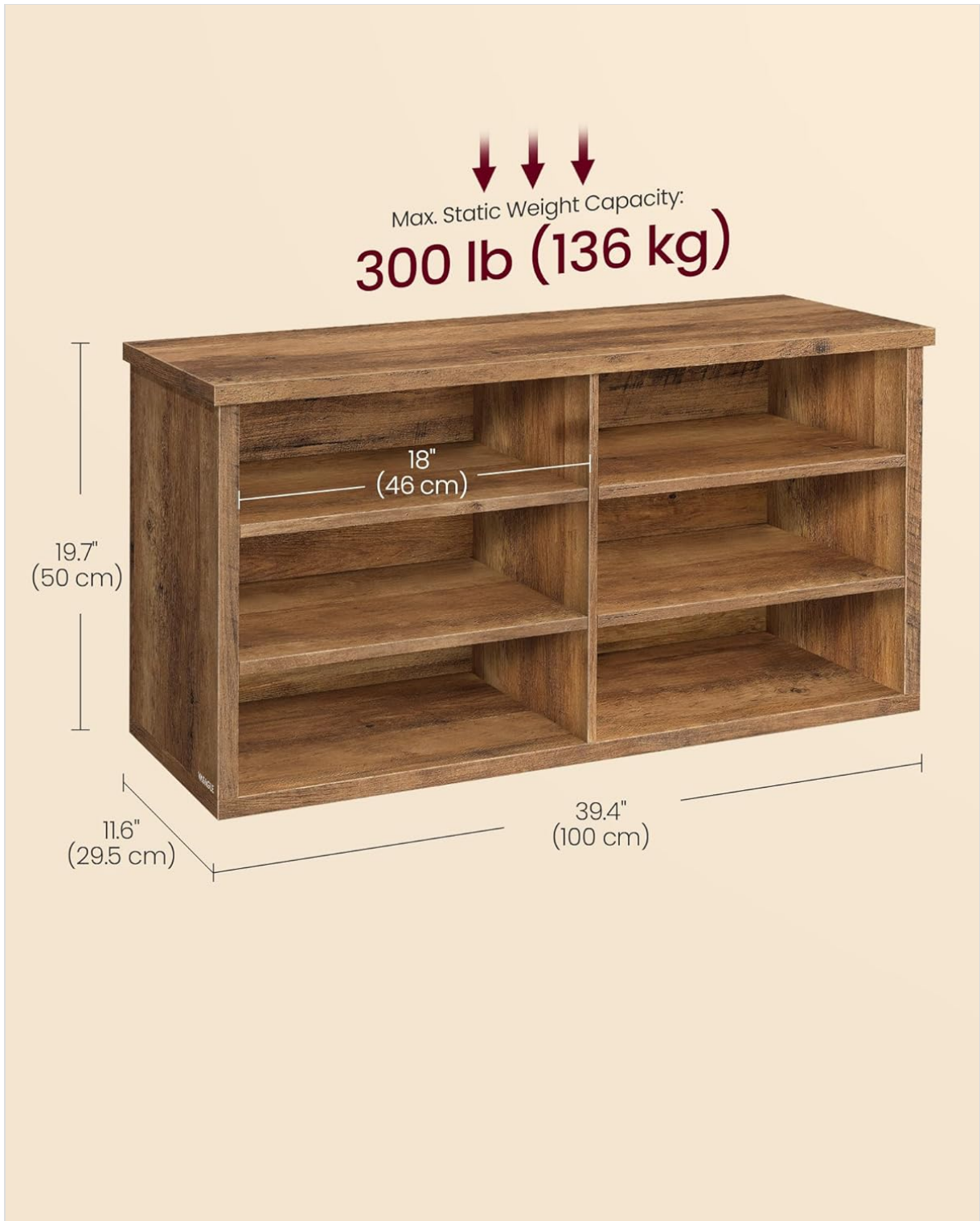
Figure 2.2: Detailed dimensions of the shoe bench: 11.6"D x 39.4"W x 19.7"H, with a maximum static weight capacity of 300 lb (136 kg).