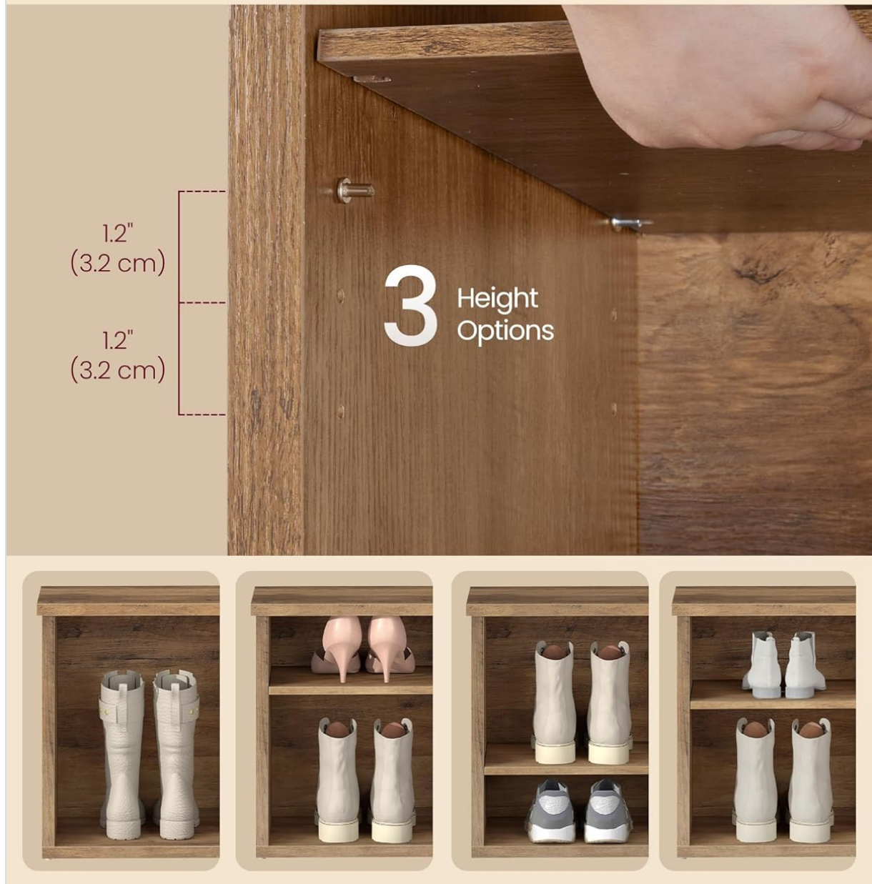
Figure 2.3: Illustration of the adjustable shelves, offering three height options to accommodate different item sizes.