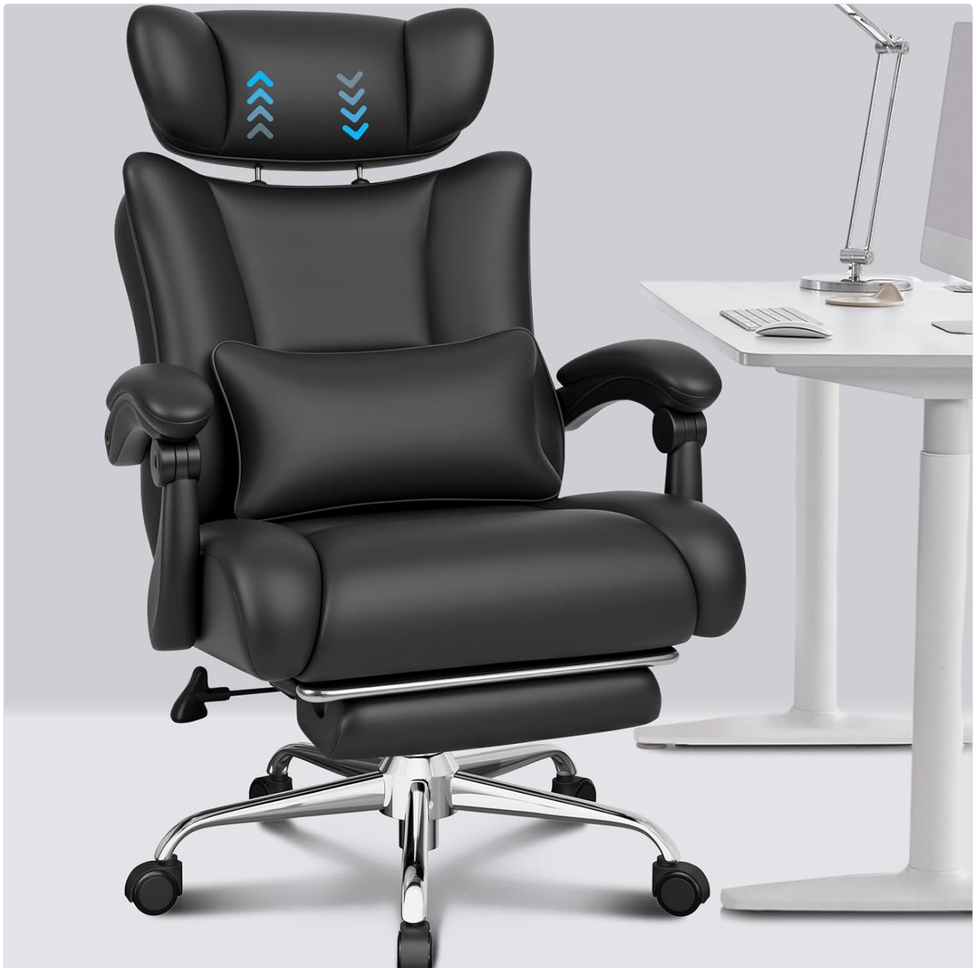
Figure 1: BASETBL Heavy-Duty Office Chair - Front View

This image shows the complete BASETBL Heavy-Duty Office Chair in black, featuring its ergonomic design, plush cushioning, and sturdy base. The adjustable headrest and lumbar pillow are visible, along with the integrated footrest tucked underneath the seat.