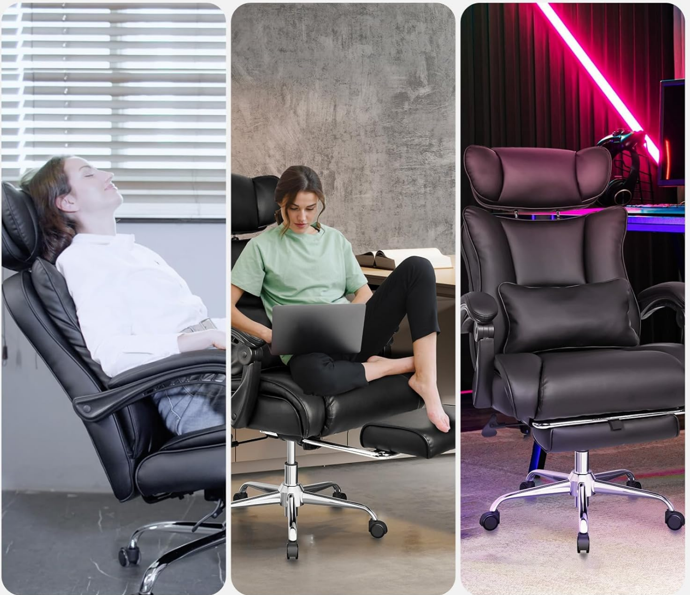
Figure 3: Chair Suitability for Different User Groups

This image visually confirms the chair's robust design, indicating its suitability for various body types and its impressive 440 lbs (200 kg) weight capacity, ensuring stability and comfort for a wide range of users.