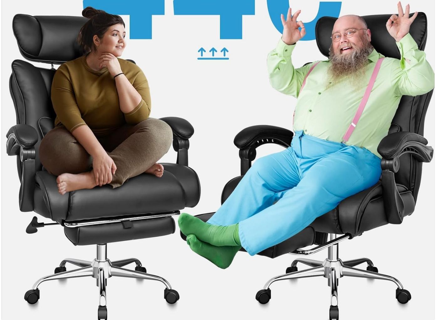
Figure 7: Overview of Chair Adjustments and Components

This image provides a comprehensive view of the chair's adjustable features, including the recline mechanism (90°-120°), tilt function adjustment, tension adjustment, 10cm height adjustment, quiet PU wheels, stable metal chair legs, reinforced frame, soft armrests, and the retractable footrest.