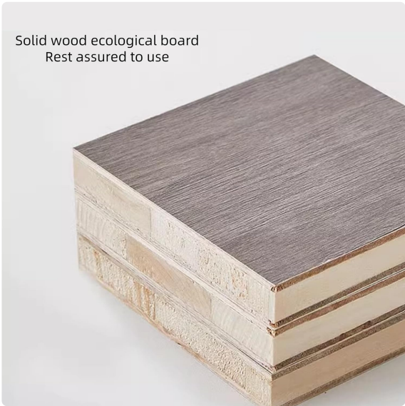
Image 6: A close-up of the solid wood ecological board, emphasizing its quality and suitability for use.

Solid wood ecological board Rest assured to use