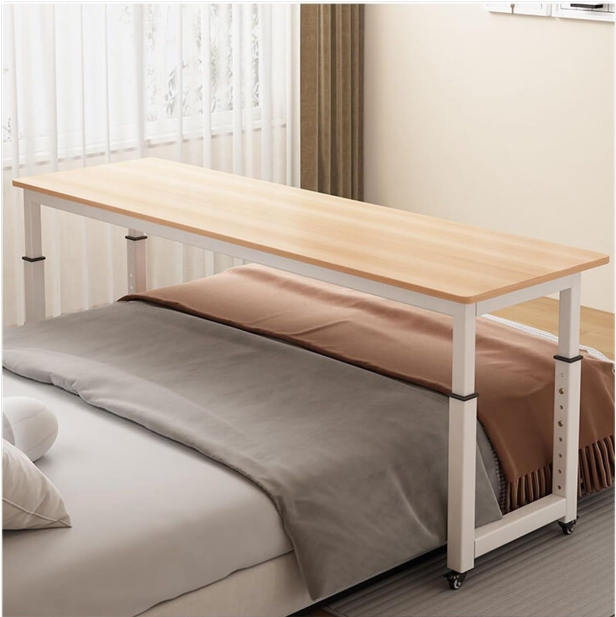
Image 1: The Over The Bed and Recliner Table positioned over a bed, showcasing its natural wood top and white frame.