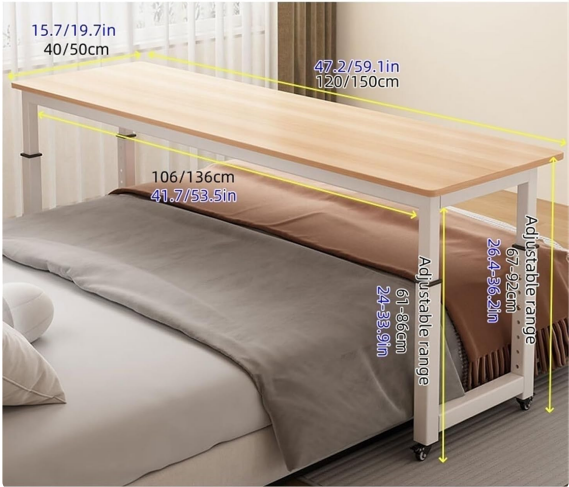
Image 2: Detailed product dimensions, showing adjustable height ranges and table top sizes (150x40 CM, 150x50 CM, 120x40 CM, 120x50 CM).

Note: Due to manual measurement, there may be errors. Please understand