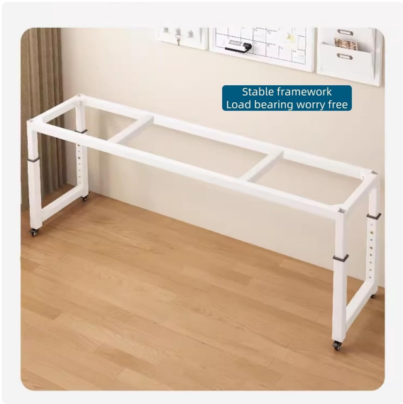
Image 7: The stable framework of the table, demonstrating its load-bearing capability and robust construction.