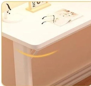
Image 4: Illustrates the stable triangle design for enhanced pressure resistance and the multiple adjustable levels for customizable height.

Safe rounded corner design Carefully polished edges and corners Reduce collisions