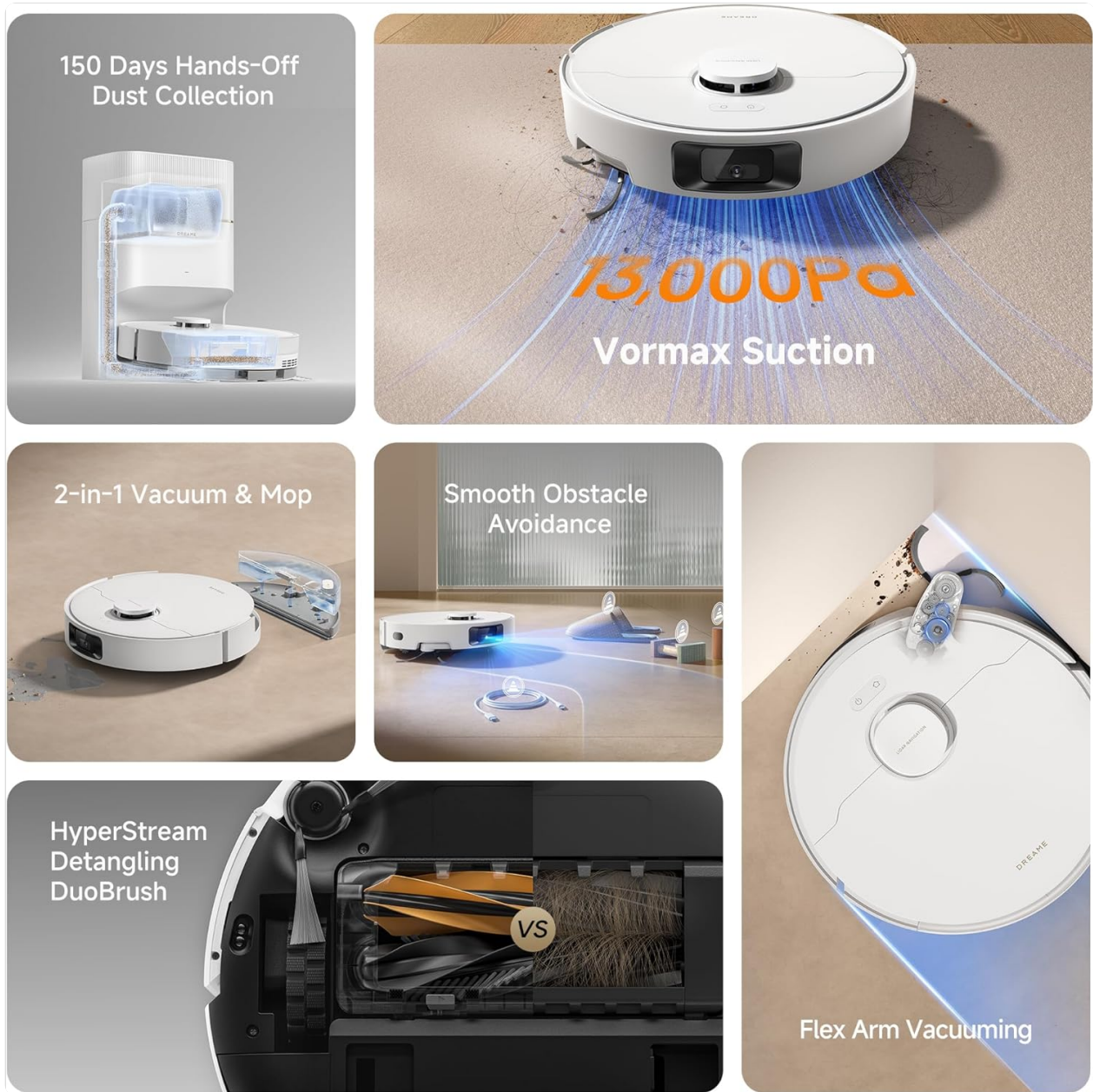
Figure 1: Key features of the DREAME D20 Pro Plus Robot Vacuum and Mop.