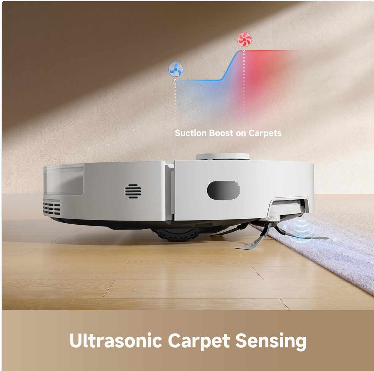
Figure 5: The robot's ultrasonic carpet sensing feature, which automatically boosts suction on carpets.