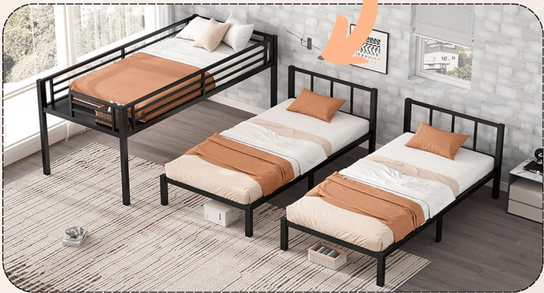
Image 2.2: Illustration of the bunk bed's detachable feature, converting into three separate twin beds.