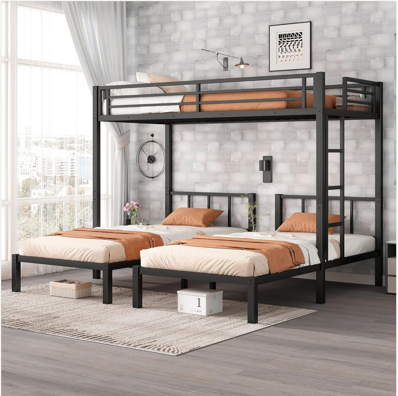
Image 2.1: Fully assembled Bellemave Triple Bunk Bed in a bedroom setting.