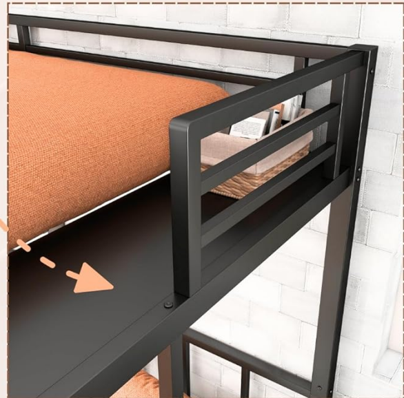
Image 2.3: Detailed view of the integrated shelf on the upper bunk and the small desk between the lower beds.