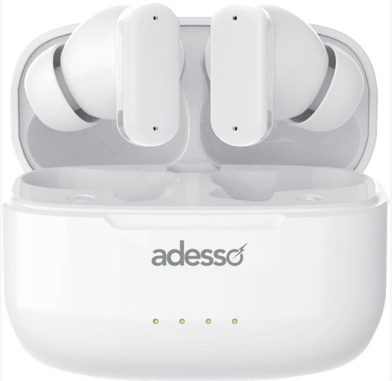
Image: The ADESSO Xstream T2 wireless earbuds are shown resting inside their open white charging case. The case has the 'adesso' logo on the front and four small LED indicator lights below it. The earbuds are white with a sleek, minimalist design.