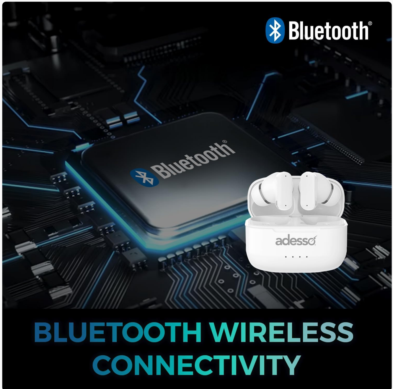
Image: A stylized image depicting a Bluetooth chip on a circuit board, with the ADESSO Xstream T2 earbuds in their charging case in the foreground. This visually represents the Bluetooth wireless connectivity feature.

The earbuds will automatically reconnect to the last paired device when taken out of the case, if Bluetooth is enabled on the device.