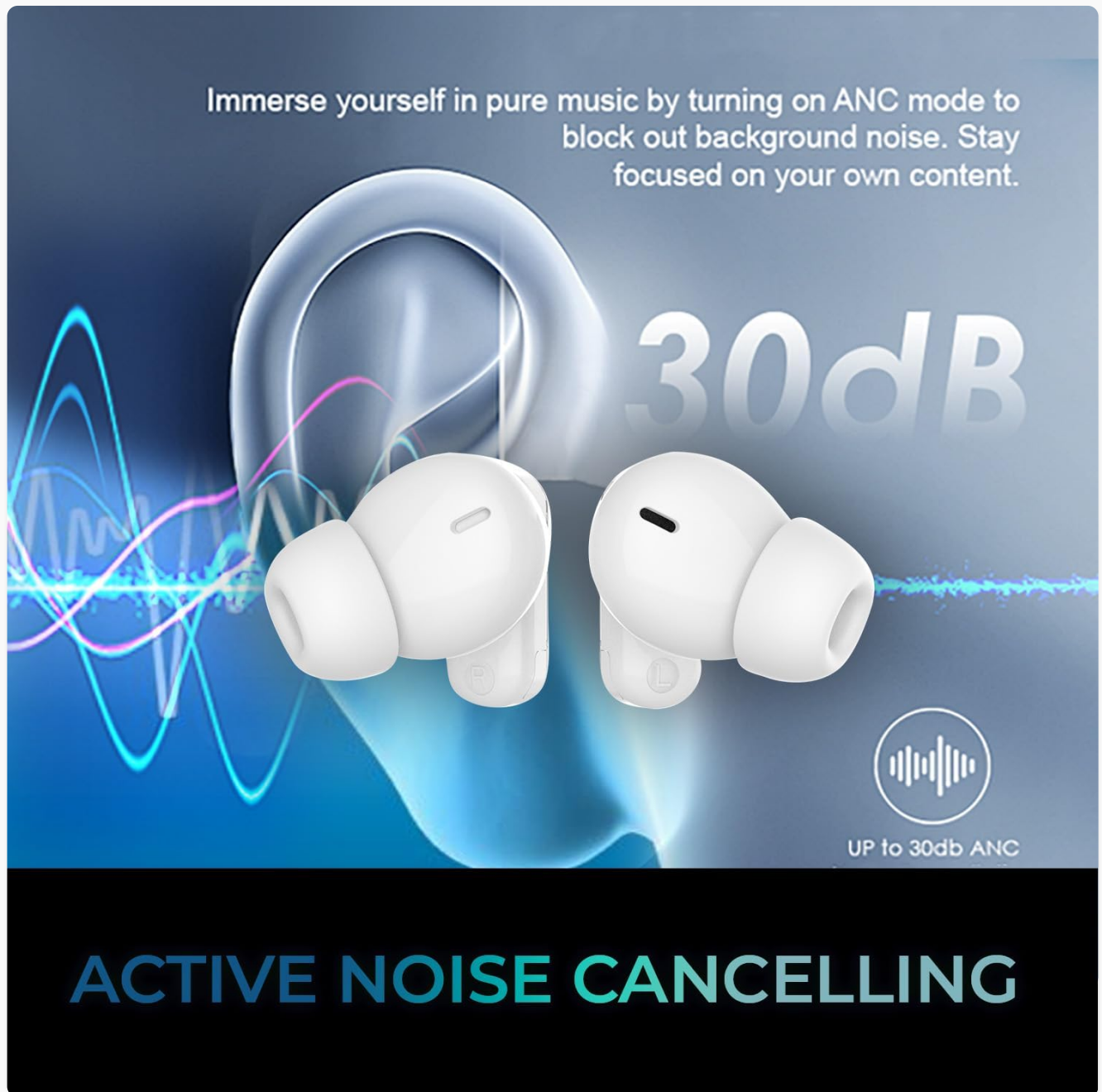
Image: A graphic illustrating sound waves being blocked around the ADESSO Xstream T2 earbuds, with text indicating "30dB" and "Active Noise Cancelling." This highlights the noise reduction capability.

The Xstream T2 earbuds feature Active Noise Cancelling technology to reduce ambient noise, allowing for a more immersive listening experience. To activate or deactivate ANC, long-press the touch sensor on either earbud for approximately 3 seconds until you hear an audible prompt.