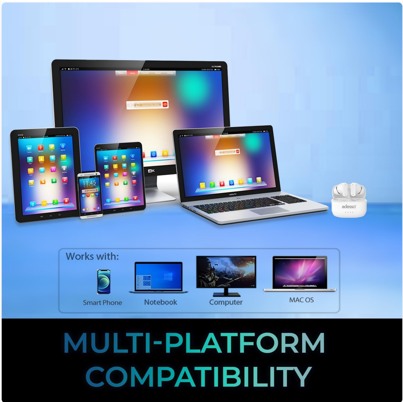
Image: The ADESSO Xstream T2 earbuds and charging case are shown in front of various electronic devices including a smartphone, tablet, laptop, and desktop computer, illustrating their multi-platform compatibility.