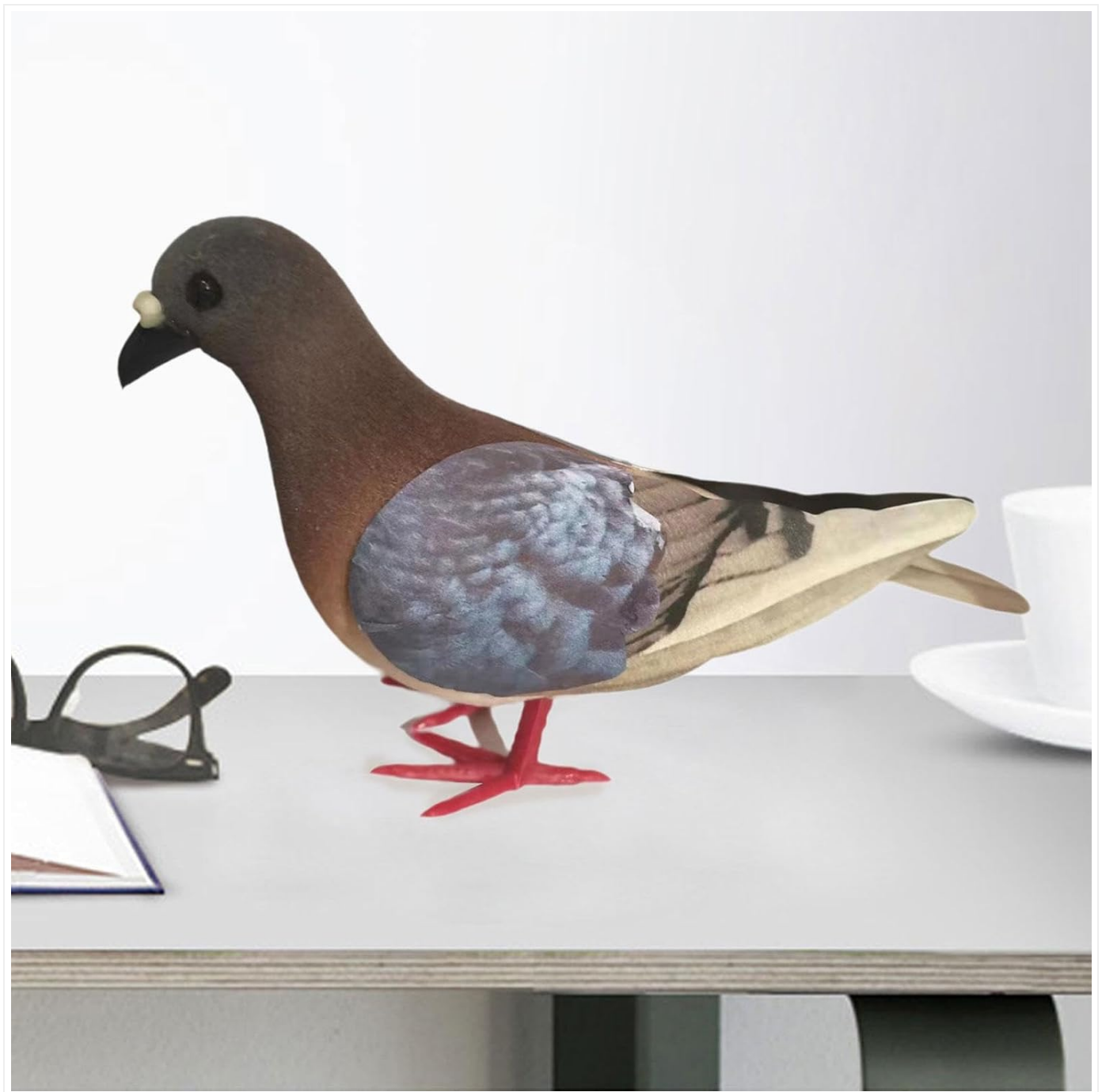
Image: The pigeon model positioned on a desk next to a pair of glasses and a cup, illustrating its use in an office or study setting.