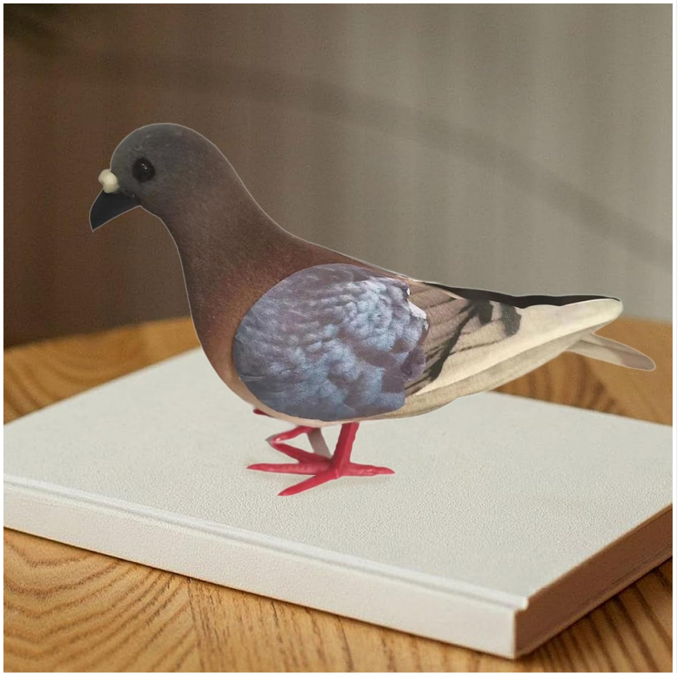
Image: The pigeon model resting on a white book, demonstrating its suitability for desk or shelf display.