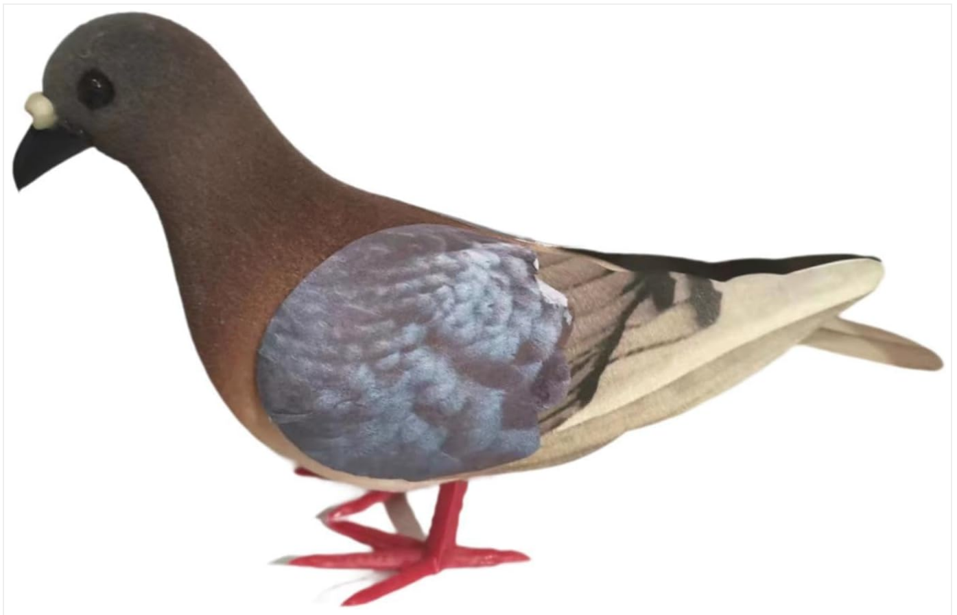
Image: Side view of the Gralara Simulation Foam Pigeon Model, showcasing its realistic design and earthy red coloring.