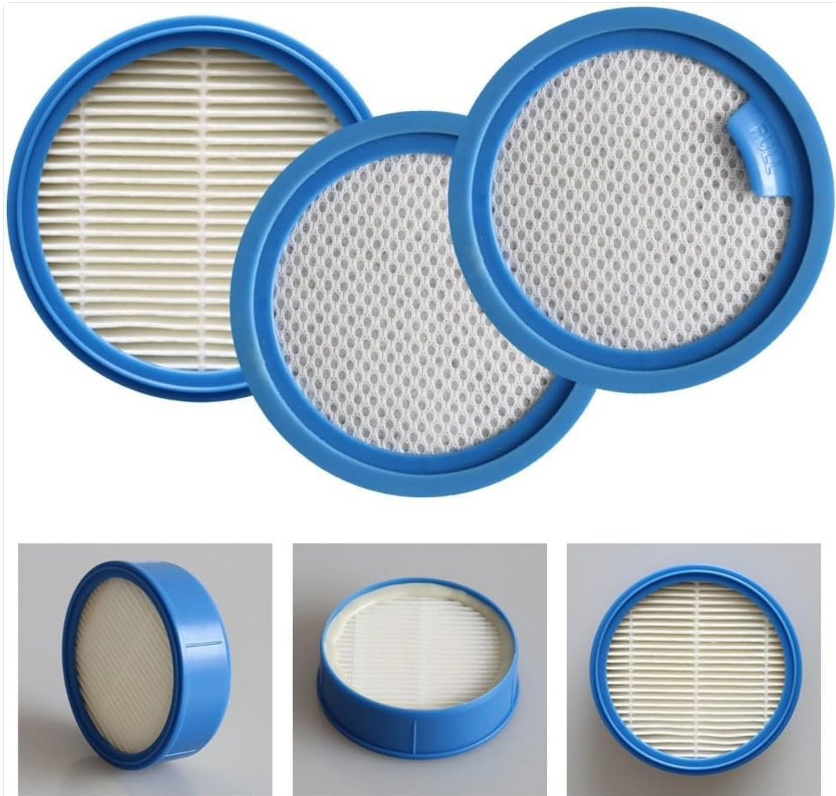
Figure 3: Filters shown from multiple perspectives, illustrating their design for proper fit.