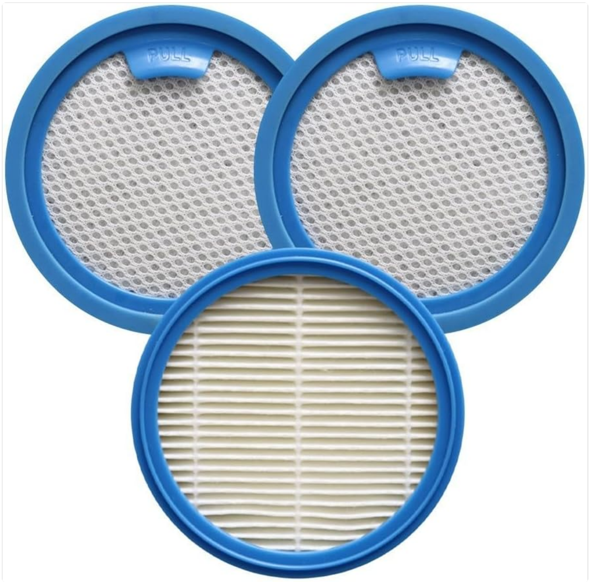
Figure 1: The complete filter kit, including two pre-motor filters (mesh design) and one hygiene filter (pleated design).