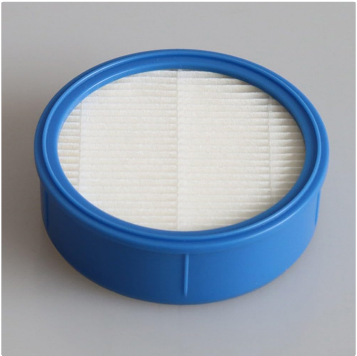
Figure 2: A close-up of a pre-motor filter, featuring its mesh filtration surface.