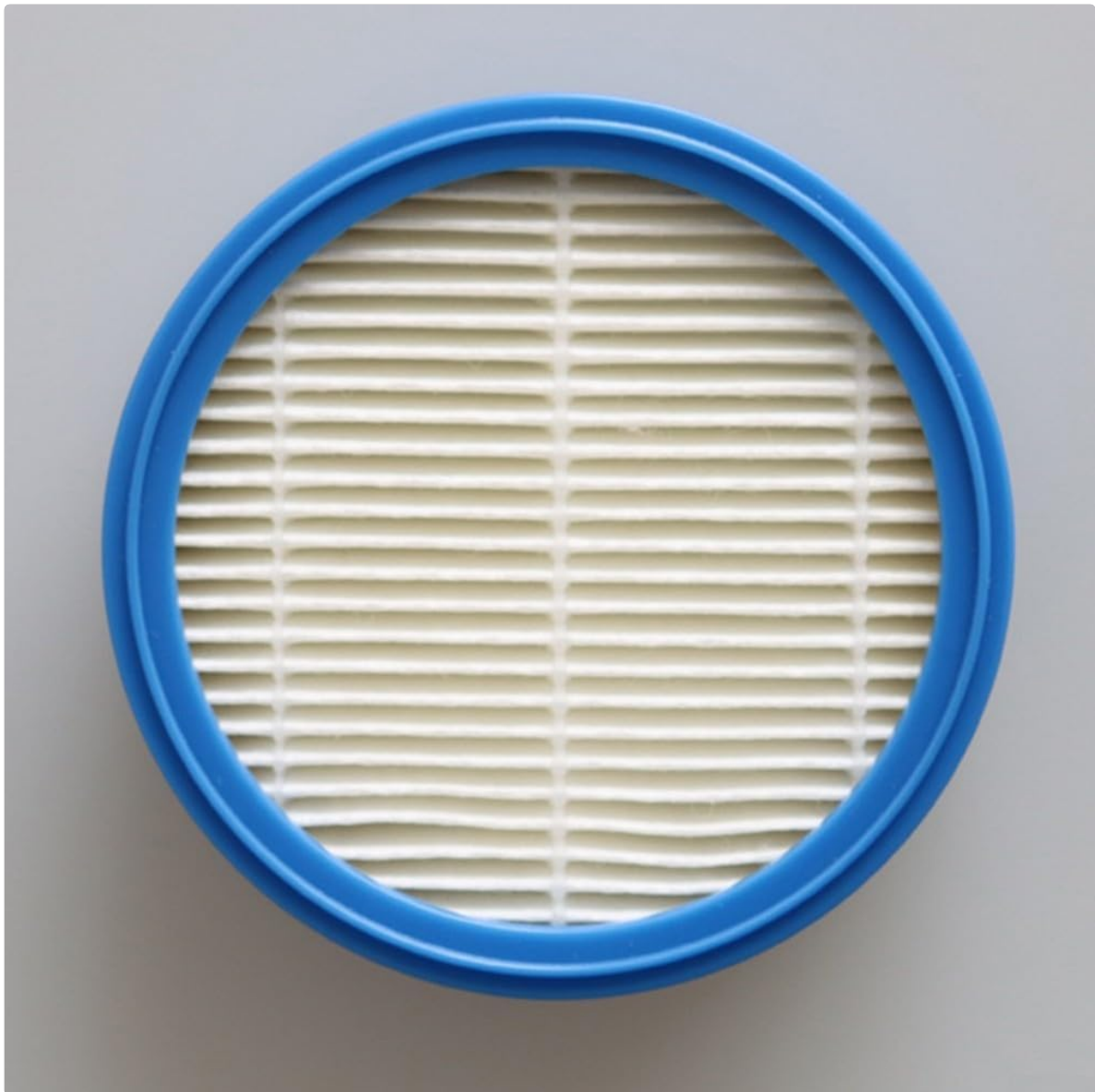
Figure 4: A detailed view of the hygiene filter, showing its pleated structure designed for fine dust capture.

Regular replacement according to this schedule will help maintain the vacuum's suction power and filtration efficiency.