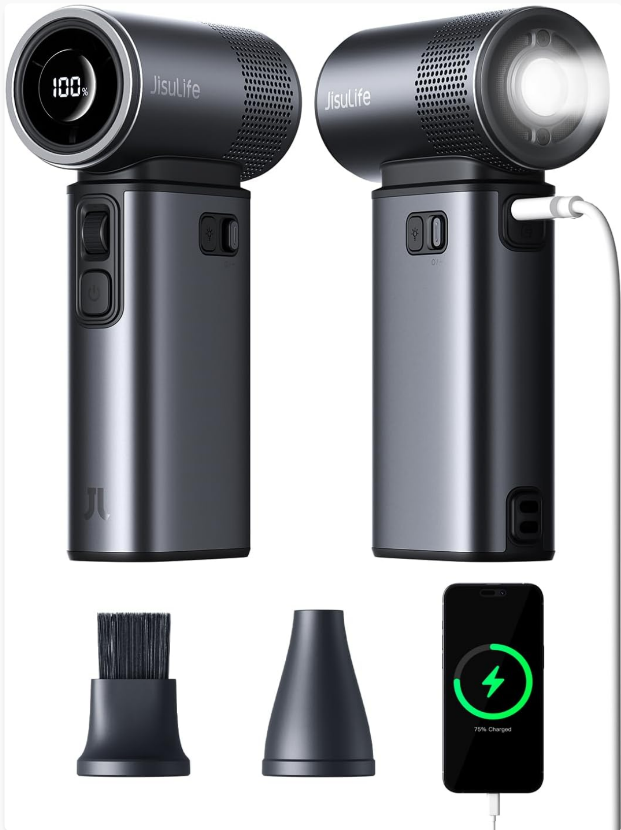
Image: JISULIFE Portable Handheld Fan Ultra2 with included accessories.

Your browser does not support the video tag.