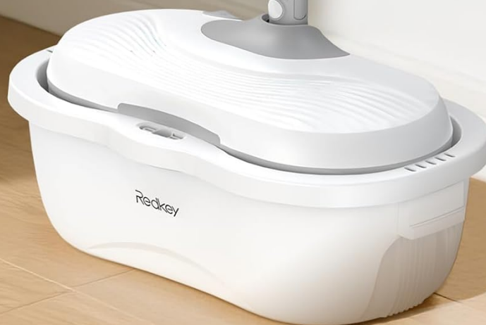
Figure 1.2: Overview of Redkey M1 key features.