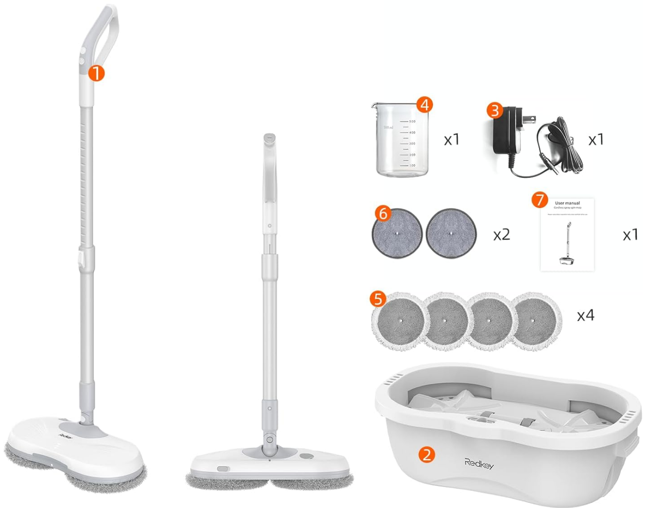
Figure 2.1: Package contents of the Redkey M1 Electric Spin Mop.