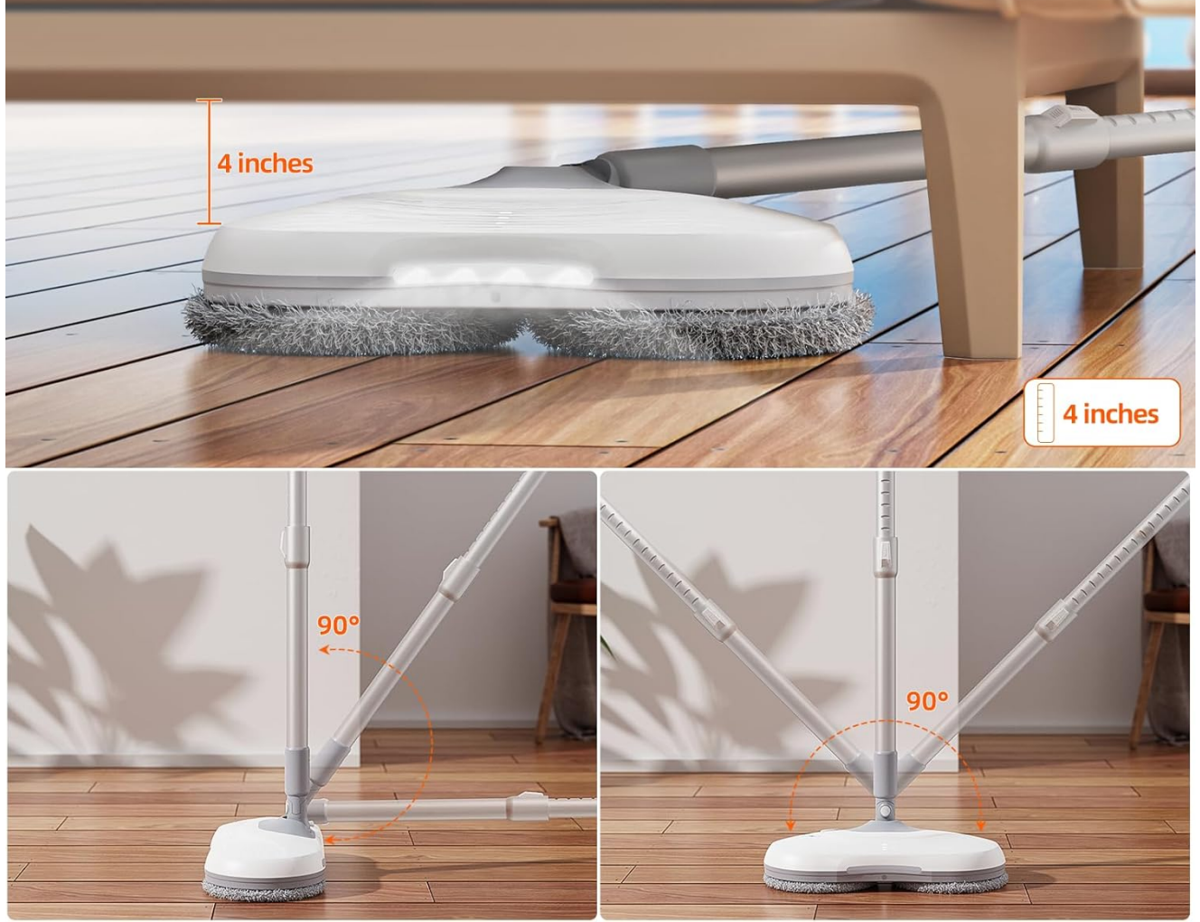
Figure 3.2: Mop head flexibility for reaching difficult areas.