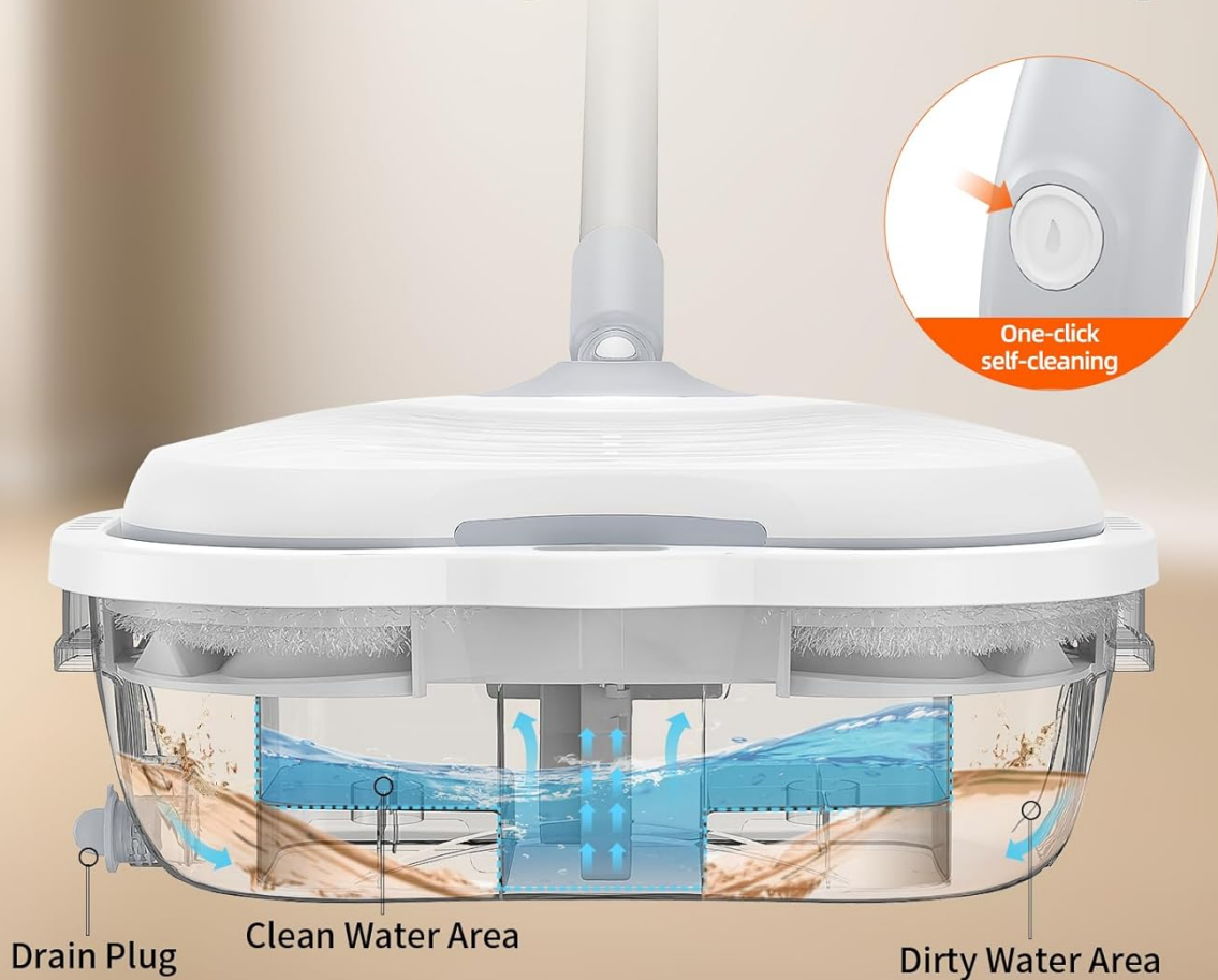
Figure 4.3: Self-cleaning mop bucket mechanism.

Hold the spray button for 2 seconds to start auto-cleaning. Automatically stops after 15 seconds of cleaning + 30 seconds of scrubbing.