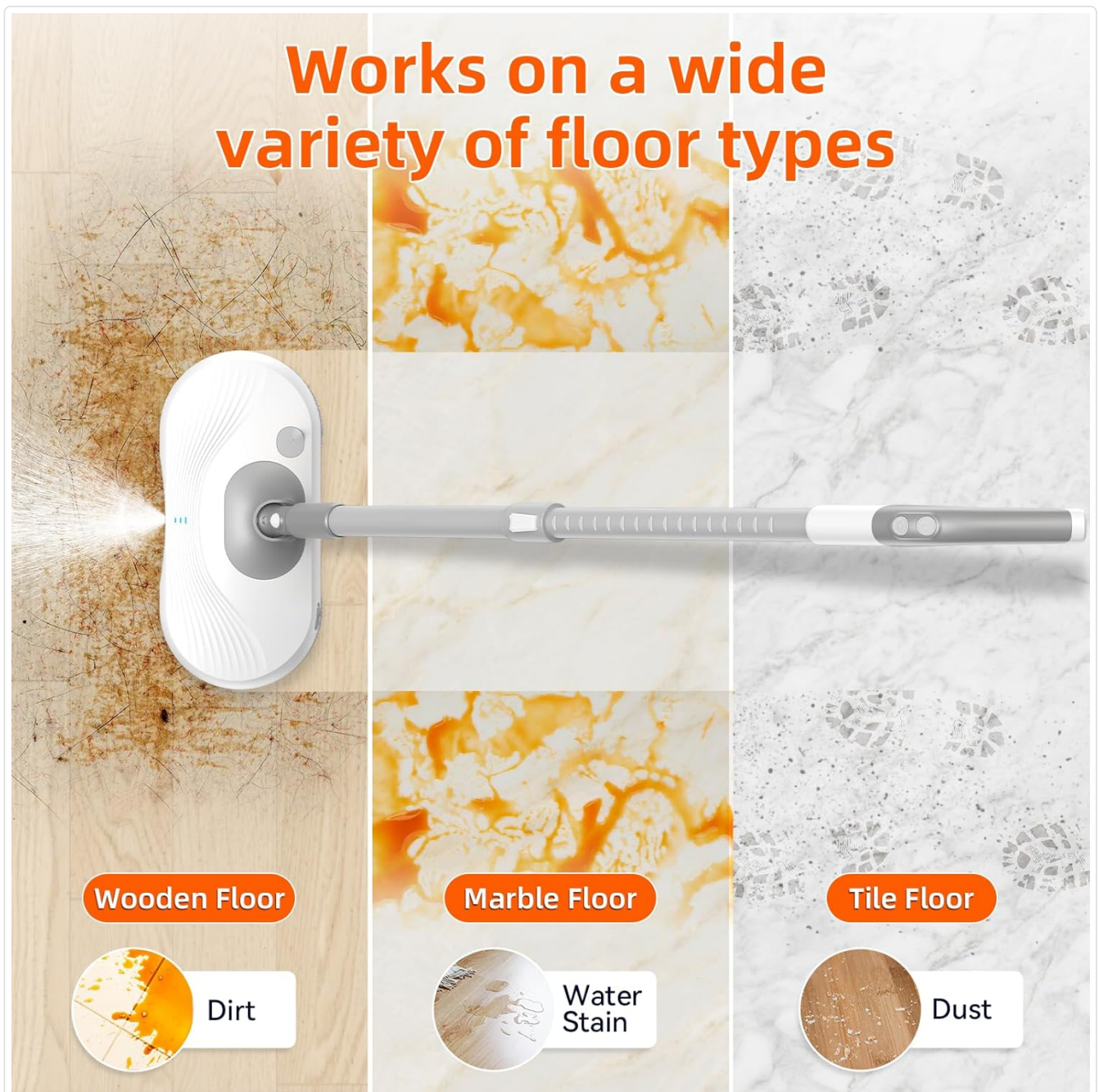
Figure 4.2: Suitable for various floor types including wood, marble, and tile.

Your browser does not support the video tag.