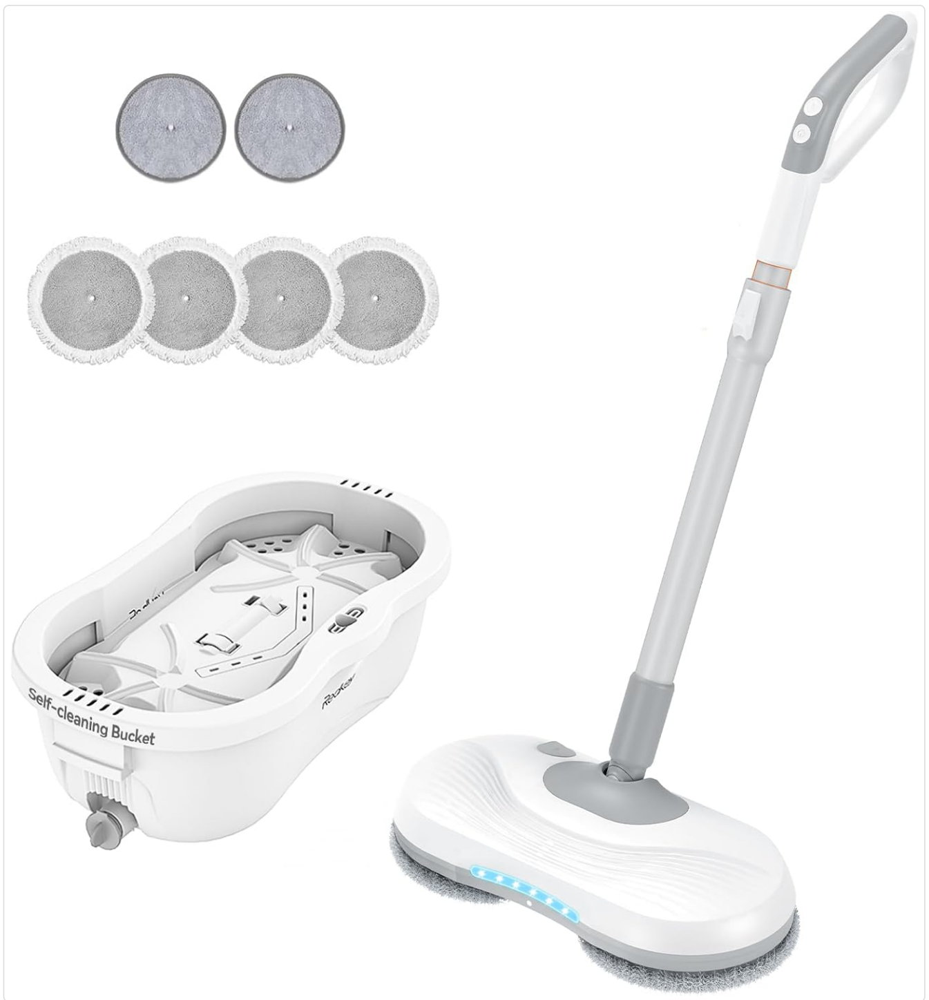
Figure 1.1: Redkey M1 Electric Spin Mop and accessories.