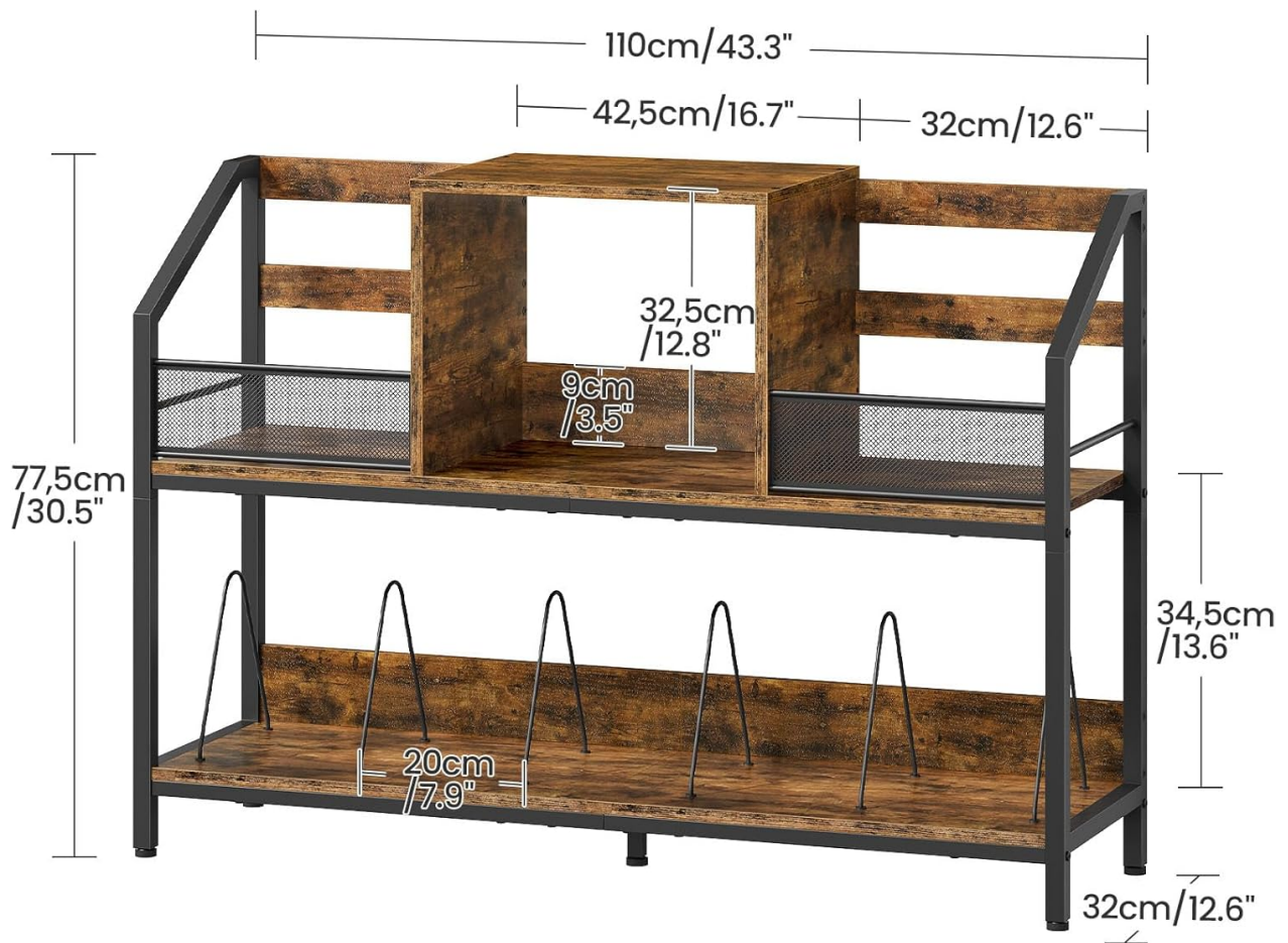
Image: A technical drawing with precise measurements of the storage holder, indicating length, width, and height of various sections.