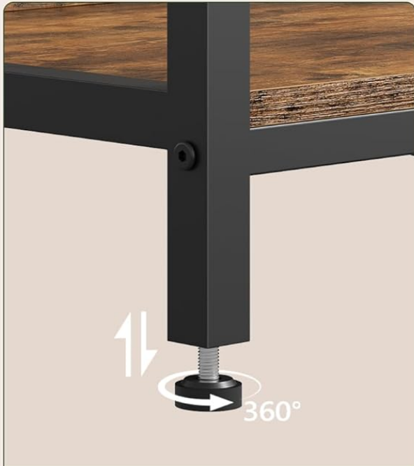
5 Adjustable Feet