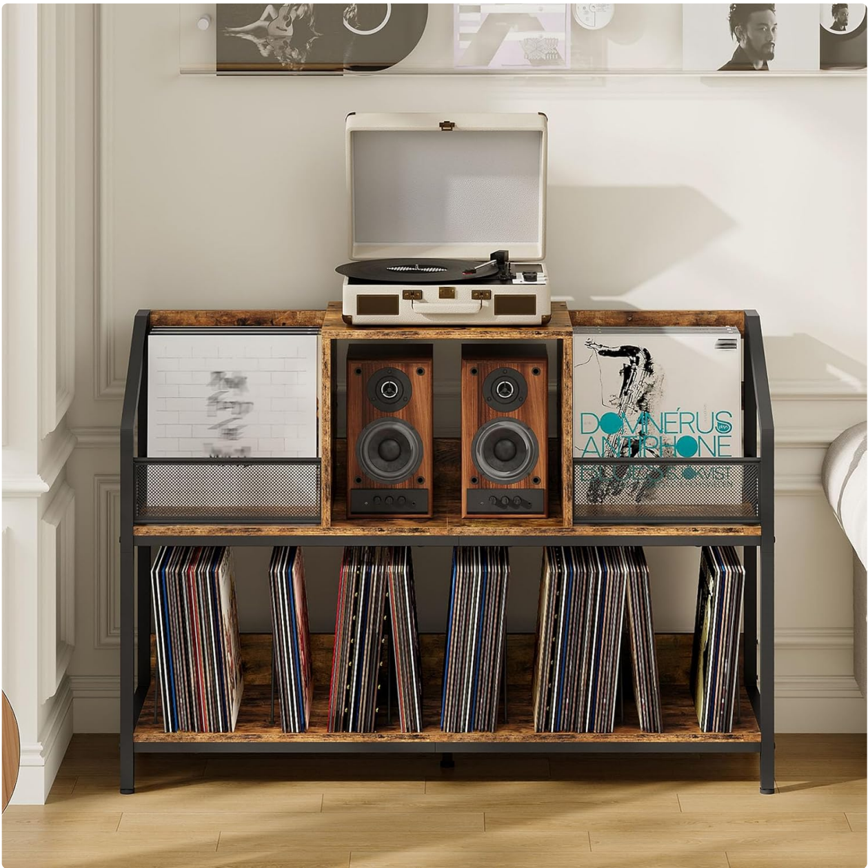
Image: The record player table configured with a record player, speakers, and receiver, demonstrating its use as an audio station.