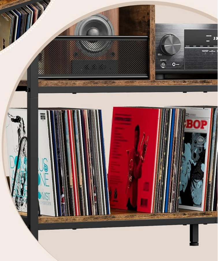
Image: A visual breakdown of the upper display and lower storage areas, highlighting their respective capacities and features.

5 partitions for sorted storage of your vinyl collection.