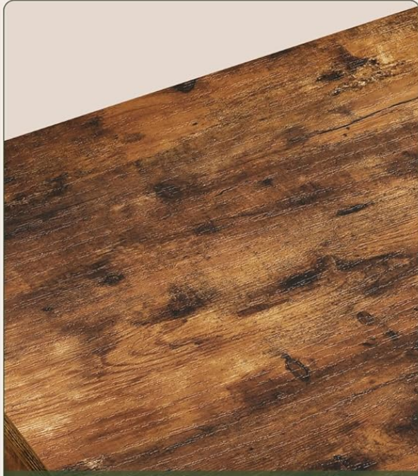
Premium Engineering Wood