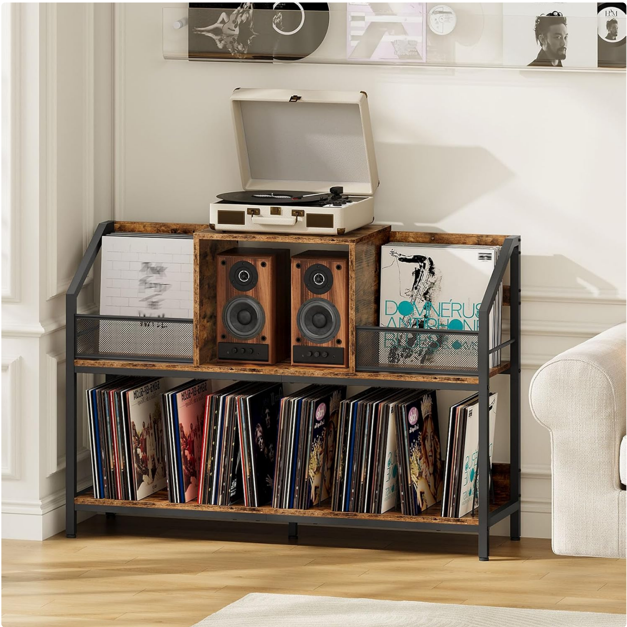
Image: The CHOEZON 43" Vinyl Record Storage Holder, showcasing its design and storage capabilities for a record player, speakers, and vinyl albums.