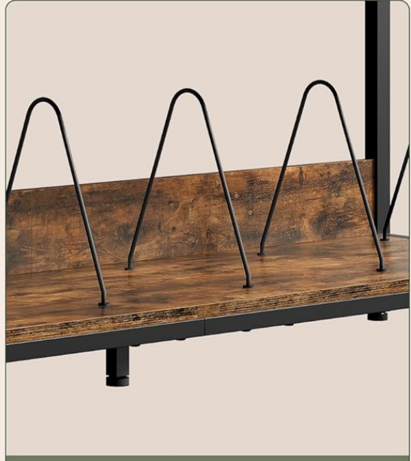
Metal Wire Dividers