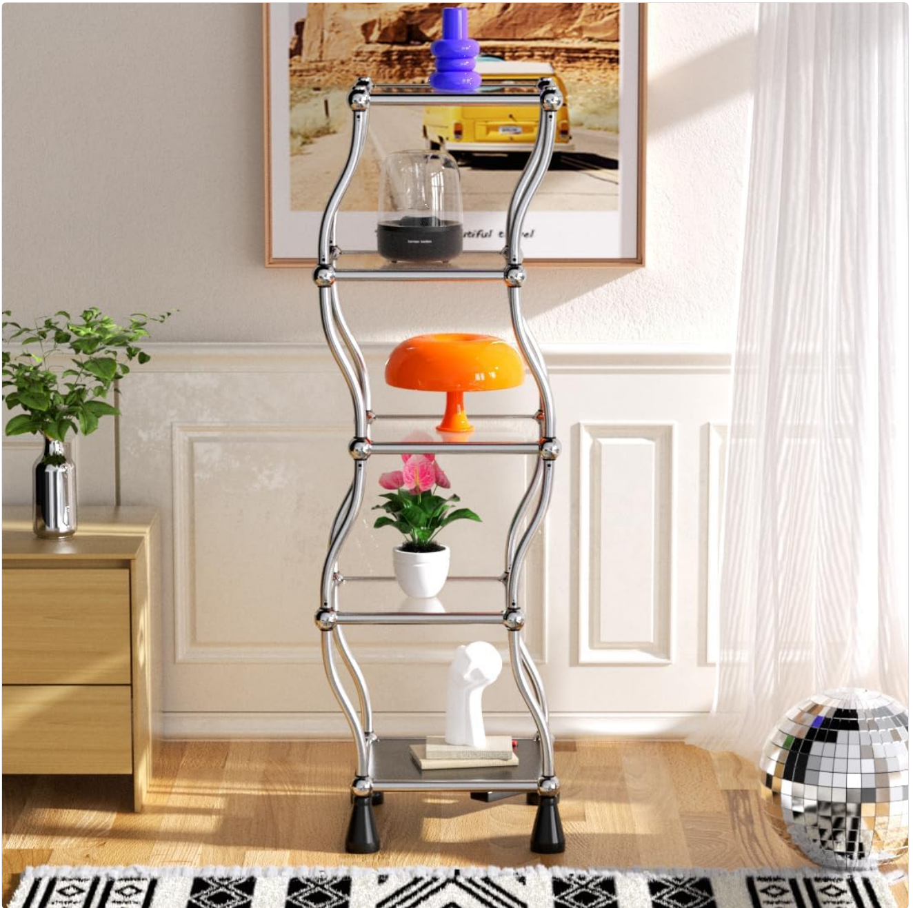
Image: The fully assembled 5-tier display shelf in a living room setting, showcasing its wavy chrome design and items on its shelves.