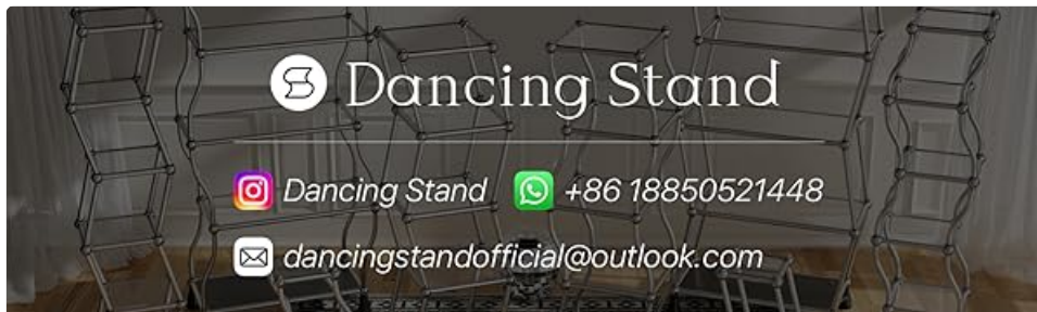
Image: Contact information for Dancing Stand Official, including Instagram handle, WhatsApp number, and email address.

For further assistance or inquiries, please contact the seller, Dancing Stand Official, through the platform where the product was purchased.