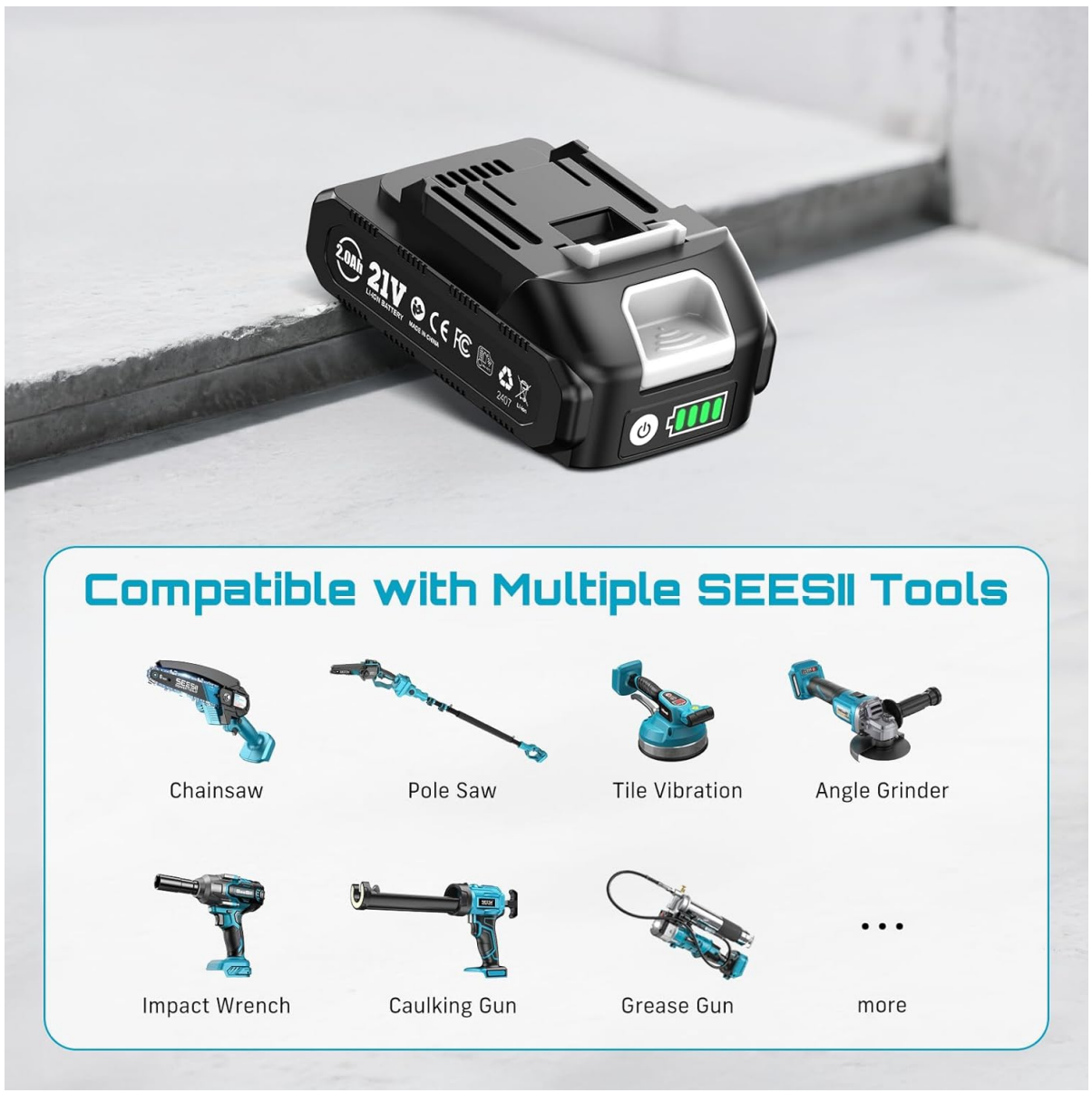
Image: Close-up view of the Seesii 21V 2000mAh battery, highlighting the green LED power indicator lights, showing a full charge.