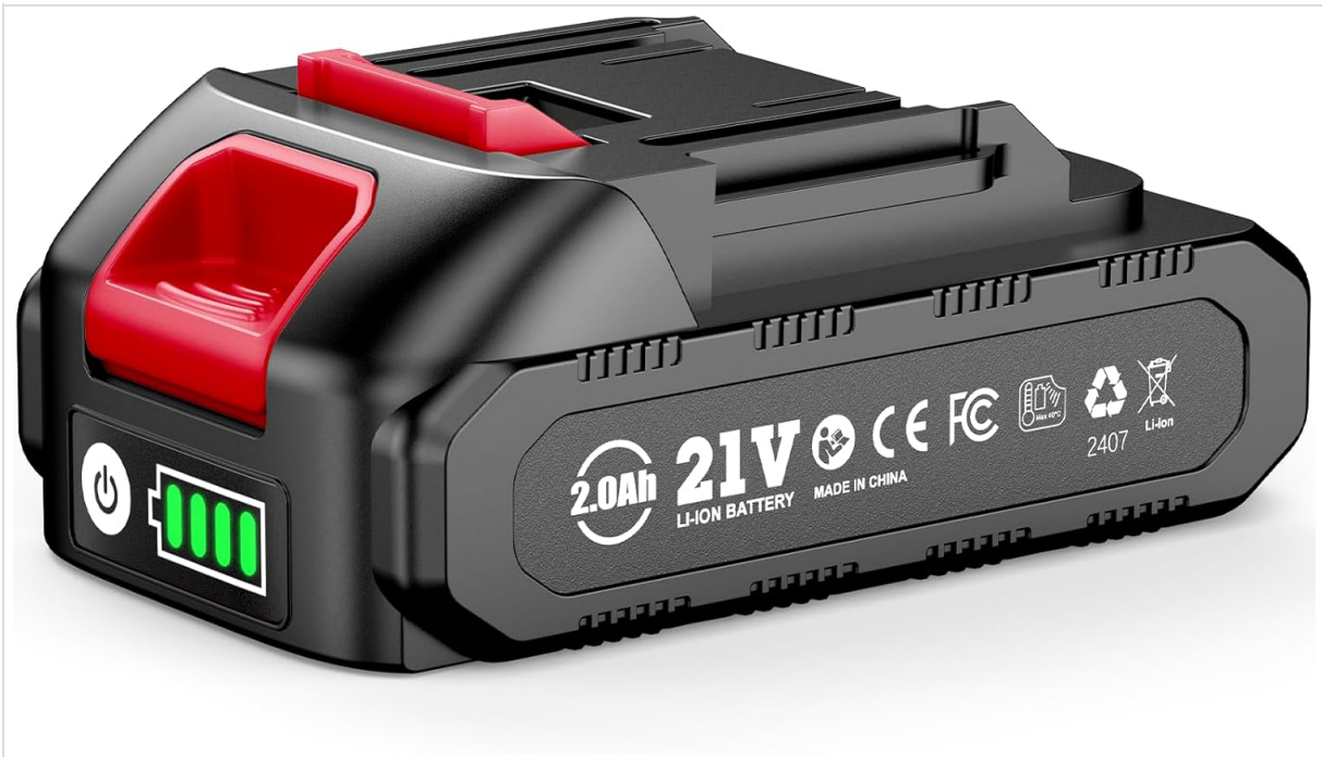
Image: Front view of the Seesii 21V 2000mAh rechargeable lithium-ion battery, showing its black casing with red accents, power indicator, and specifications.

This manual provides essential information for the safe and effective use of your Seesii 21V 2000mAh Rechargeable Lithium-Ion Battery (Model LH012). Please read these instructions carefully before first use and retain them for future reference. This battery is designed to power various Seesii 21V cordless tools, offering reliable and long-lasting performance.