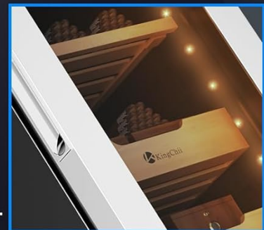
STAINLESS STEEL DOOR PANELS

This image highlights the modern design features, including the smart touch operator panel for controlling settings, ambient LED lights for interior illumination, and the durable stainless steel door panels.