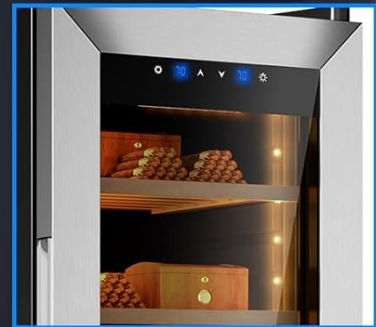
AMBIENT LED LIGHTS