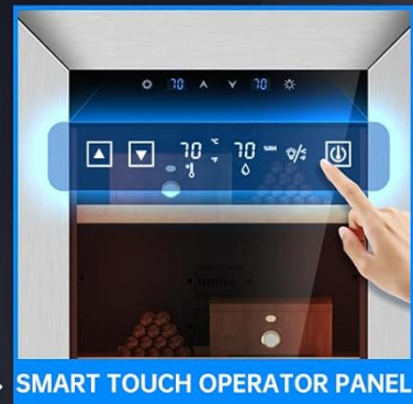
SMART TOUCH OPERATOR PANEL