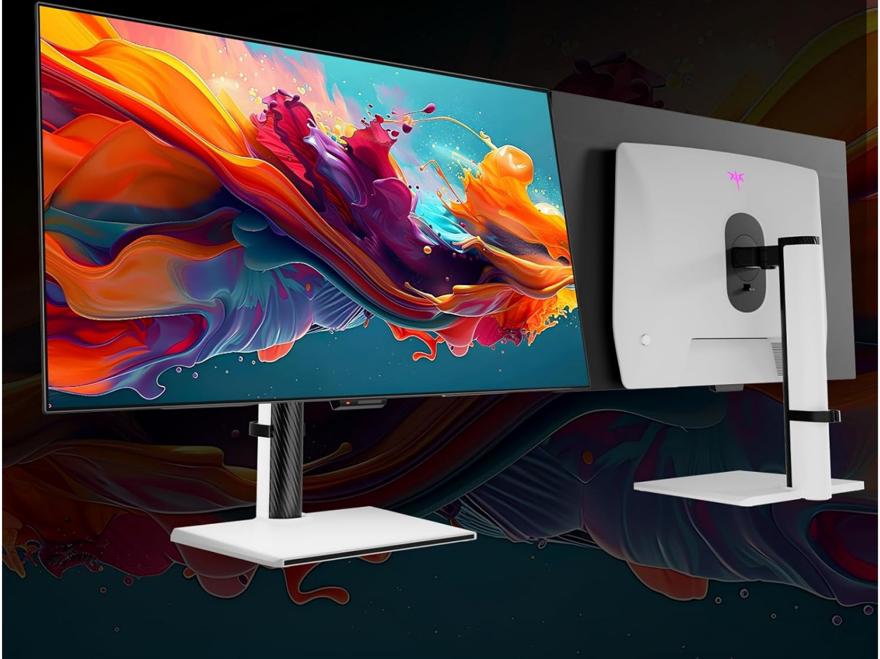
Image: Visual representation highlighting the monitor's DisplayHDR True Black 400 certification and 99% DCI-P3 color gamut for vibrant and accurate colors.