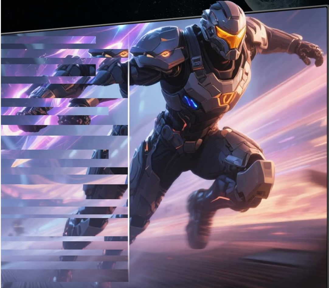
Image: Visual representation of Adaptive Sync, showing how it eliminates screen tearing for a smoother gaming experience.

Prevents screen tearing and stuttering. Suppresses flickering for smooth, fluid visuals.