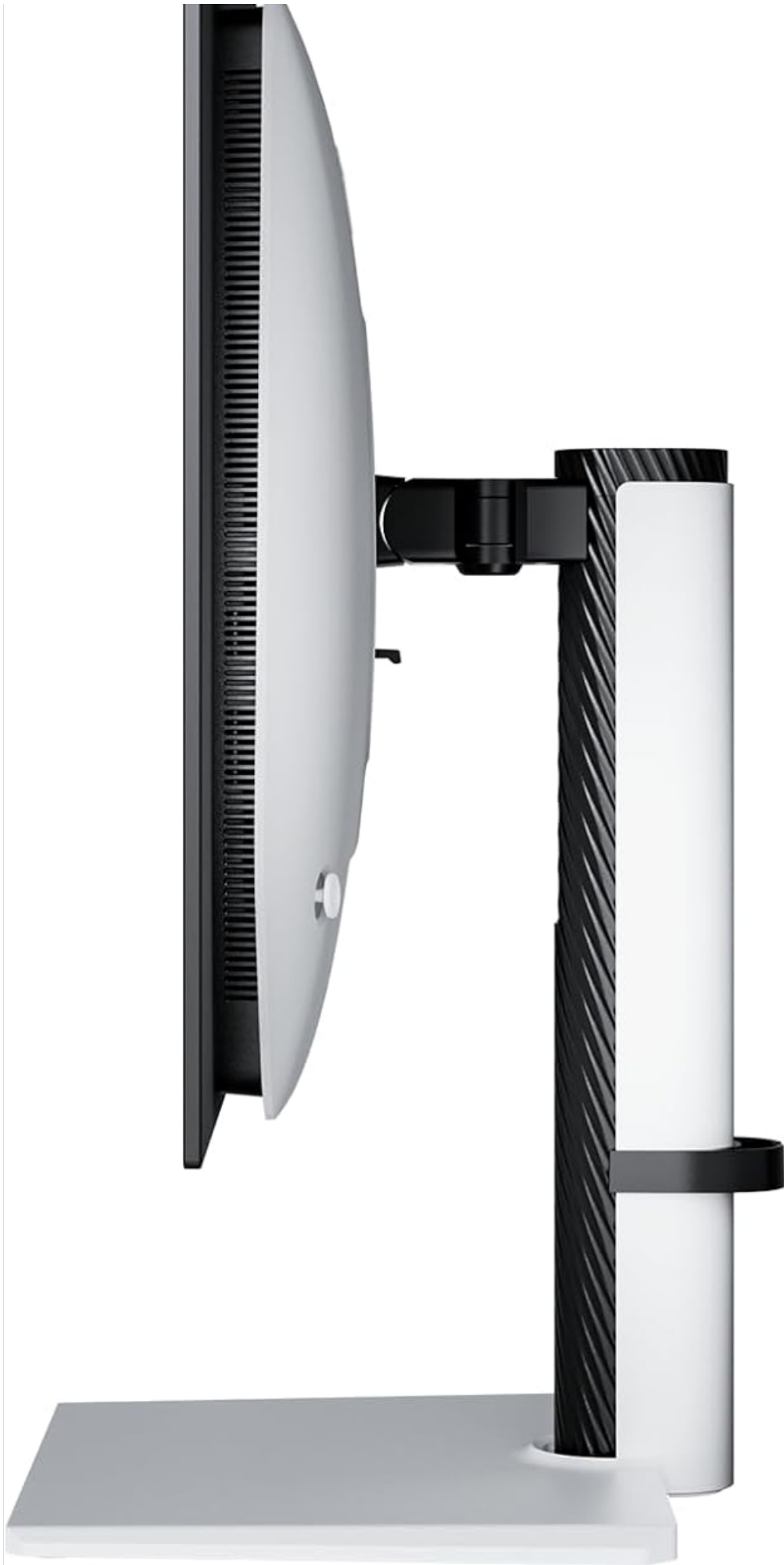
Image: Diagrams illustrating the tilt range ( -5^{\circ} to 20^{\circ} ) and height adjustment (130mm) capabilities of the monitor stand.