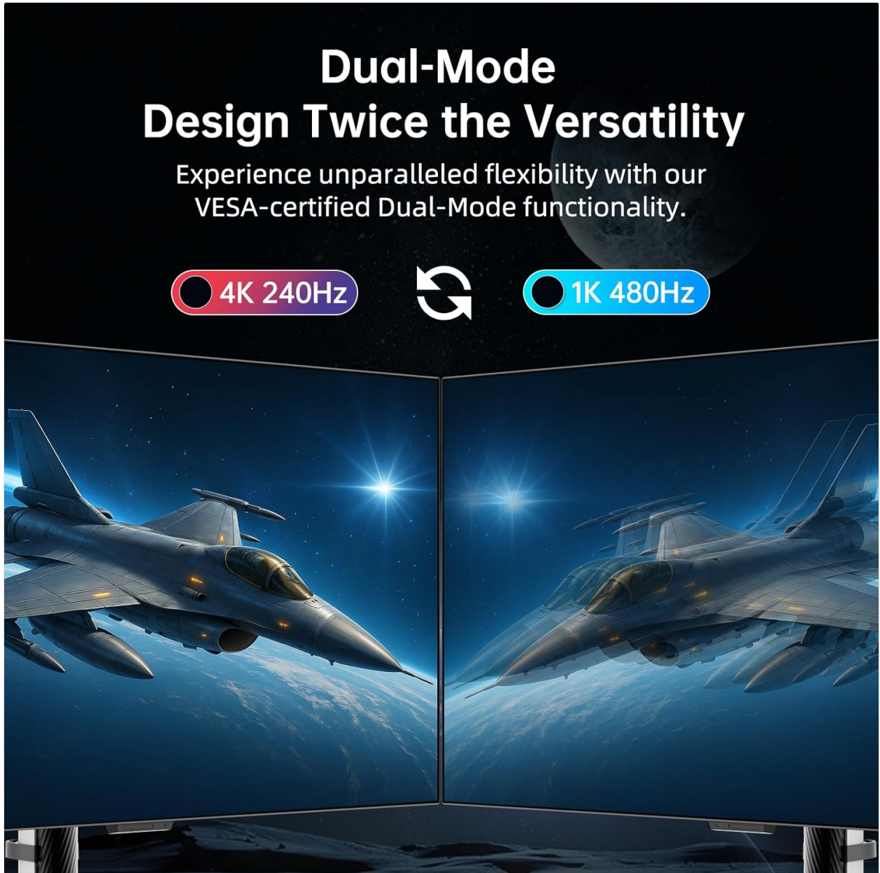
Image: Graphic illustrating the monitor's dual-mode capability, allowing switching between 4K 240Hz and 1K 480Hz resolutions/refresh rates.