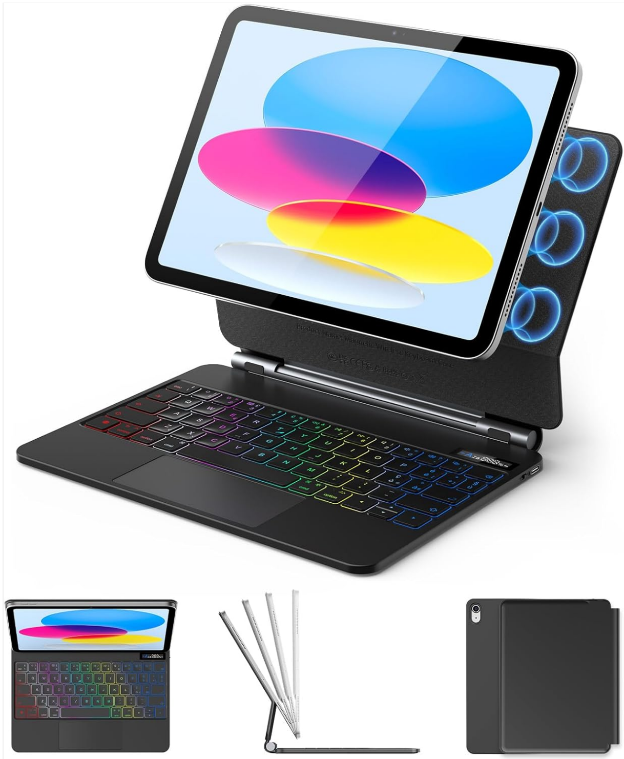
Image: The KBCASE Keyboard Case in use, demonstrating its laptop-like functionality with an iPad.