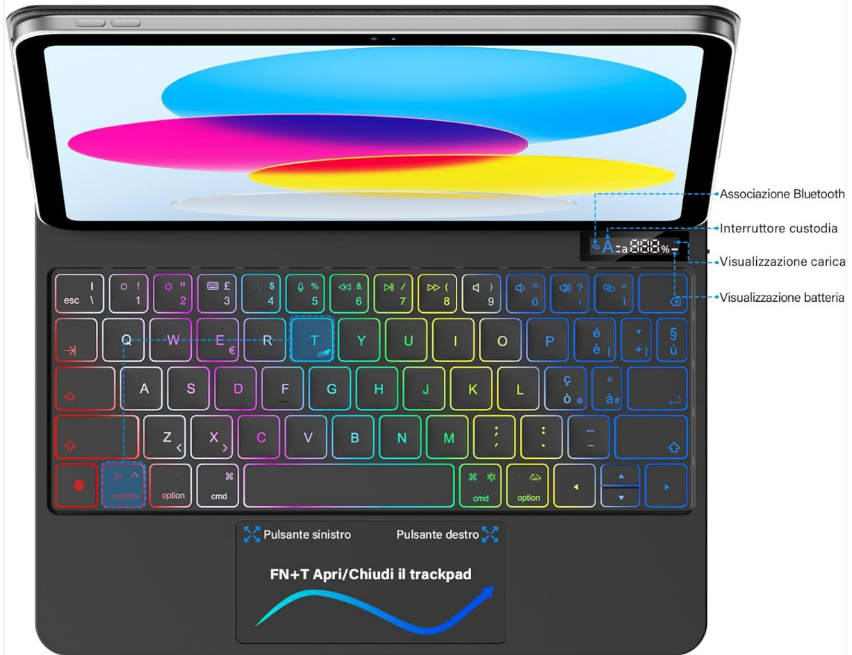
Image: Details of the keyboard's digital display and indicators for Bluetooth, power, and battery.