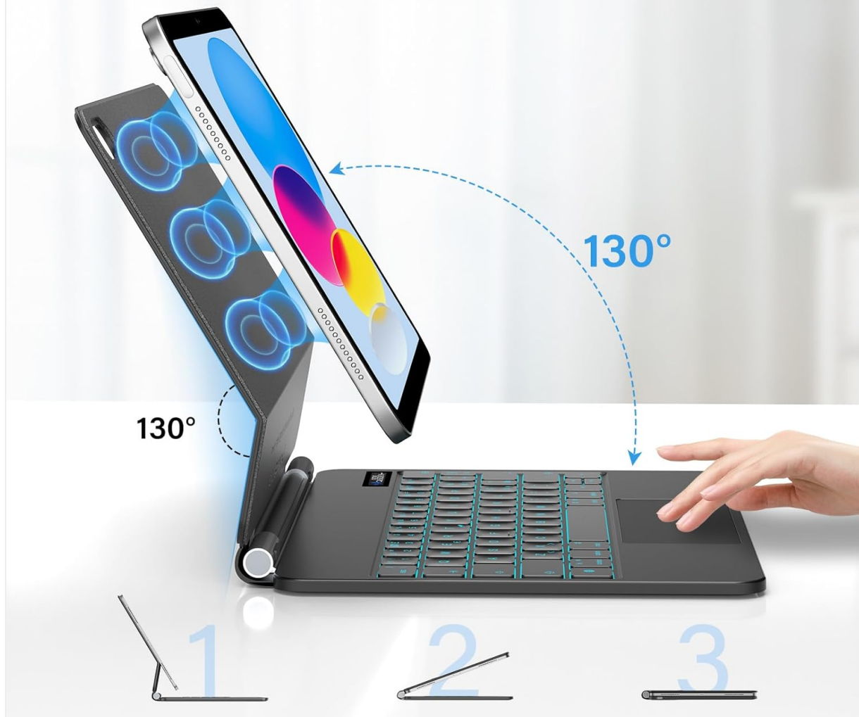
Image: Demonstrates the magnetic attachment and adjustable viewing angle of the iPad.

Offre protezione bifacciale per il tuo iPad quando è piegato