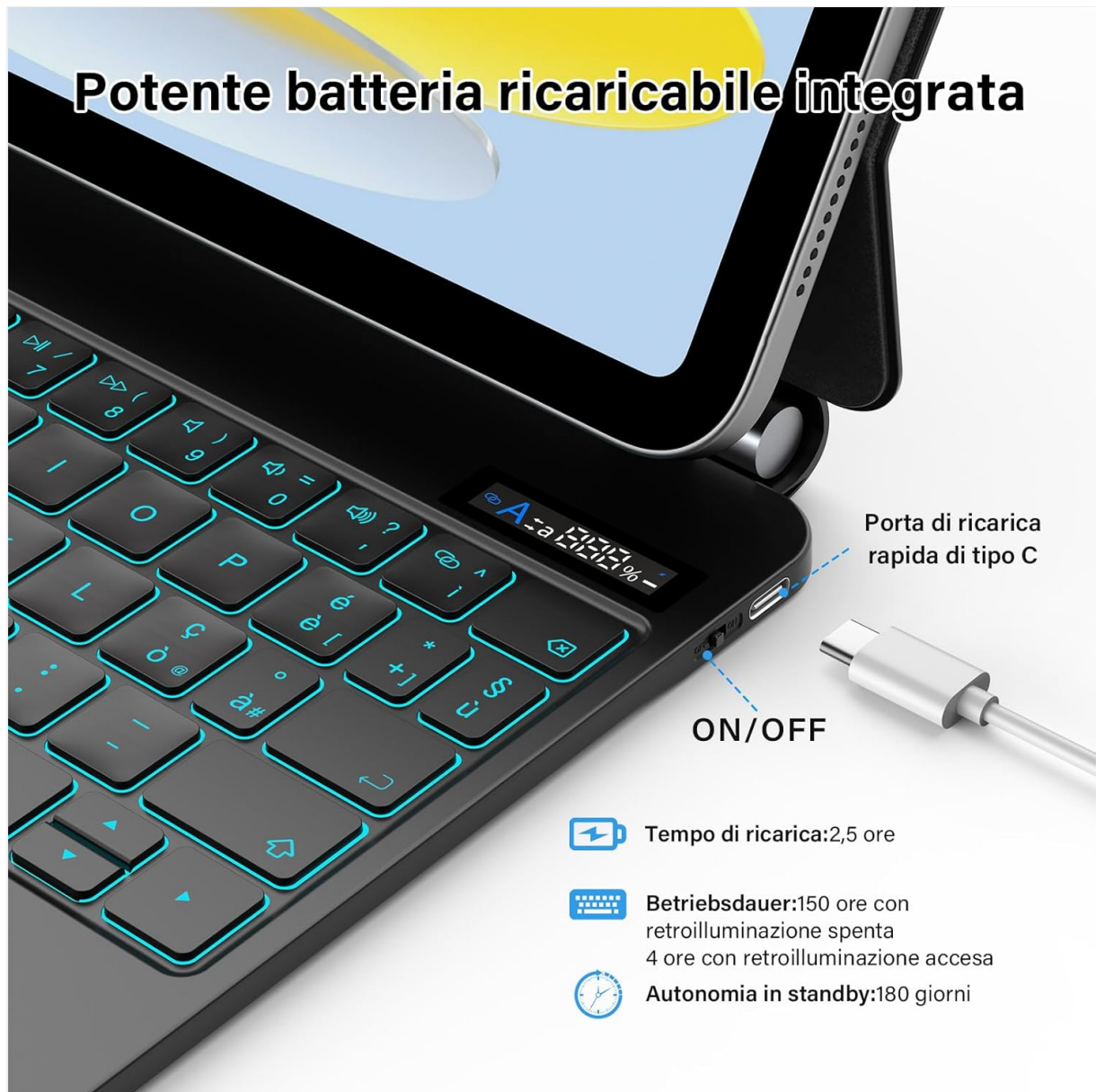
Image: Details of the charging port and battery life specifications.