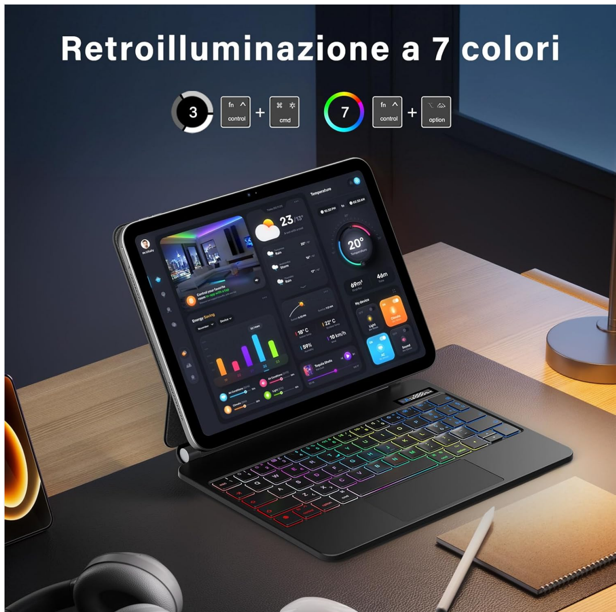
Image: The keyboard displaying its vibrant 7-color RGB backlight.