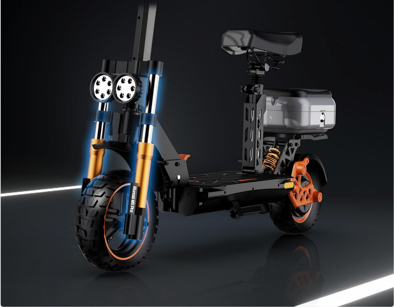
Image: Close-up views of the sensitive front and rear brake system, featuring dual disc brakes and integrated hydraulic and spring shock absorbers for effective stopping power and ride comfort.

Front hydraulic shock absorber and rear linkage suspension