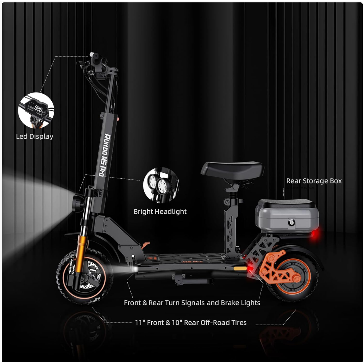
Image: A detailed view of the scooter's lighting system, including the bright front headlight, LED display, and integrated turn signals and brake lights for safety.