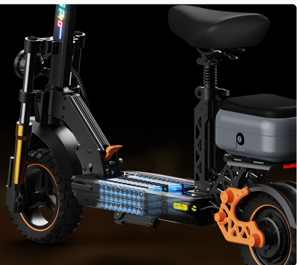
Image: A visual representation of the scooter's 48V 20.8Ah lithium battery, highlighting its large capacity and integrated safety features like over-temperature, short circuit, and overcharge protection.

The UL-certified battery boasts a waterproof and shockproof design, ensuring enhanced safety and significantly extended longevity. With a 20.8Ah capacity, the Battery Monster will take you further.