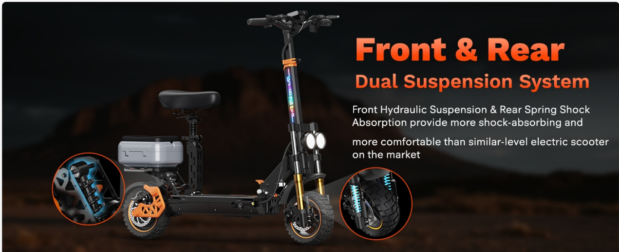
Image: A detailed view of the scooter's front hydraulic suspension and rear spring shock absorption system, designed for enhanced comfort and shock absorption.

Regularly check tire pressure and for any signs of wear or damage. The dual suspension system (front hydraulic and rear spring shock absorber) provides a comfortable ride; inspect it periodically for optimal performance.