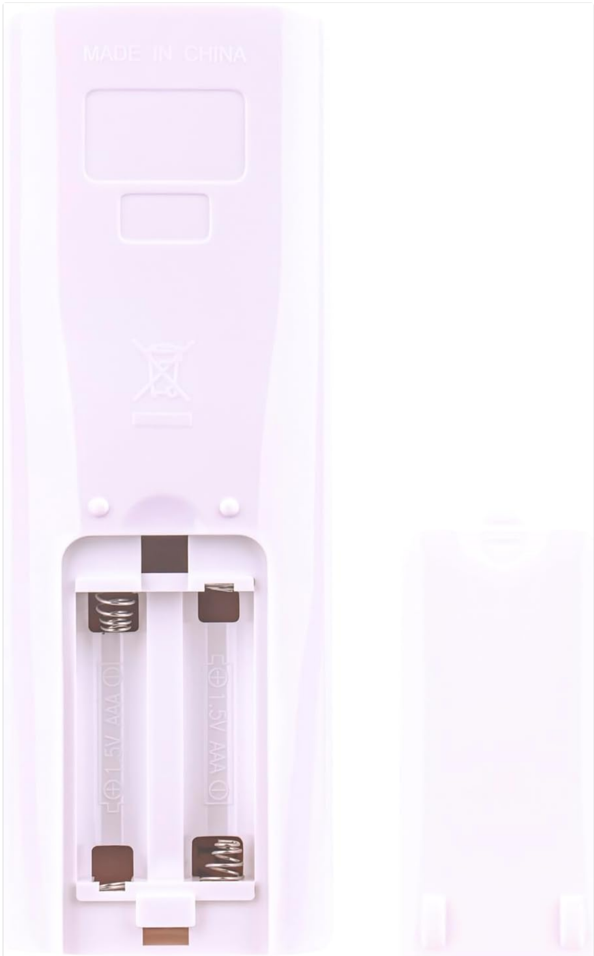
Image: Rear view of the remote control with the battery cover removed, showing the two AAA battery slots and polarity markings.