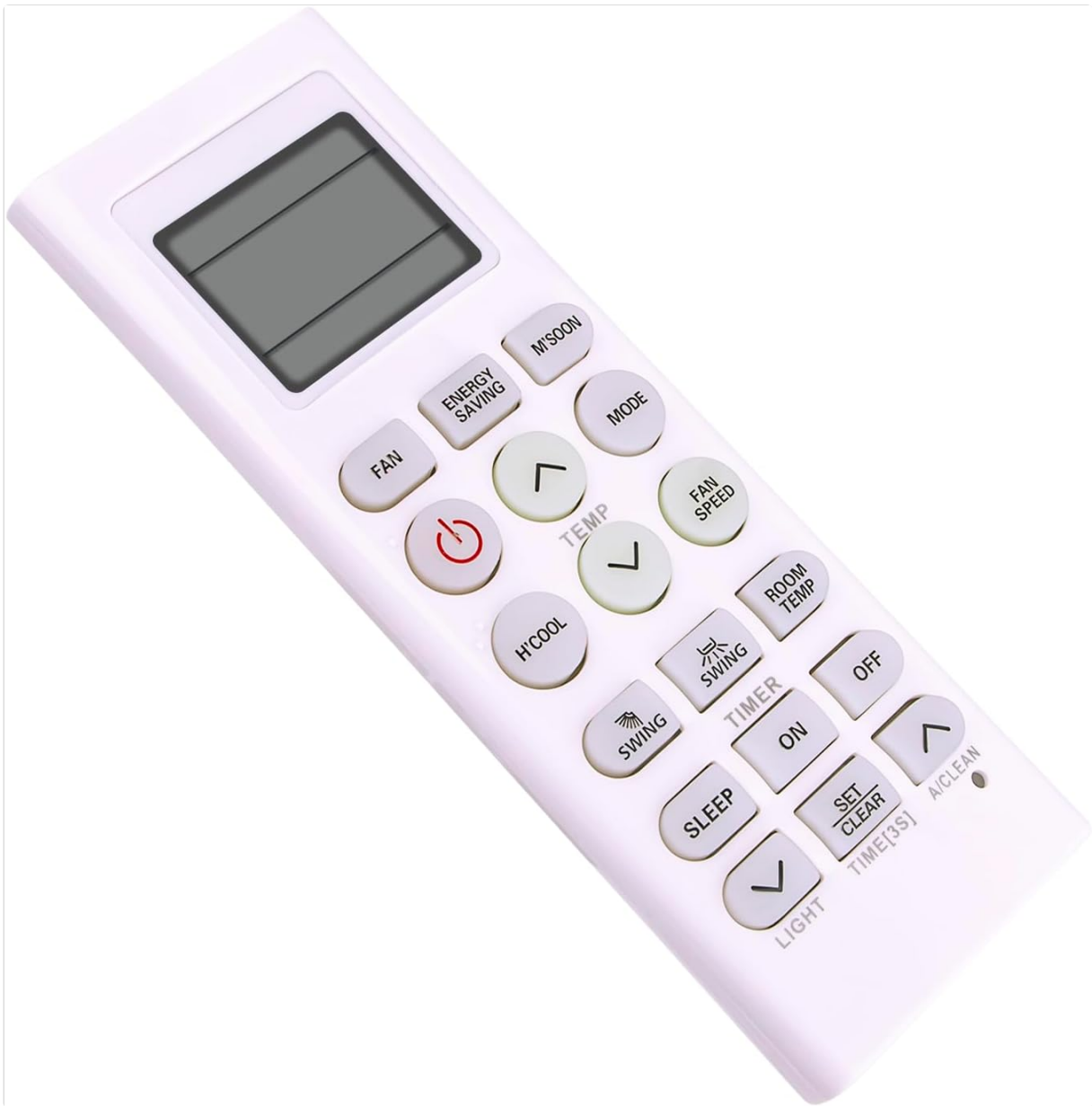
Image: Angled view of the ALLIMITY AKB73975614 remote control, showing the display and various function buttons.