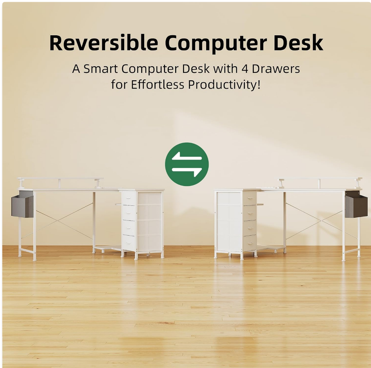
Figure 4.1: The reversible design allows for left or right L-shaped configuration.

This desk features a reversible design, allowing you to configure the L-shaped extension to either the left or right side to best suit your room layout. Plan your desired orientation before beginning assembly.