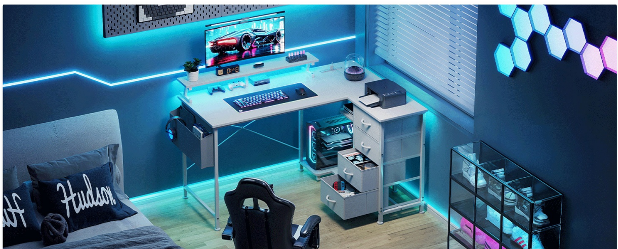
Figure 5.3: Fabric storage bag and open shelves for convenient access.