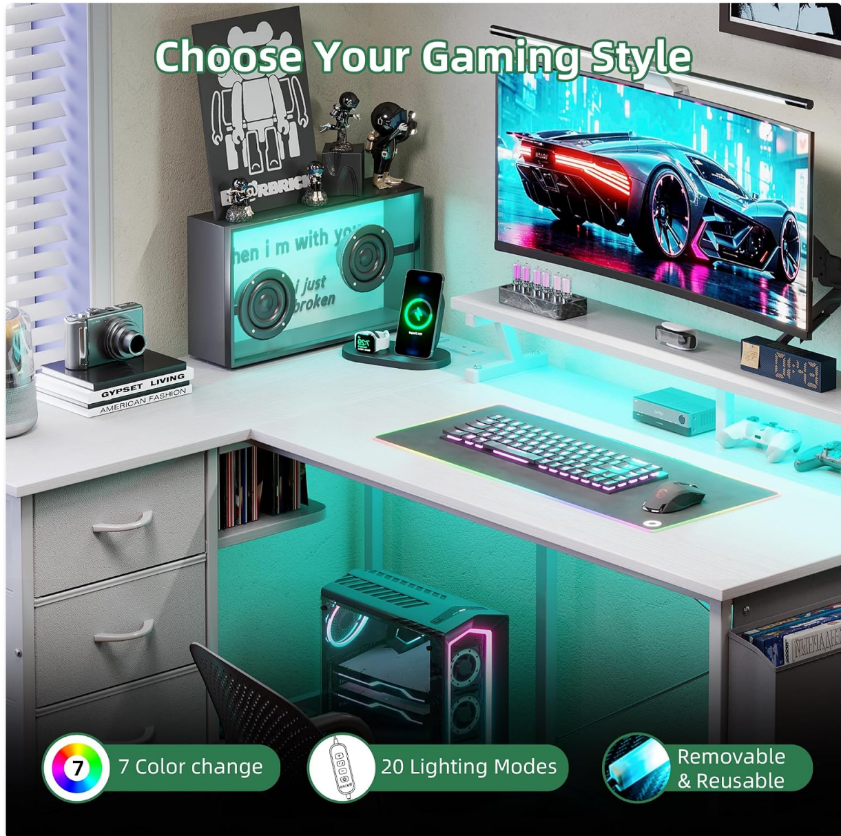
Figure 5.4: Desk with customizable lighting options.

Some models of the VERMESS L Shaped Gaming Desk may include integrated lighting. If your desk features this, it typically offers multiple color changes and lighting modes to enhance your gaming or work environment. Refer to the specific lighting control unit for operation details.