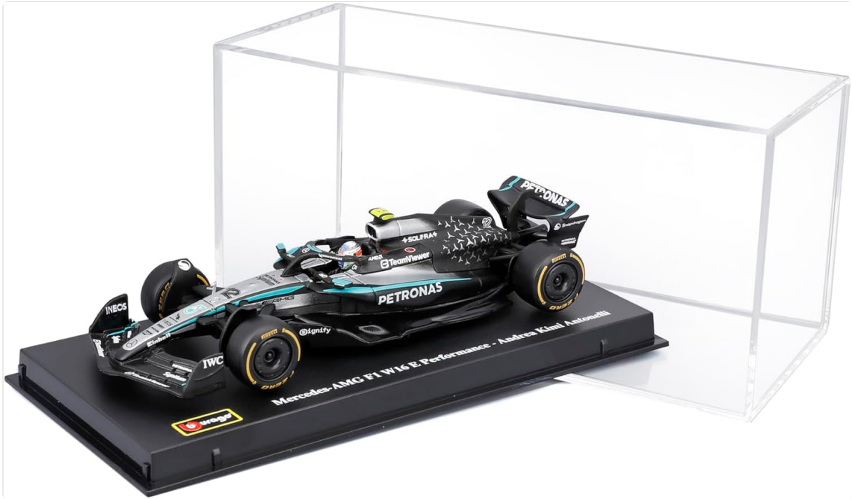
Image 2.1: The diecast model car placed on its base with the clear display case.