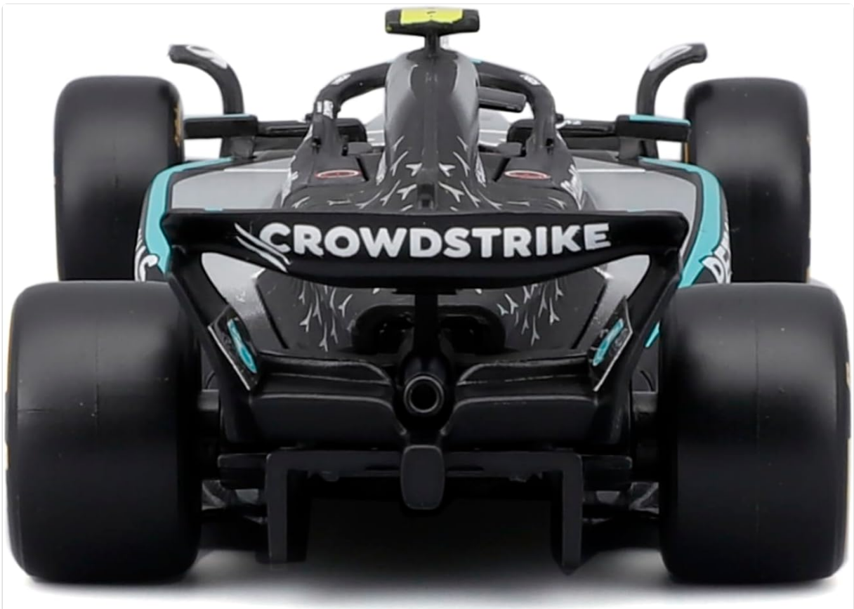
Image 3.2: Rear view of the diecast model, showing exhaust and rear wing details.