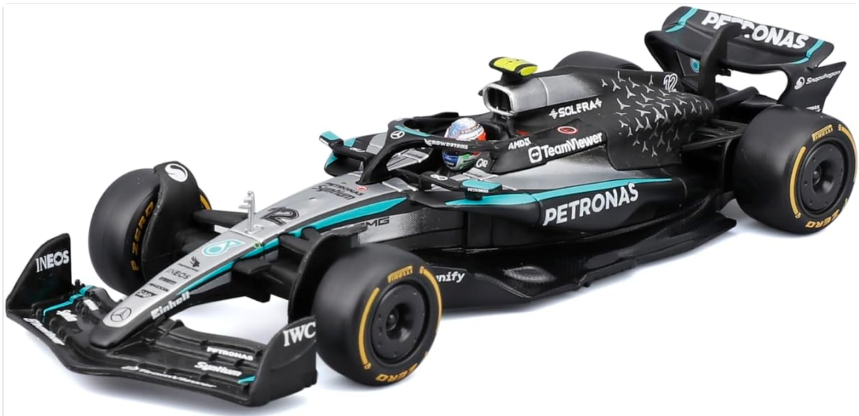
Image 1.1: Overall view of the Bburago Mercedes-AMG W16 2025 Antonelli 1:43 Diecast Model Car.

This manual provides instructions for the Bburago Mercedes-AMG W16 2025 Antonelli 1:43 scale diecast model car. This product is an official replica of the single-seater driven by Andrea Kimi Antonelli for the Mercedes-AMG Petronas F1 team in the 2025 season, featuring an iconic silver-black finish. The model is crafted from diecast metal with high-quality workmanship and includes a personalized base and a clear display case for presentation. This model is intended for collectors aged 14 and up.