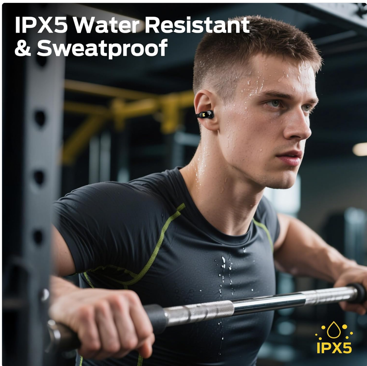
Figure 8: The IPX5 rating ensures the headphones are water and sweat resistant for active use.