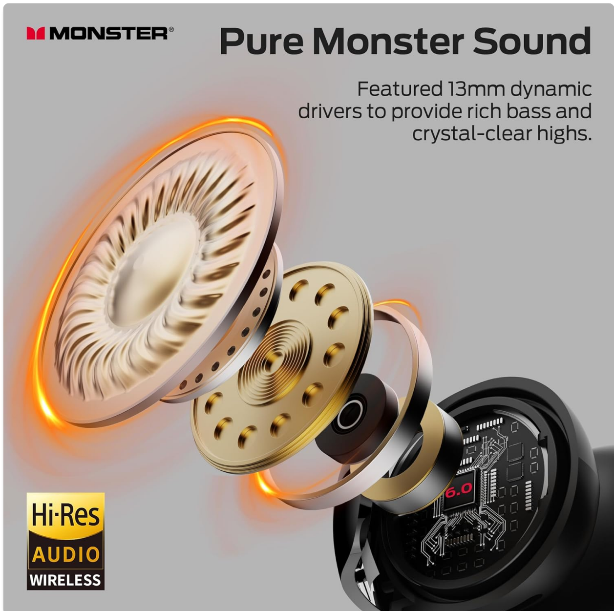
Figure 3: Internal structure highlighting the 13mm dynamic drivers responsible for Pure Monster Sound.