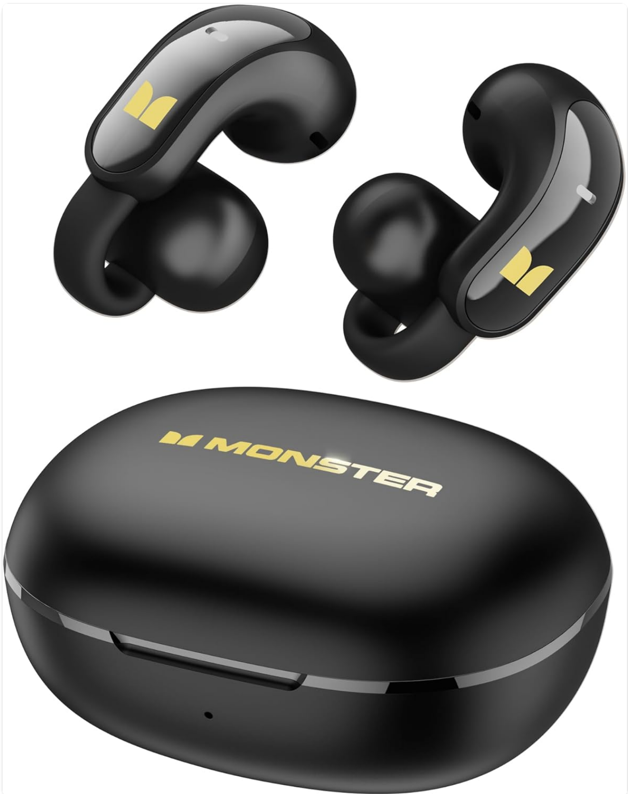
Figure 1: Monster Open Ear AC228 Wireless Headphones and Charging Case.