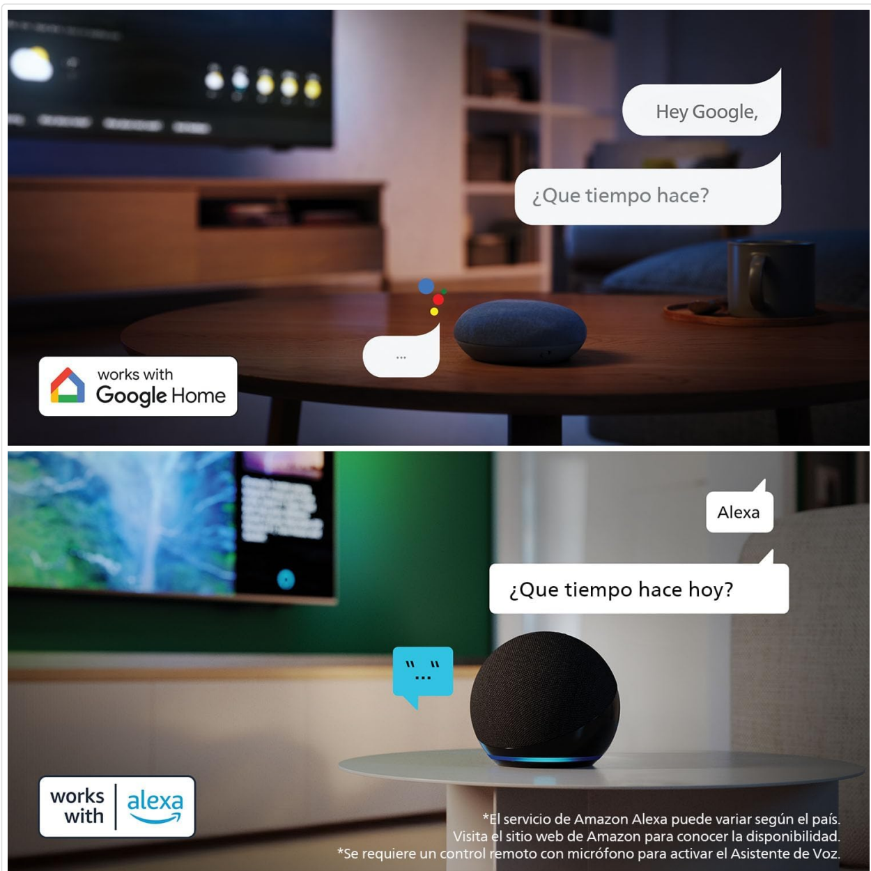
Image: Illustrations showing interaction with Google Assistant (via Google Home device) and Alexa (via Echo Dot) to control the Philips TV.

Activate Google Assistant using the dedicated button on your remote or by saying "Hey Google." For Alexa, you can use compatible Alexa devices or the remote if it has a built-in microphone for Alexa.