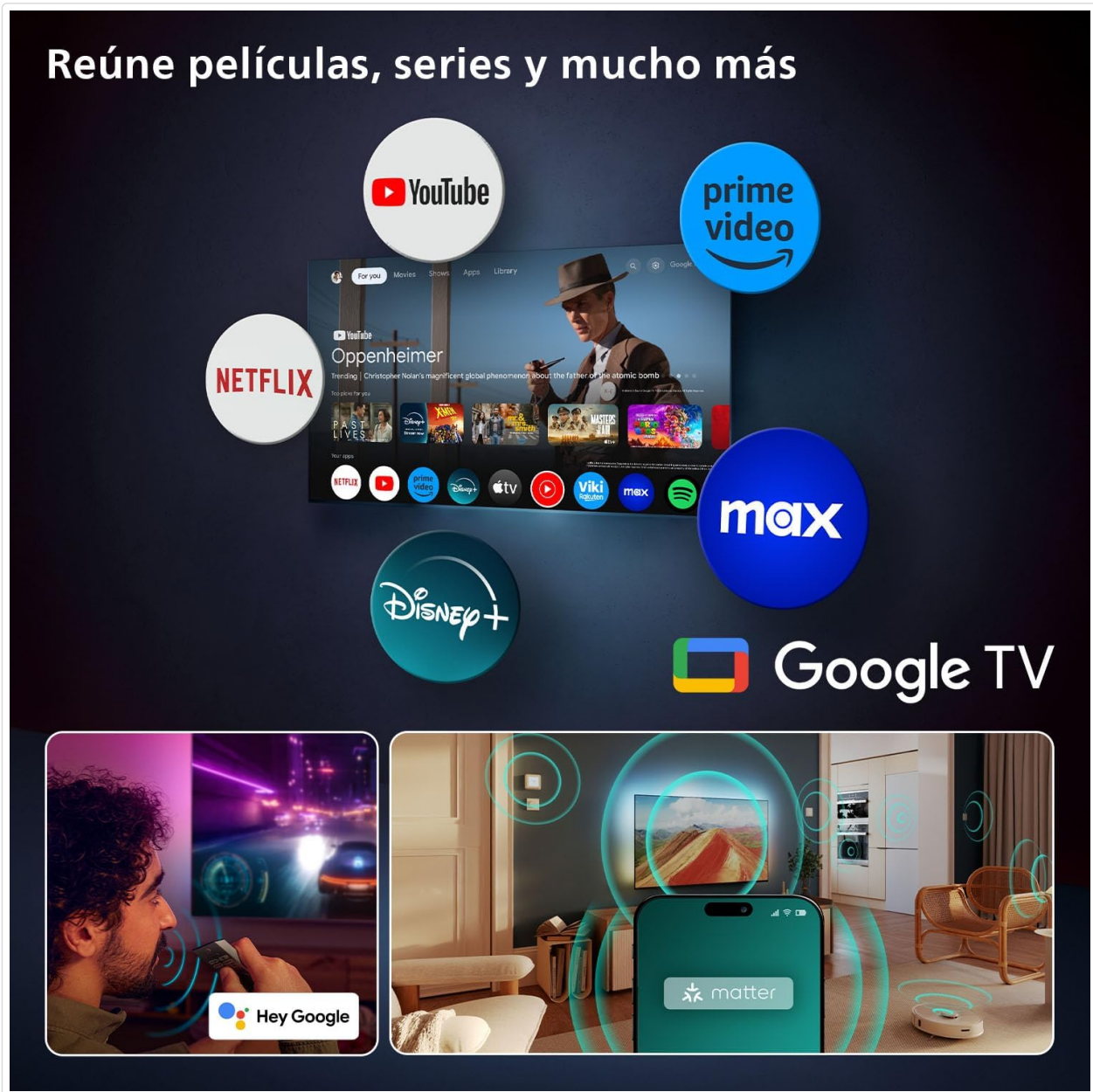
Image: The Google TV interface displaying various streaming applications like YouTube, Prime Video, Netflix, Disney+, and Max.

You can also use the Google TV app on your phone to manage your watchlist.