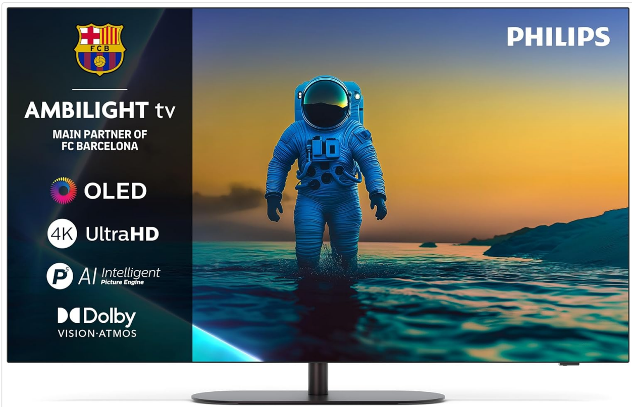
Image: Front view of the Philips Ambilight 42OLED820 TV with its stand.

Wall Mounting: If wall-mounting, use a VESA-compatible wall mount (sold separately) and follow the wall mount manufacturer's instructions. Ensure the wall can support the weight of the TV.