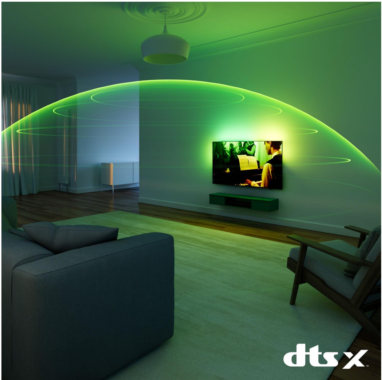
Image: A visual representation of immersive sound technology in a living room, with sound waves emanating from the Philips Ambilight TV, indicating a rich audio experience.