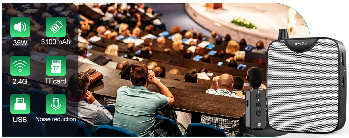
Image: A visual representation of the AI Noise Reduction function, highlighting the DSP chip within the microphone for reduced interference.

Equipped with AI noise reduction technology and a DSP chip, the microphone minimizes background noise interference, ensuring your voice is transmitted with clarity and precision.