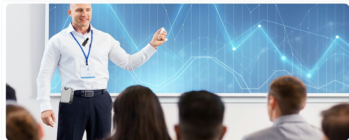
Image: A collage showcasing the wide range of applications for the SHIDU M500 voice amplifier, such as teaching, training, coaching, and outdoor events.

This portable microphone and speaker system is ideal for amplifying your voice and protecting your throat in various settings. It is suitable for teaching, training, singing, coaching, tour guiding, shopping malls, speeches, yoga classes, and outdoor events.