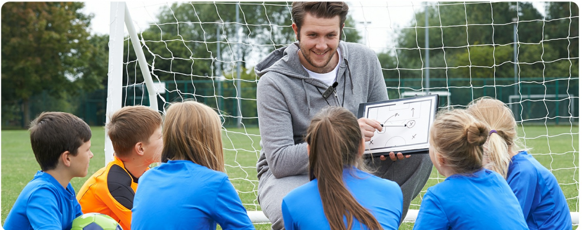
Image: A comparison illustrating the comfort of a lightweight lapel clip microphone compared to the potential discomfort of a traditional headset.

The lightweight clip-on design of the microphone can be attached to your collar or held, reducing the discomfort often associated with wearing traditional headsets for extended periods.