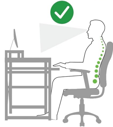
Eye Level: Promotes Better Posture

Image: An illustration demonstrating the benefits of the table's ergonomic design for maintaining proper posture while working.