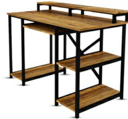
Image: A close-up view of the Klaxon Office Table's smooth sliding keyboard tray.