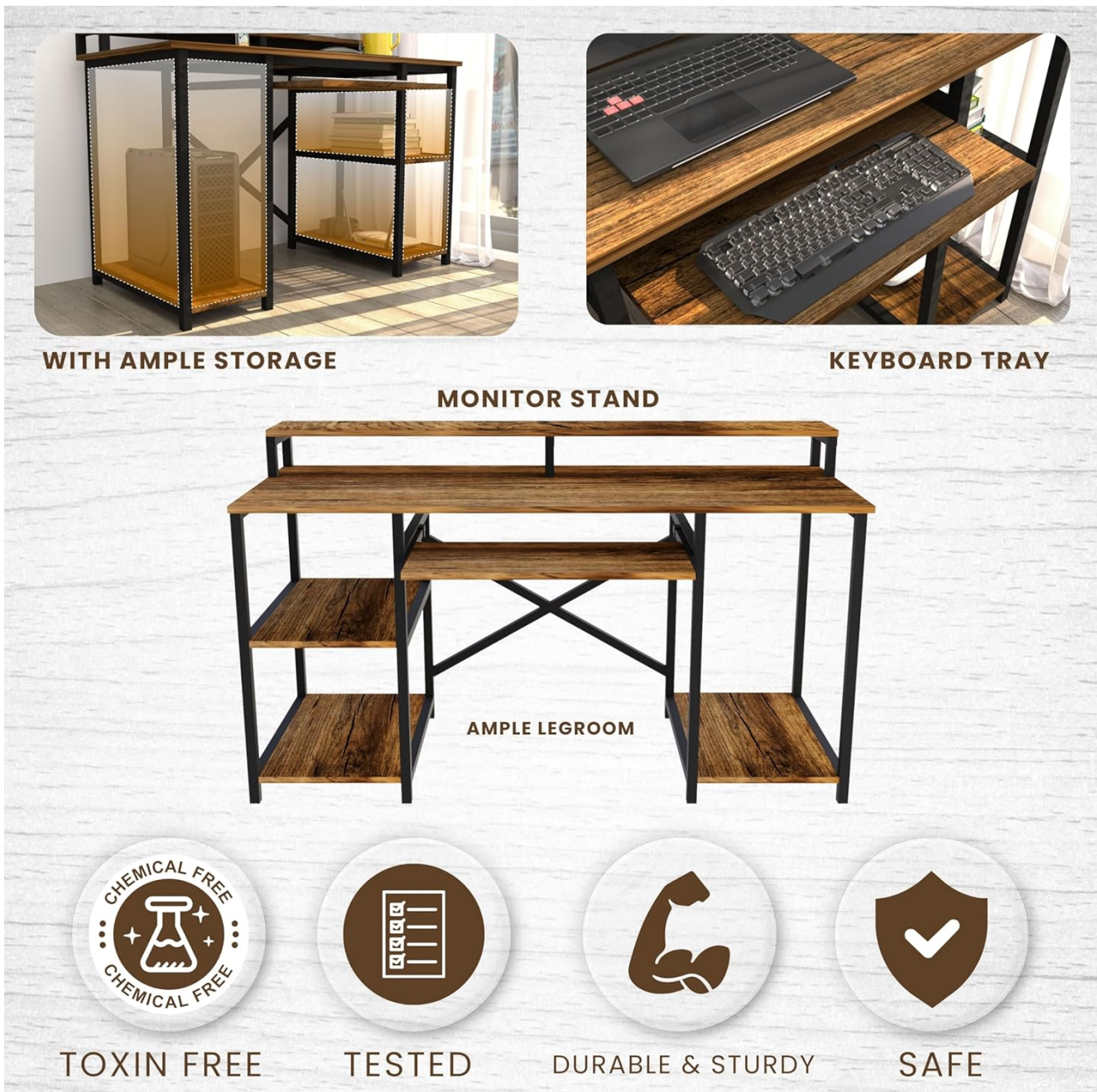
Image: Overview of the Klaxon Office Table highlighting its various components like the monitor stand, keyboard tray, and storage shelves.