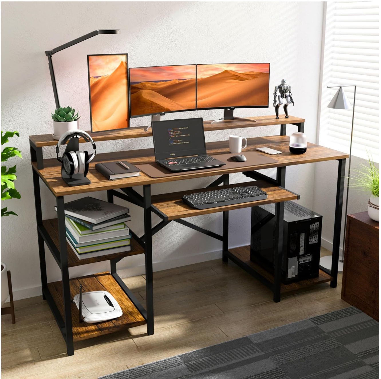
Image: The Klaxon Office Table fully assembled and set up with a computer, monitors, and accessories, showcasing its functionality.