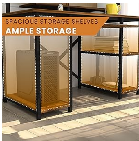
Image: The Klaxon Office Table showcasing its ample storage shelves for organizing various items.

The multi-functional design includes additional storage shelves on the side, perfect for books, office supplies, CPU towers, or gaming consoles. These shelves help keep your workspace organized and clutter-free, enhancing both functionality and visual appeal.