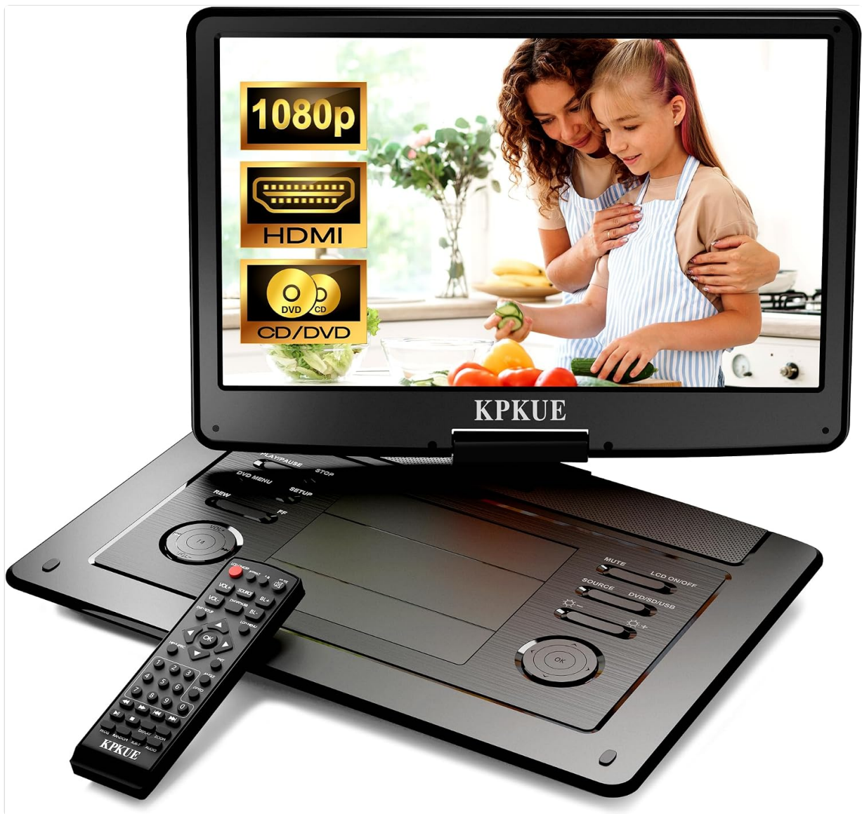
Image: The KPKUE PD156 Portable DVD Player with its screen open, displaying the control panel and a remote control. The screen shows a family watching content.

The device features a 15.6-inch Full HD (1920x1080) IPS anti-glare screen. The screen can swivel 180 degrees and flip 270 degrees for optimal viewing angles. The control panel includes buttons for playback, menu navigation, volume, and source selection.