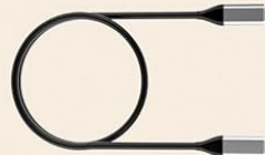
USB C Data Transfer Cable