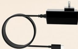
TYP C Power Adapter