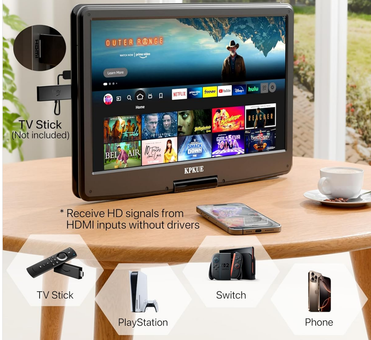
Image: The KPKUE PD156 Portable DVD Player connected to a TV stick, showcasing various streaming service interfaces.

Enjoy portable disc/streaming entertainment anytime, anywhere