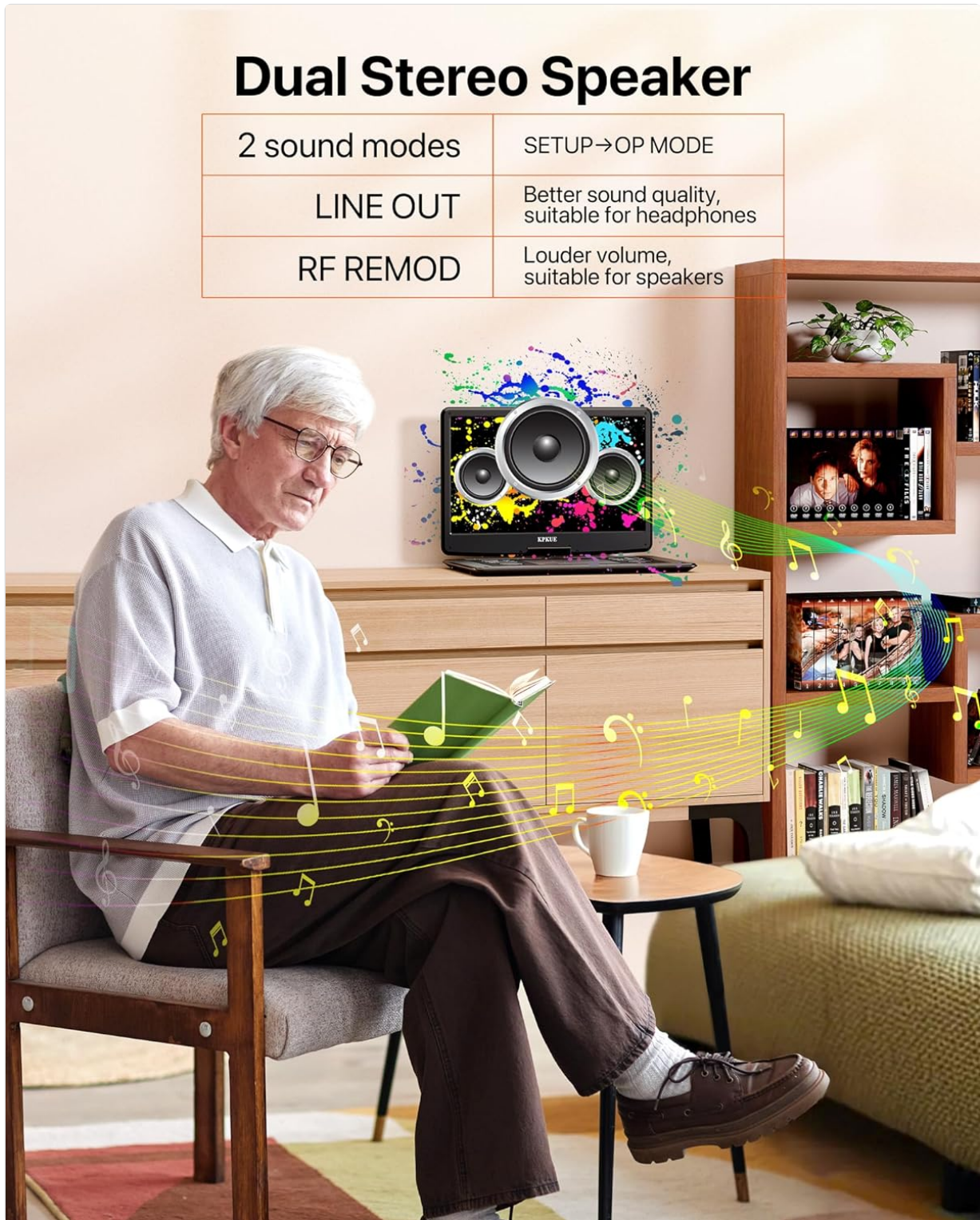
Image: The KPKUE PD156 Portable DVD Player highlighting its dual stereo speakers and two distinct sound modes: LINE OUT for improved headphone audio and RF REMOD for increased speaker volume.

Access these settings through the 'SETUP' menu on the control panel or remote.