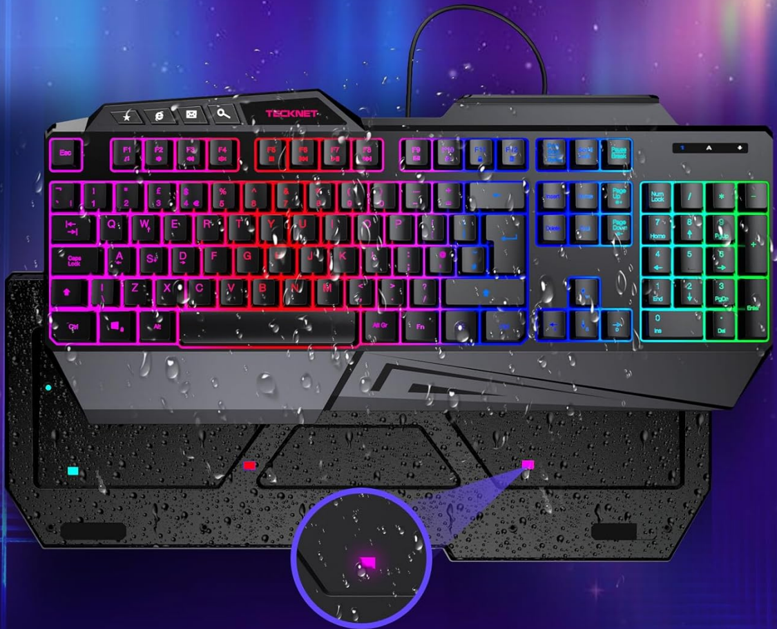
Image: The keyboard demonstrating its spill-resistant design, with water droplets on its surface and highlighting the three discreet drainage ports designed to protect the internal components from accidental liquid spills.