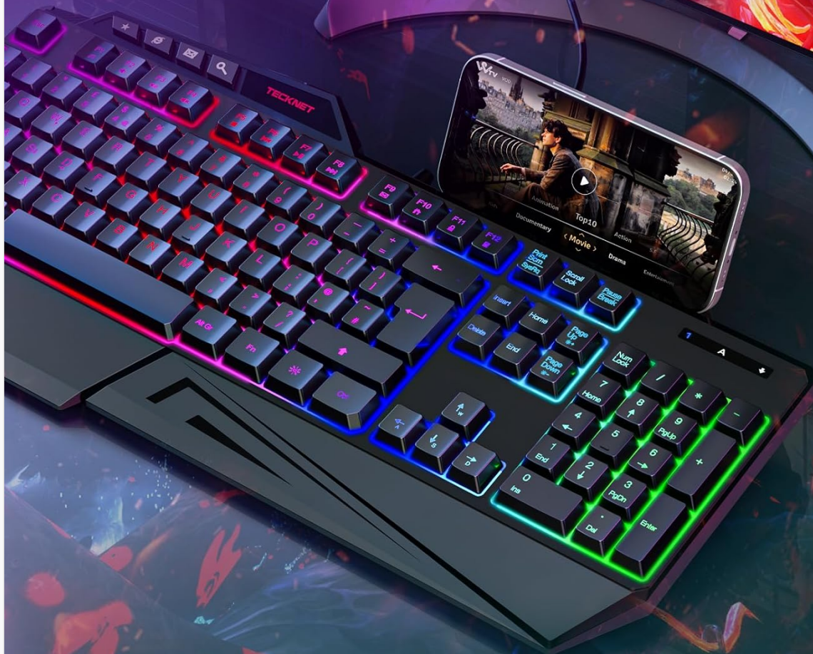
Image: The TECKNET TK-GK006 keyboard featuring its built-in phone stand, located in the top-right slot, with a smartphone placed in it, demonstrating its multi-tasking capability.