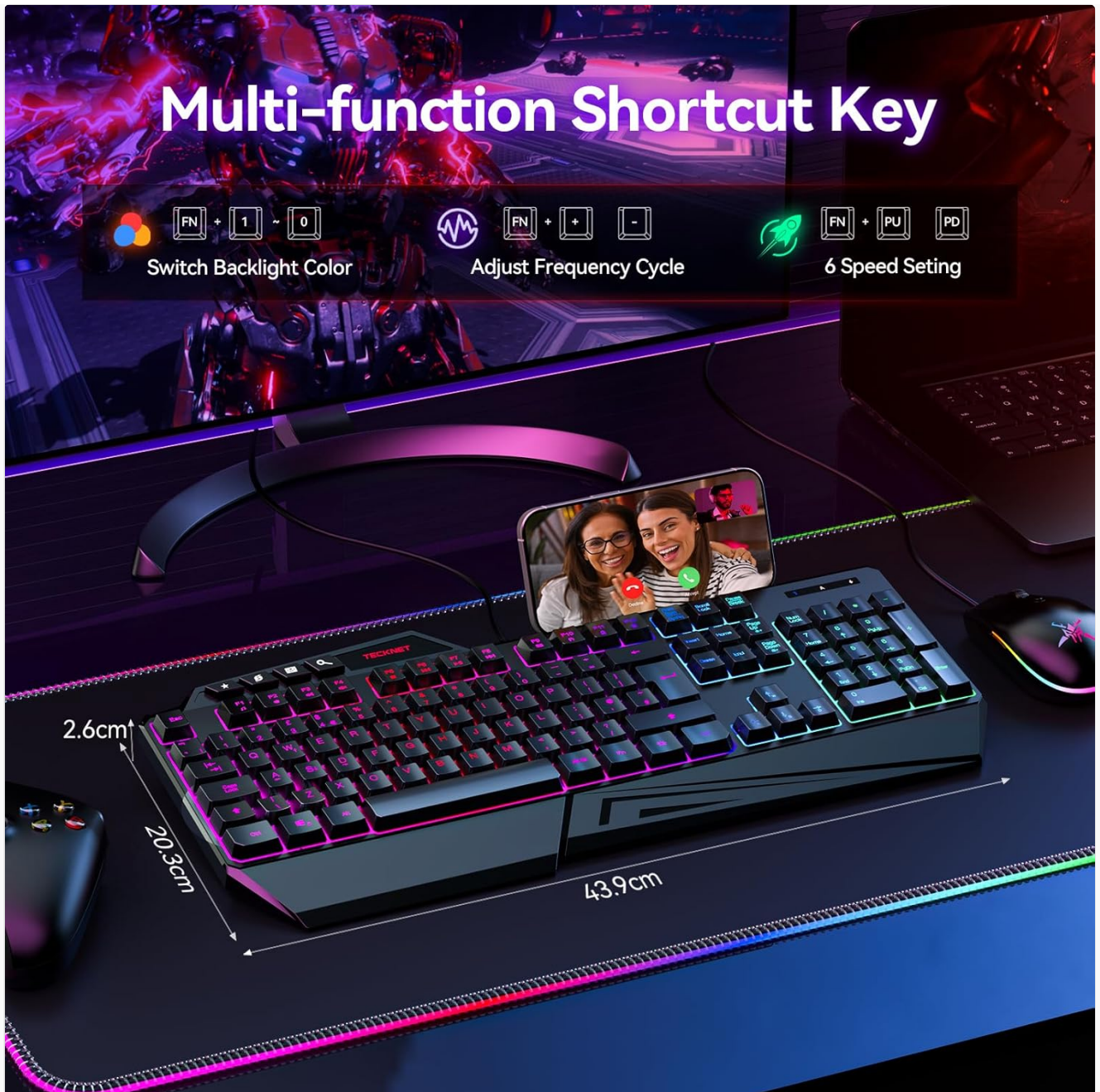
Image: The keyboard displaying its multi-function shortcut keys, specifically the FN+ combinations for switching backlight color, adjusting frequency cycle, and controlling 6 speed settings for RGB lighting.