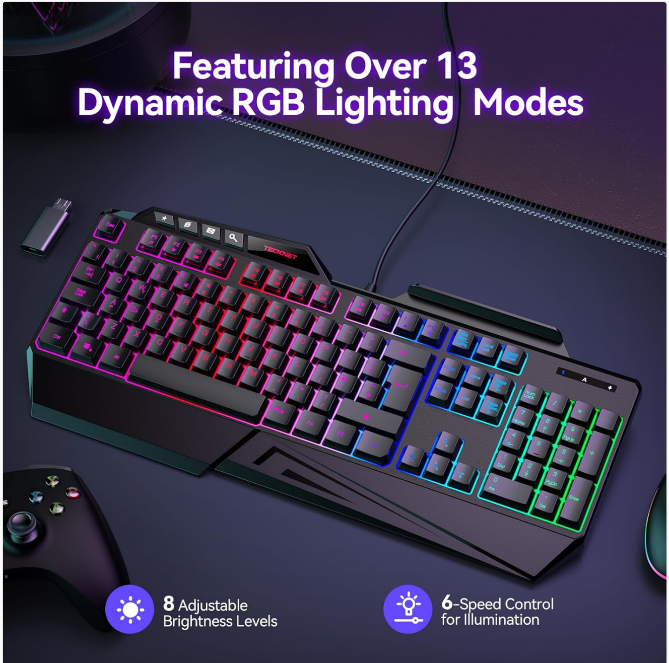
Image: The TECKNET TK-GK006 keyboard showcasing its dynamic RGB lighting modes, with indicators for 8 adjustable brightness levels and 6-speed control for illumination.