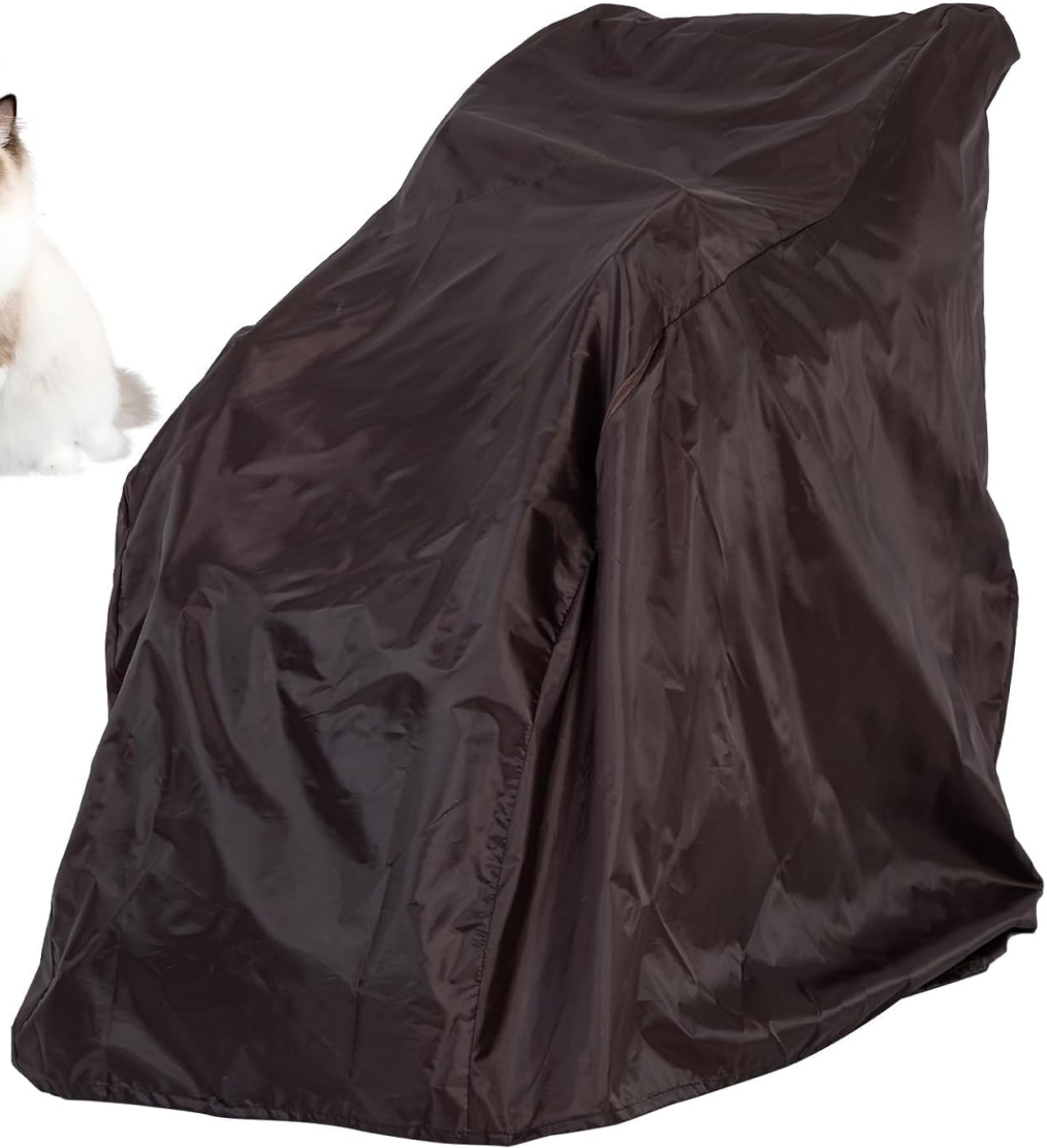
Figure 5.1: Anti-scratch Protective Cover. This image shows the protective cover in use, highlighting its ability to prevent scratches and minor damage to the chair's surface, especially from pets.