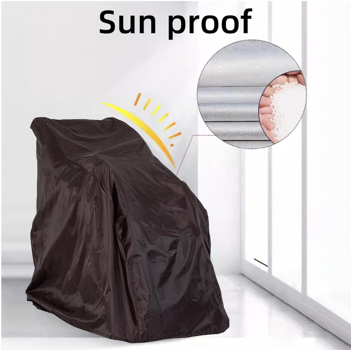
Figure 5.2: Sun Proof Protective Cover. This image illustrates the cover's material properties that help protect the chair from UV damage and fading when exposed to sunlight.