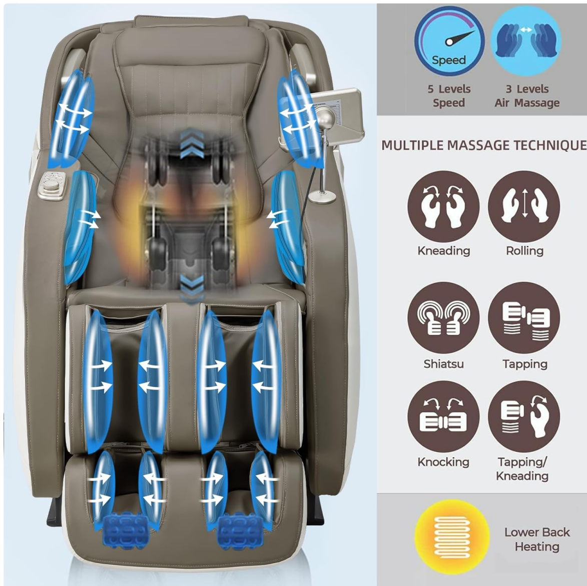
Figure 4.1: Multiple Massage Techniques and Air Massage. This diagram illustrates the 5 massage techniques (Kneading, Rolling, Shiatsu, Tapping, Knocking, Tapping/Kneading combination), 5 speed levels, 3 levels of air massage intensity, and the lower back heating function.

The MD906 offers a variety of massage techniques and preset programs: