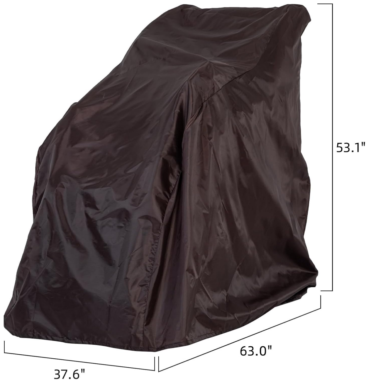
Figure 2.2: Protective Cover with Dimensions. This image illustrates the dimensions of the protective cover, measuring approximately 53.1 inches in height, 63.0 inches in length, and 37.6 inches in width, ensuring a proper fit for the MD906 chair.