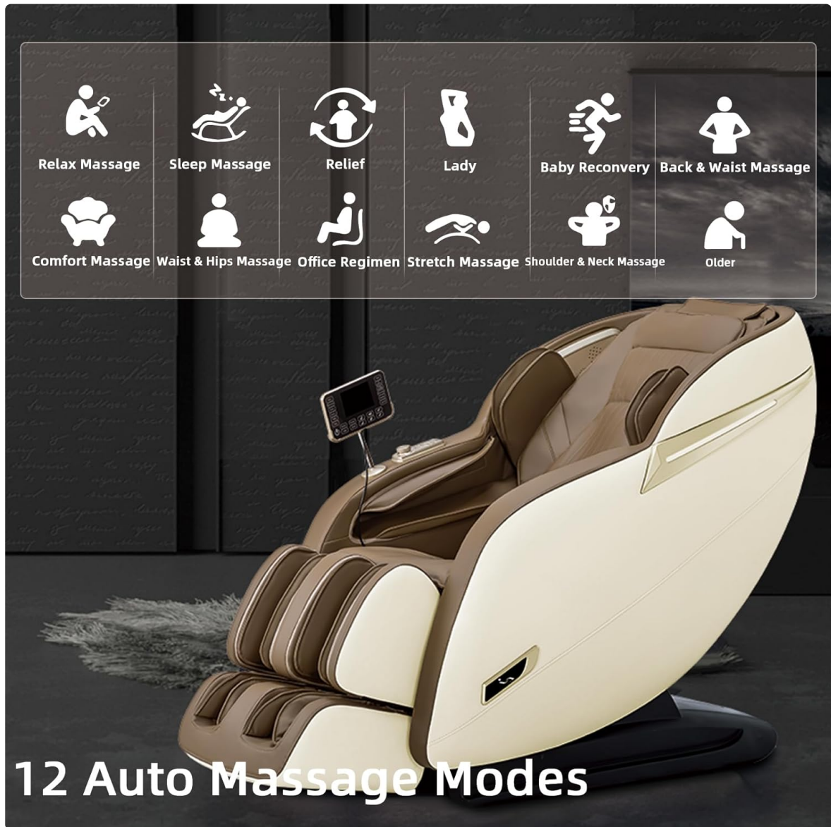
Figure 4.2: 12 Auto Massage Modes. This image displays the various preset massage programs available, including Relax Massage, Sleep Massage, Relief, Lady, Baby Recovery, Back & Waist Massage, Comfort Massage, Waist & Hips Massage, Office Regimen, Stretch Massage, Shoulder & Neck Massage, and Older.