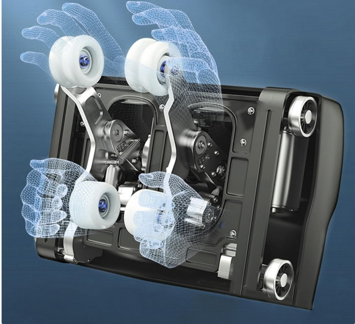
Figure 4.4: Intelligent Mechanical Massage Hands. This image highlights the sophisticated mechanical rollers that mimic human hands, providing precise and effective massage movements along the SL track.