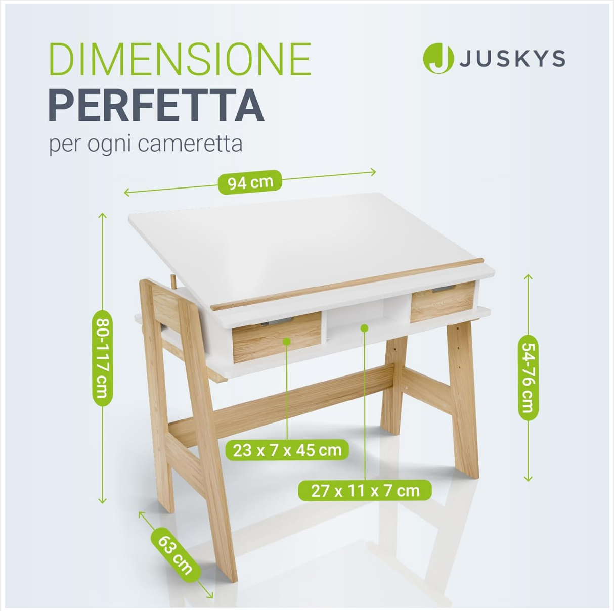
Image: A diagram illustrating the precise dimensions of the Juskys Fietje Plus desk, including overall width (94 cm), depth (63 cm), and adjustable height (54-76 cm working height, 80-117 cm when tilted), along with drawer and compartment sizes.