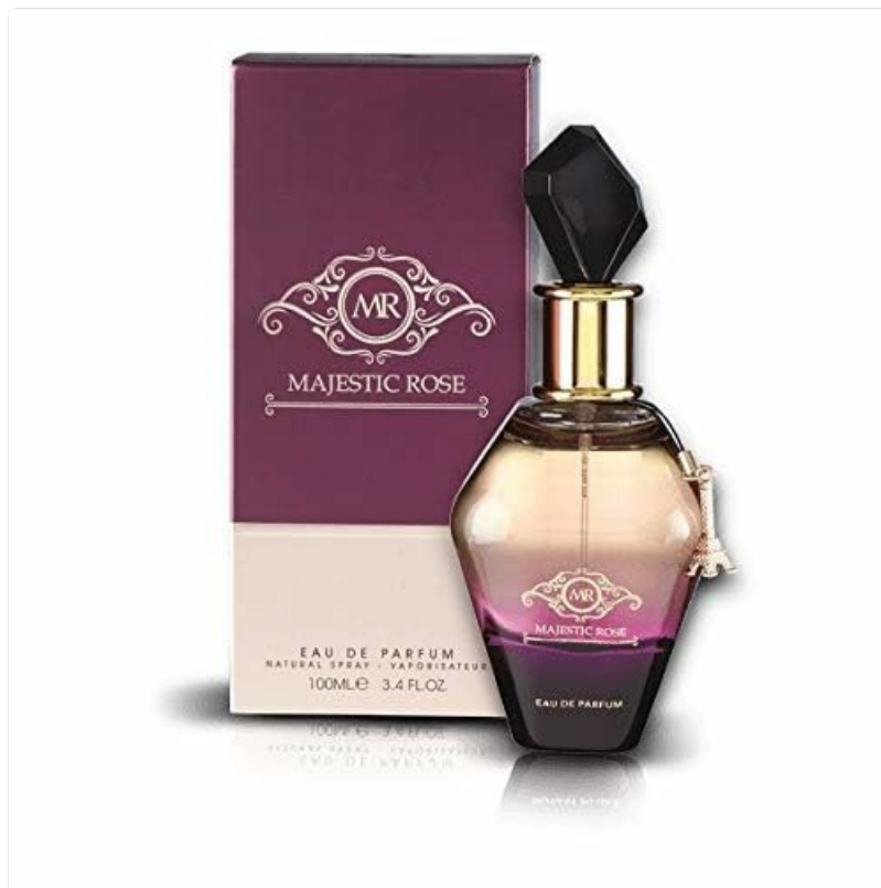
Image shows the Majestic Rose Eau De Parfum bottle, a clear glass bottle with a gradient from gold to purple, featuring a black faceted cap. The bottle is accompanied by its matching purple and white retail box, displaying the 'MR Majestic Rose' logo and 'Eau De Parfum 100ml 3.4 FL.OZ'.

The Generic Majestic Rose Eau De Parfum is a long-lasting fragrance designed for both men and women. This 100ml bottle delivers a captivating scent experience, suitable for various occasions.