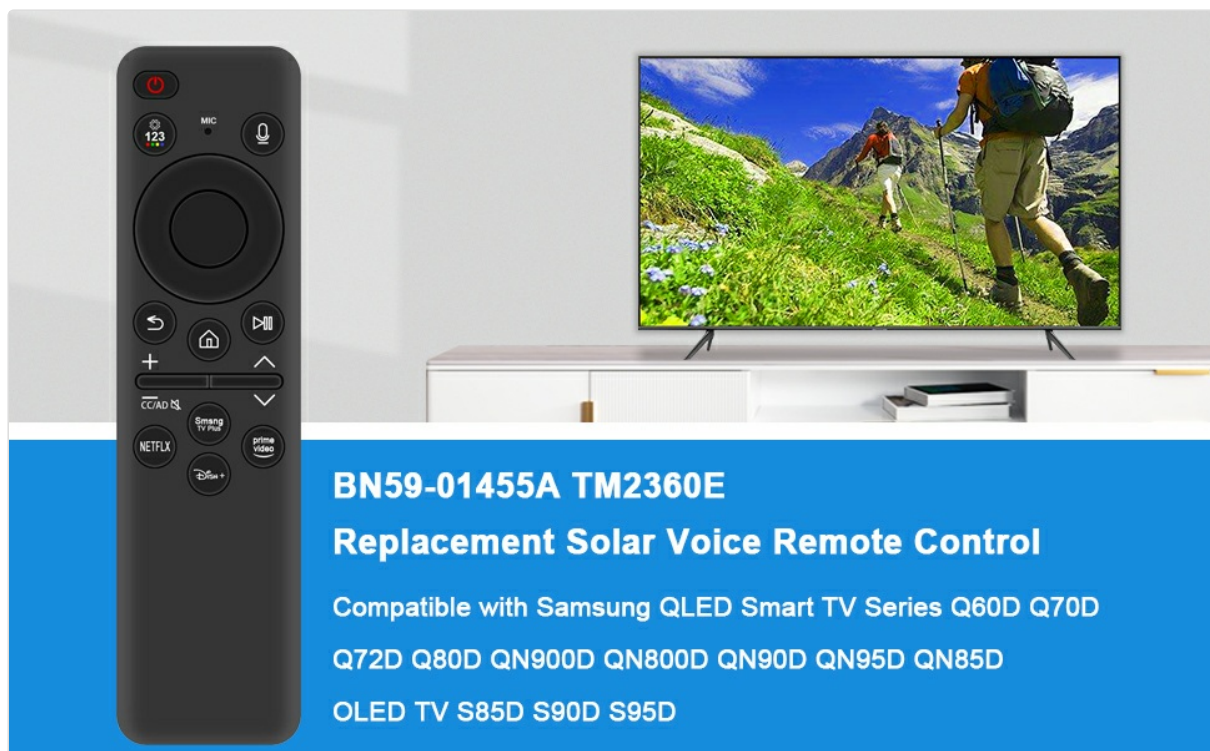
Image 1.1: The AULCMEET BN59-01455A TM2360E remote control shown alongside a compatible Samsung Smart TV, highlighting its design and compatibility.

This manual provides instructions for the AULCMEET BN59-01455A TM2360E Solar Voice Remote Control. This remote is designed as a replacement for various Samsung QLED and OLED Smart TV series, offering solar charging capabilities and voice control functionality. Please read this manual carefully before using the remote control.