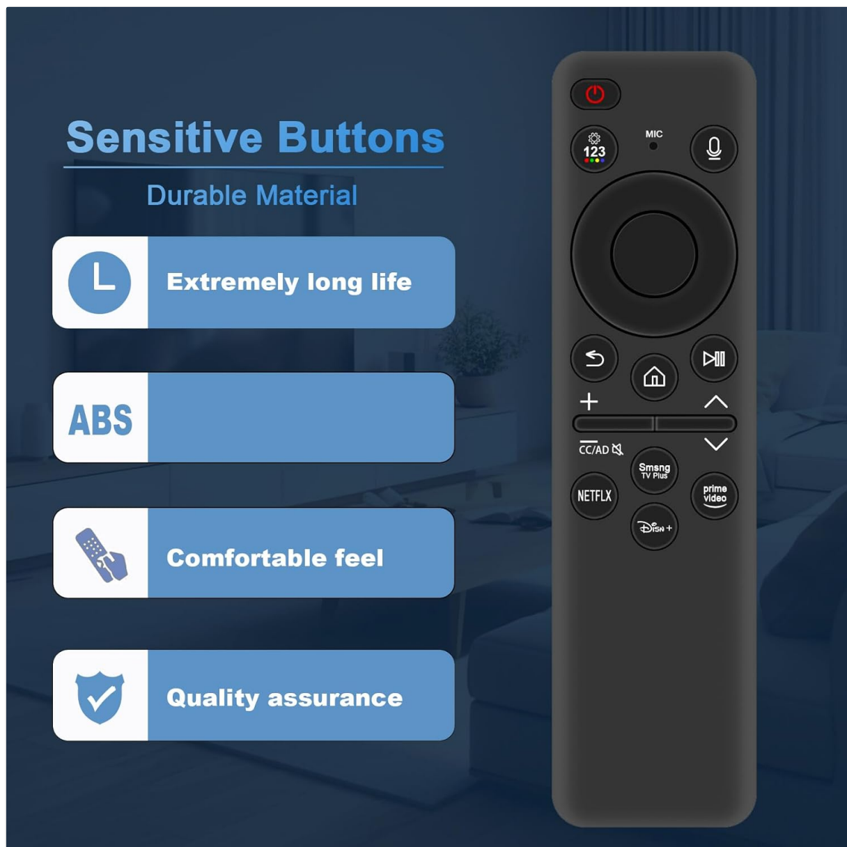
Image 2.2: Key features of the remote control, emphasizing its construction and user experience.