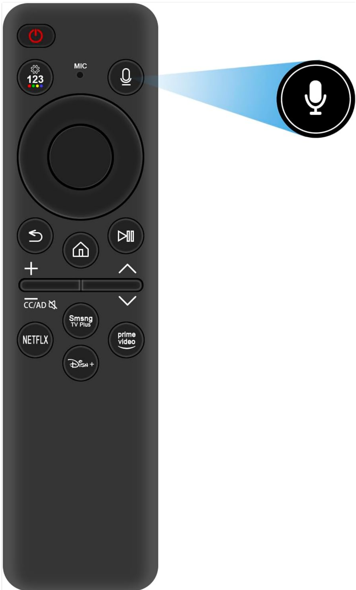
Image 4.2: The voice control button and microphone on the remote control.