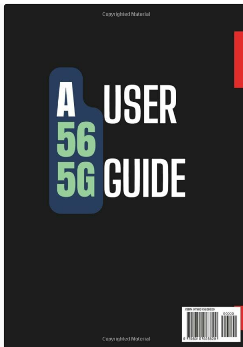
Image: Back cover of the user guide, illustrating the book's design and ISBN information.