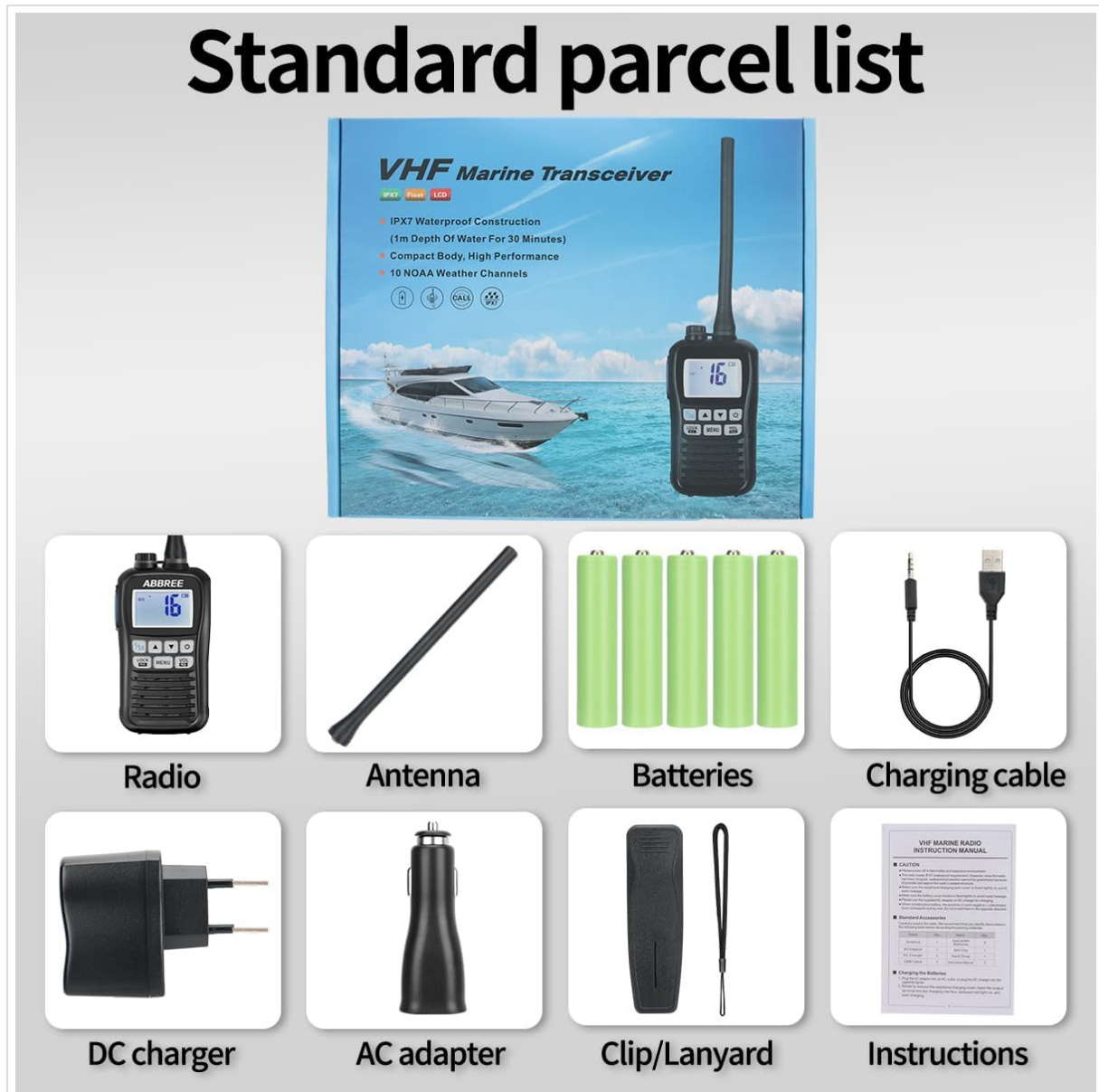
Figure 2: Standard package contents for the MR-25 radio.