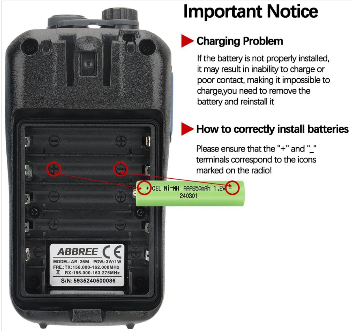
Figure 8: Important notice regarding battery installation and charging.

If the battery is not properly installed, it may result in inability to charge or poor contact, making it impossible to charge. You need to remove the battery and reinstall it, ensuring the "+" and "-" terminals correspond to the icons marked on the radio.