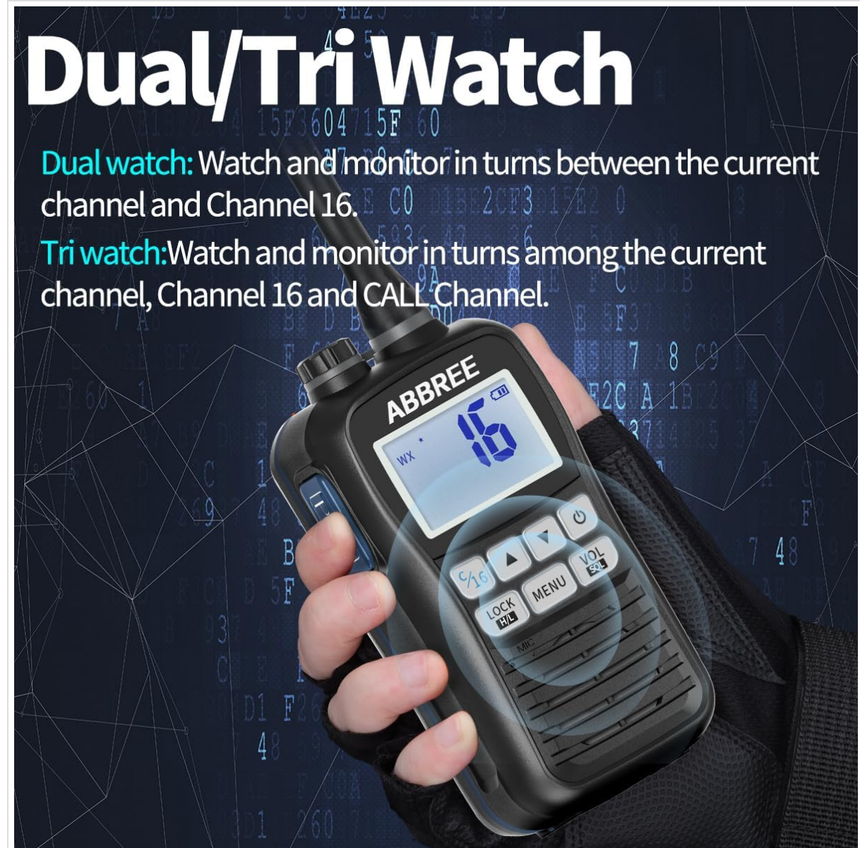
Figure 5: Explanation of Dual/Tri Watch functionality.