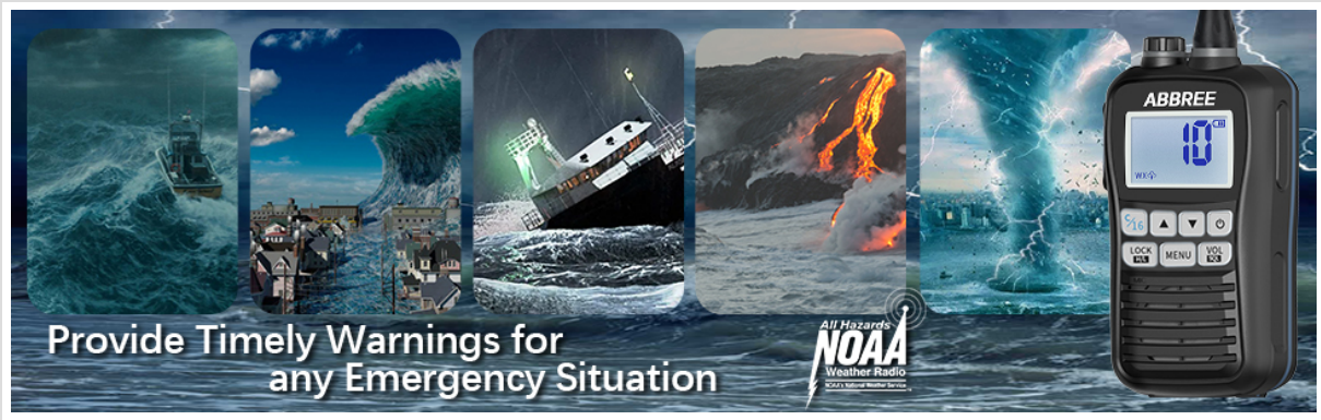
Figure 6: NOAA Weather Alert feature for emergency situations.