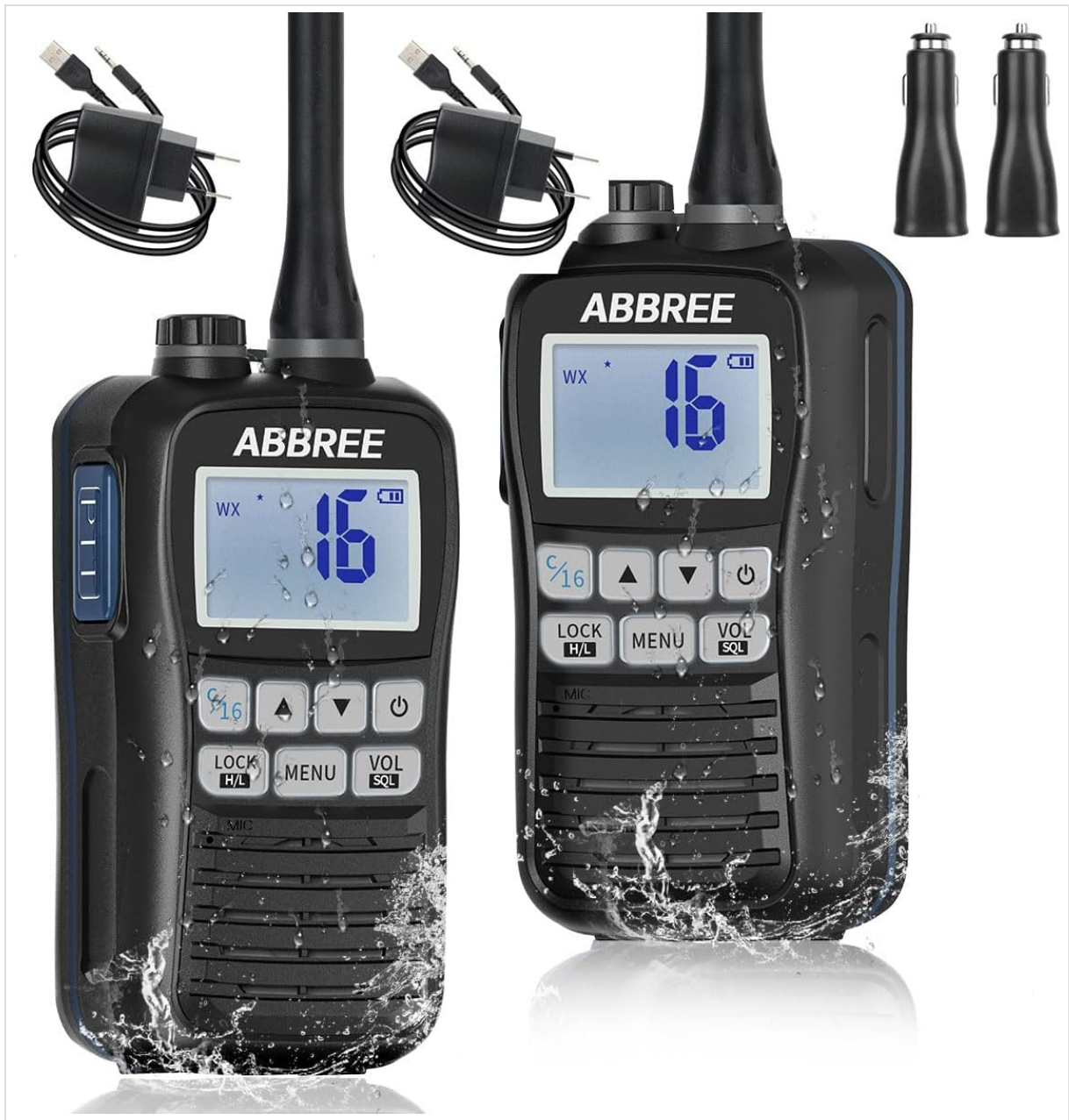
Figure 1: ABBREE MR-25 Marine Radios and accessories.