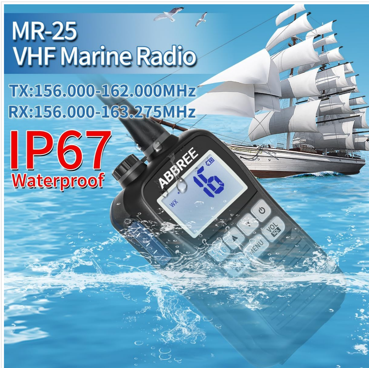
Figure 9: IP67 Waterproof and Frequency Range details.

Note: IP67 Waterproof means the device can be submerged in up to 1 meter of water for up to 30 minutes. The radio also floats.