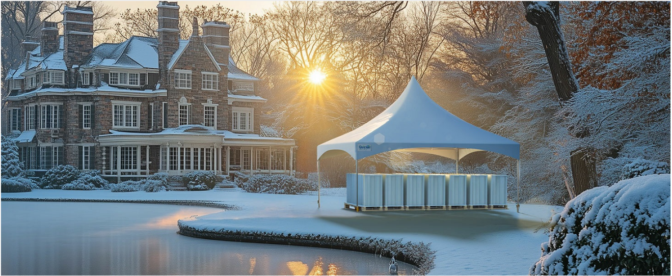
Image: The Quic Tent canopy tent set up for a large outdoor event, demonstrating its commercial-grade suitability.