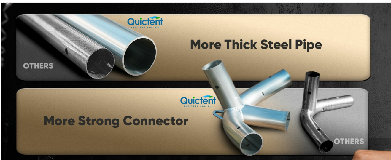
Image: Close-up of the tent's thicker steel pipes and reinforced connectors, highlighting structural integrity.

The tent features a robust high peak frame designed for stability. Components include thicker steel pipes and strong connectors.