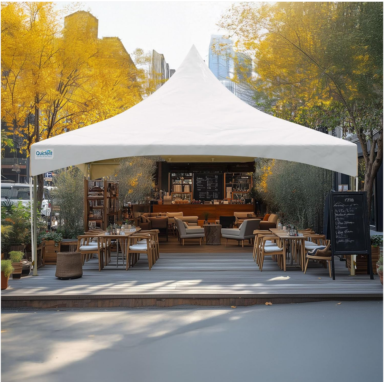
Image: An assembled Quicent 20x20 Heavy Duty Canopy Tent in an outdoor setting, demonstrating its high peak design and overall structure.