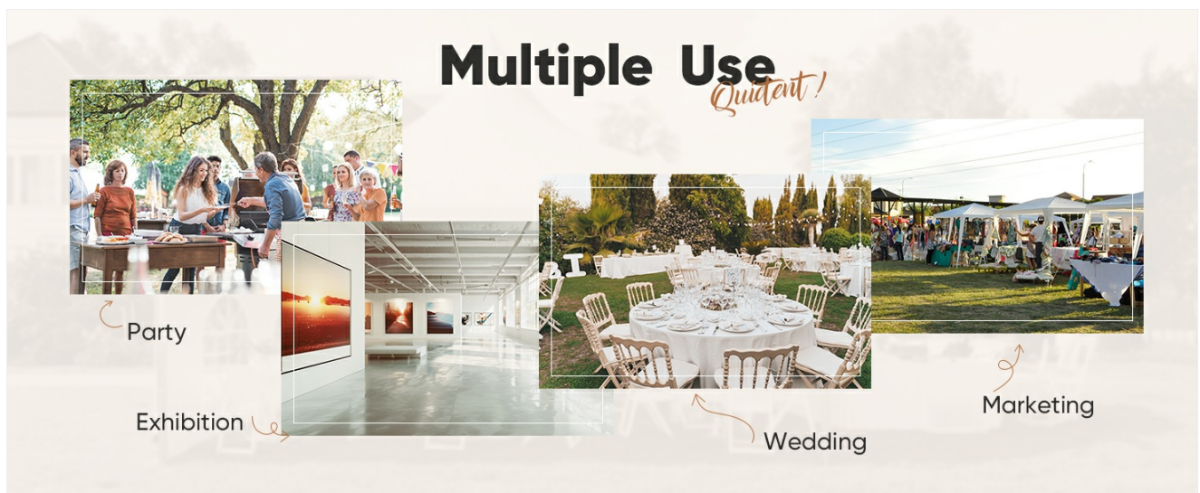
Image: Various scenarios illustrating the tent's versatility for birthday parties, commercial uses, temporary parking, and weddings.